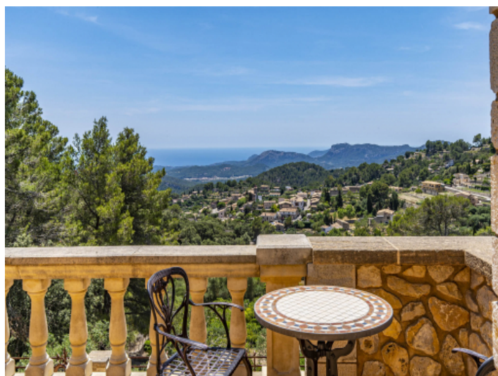
Splendid landscape view