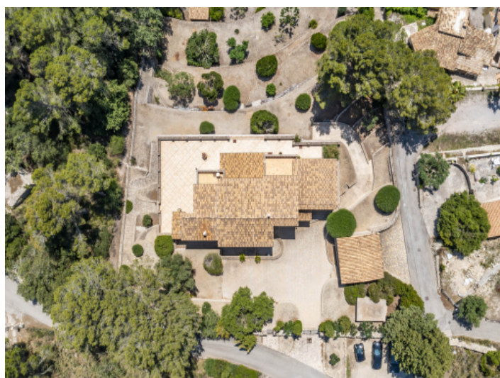
Finca from a birds-eye view