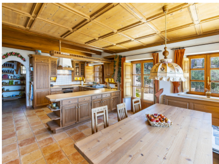
Rustic kitchen and dining area