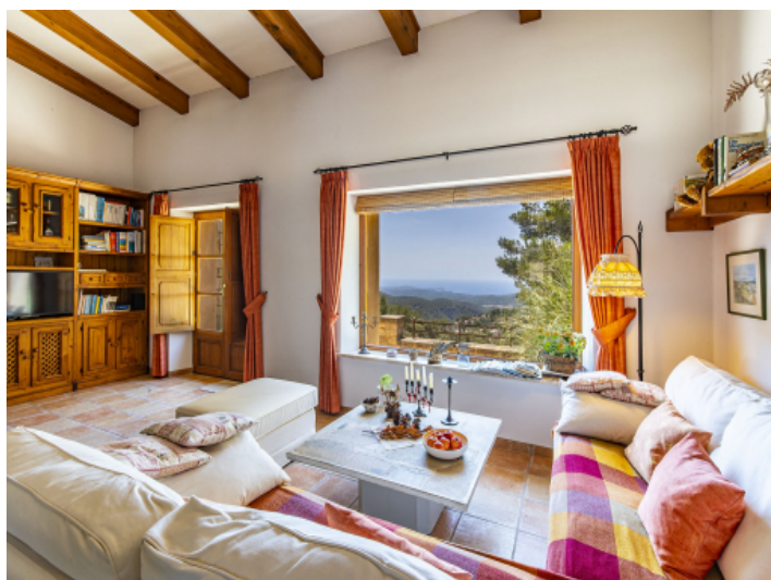
Living area with picturesque views