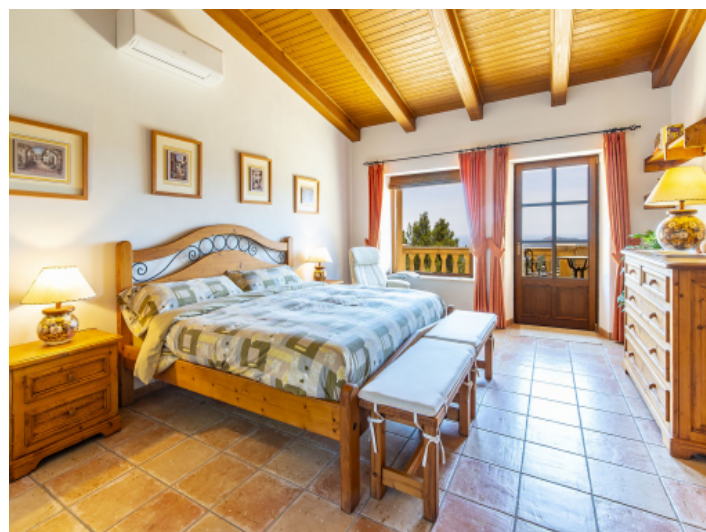
Light flooded master bedroom