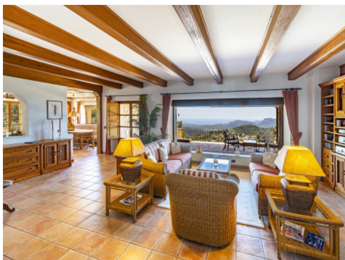
Living area with picturesque views