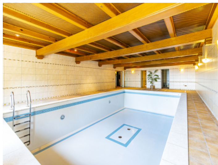
Fantastic indoor pool