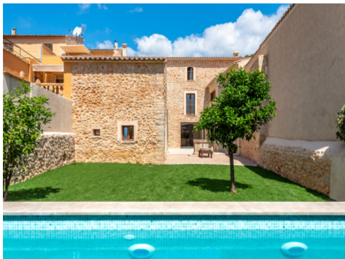
Townhouse with pool