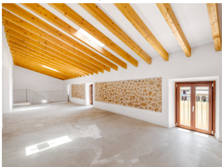
Beautiful wooden ceiling beams