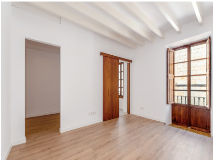
One of 5 bedroom