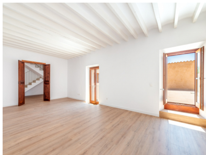
Upper floor with terrace access