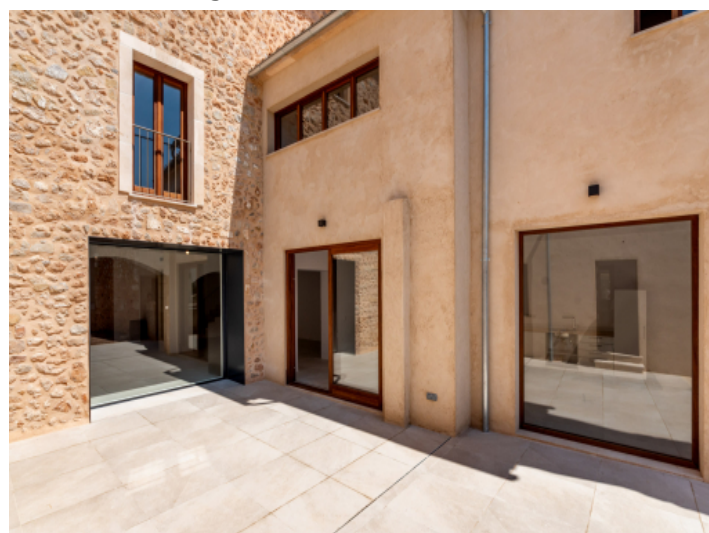
Large sunny inner patio