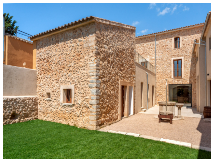
View of the house with terrace