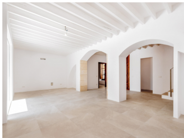
Living area with vaulted stone arches