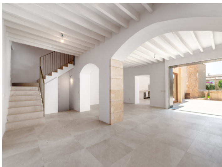
Living area with garden access