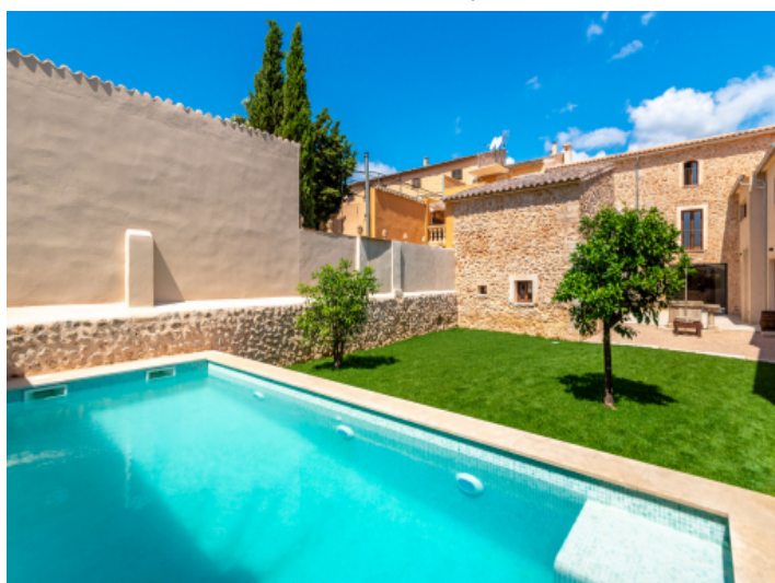
Sunny pool and garden area