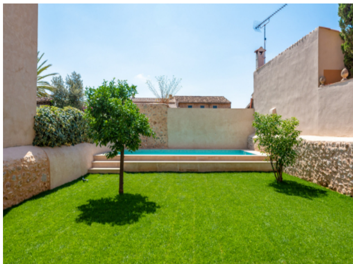
Beautiful garden with pool