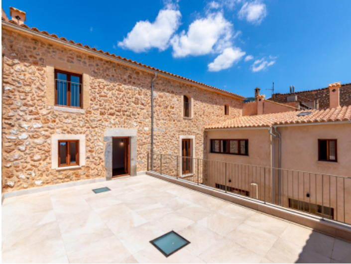
Large sun terrace