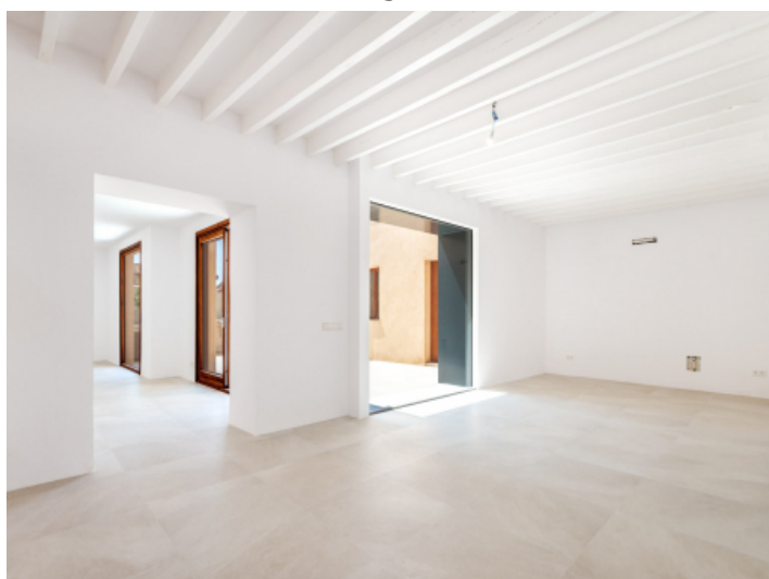
Open living area with patio access