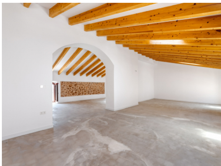
Large top floor