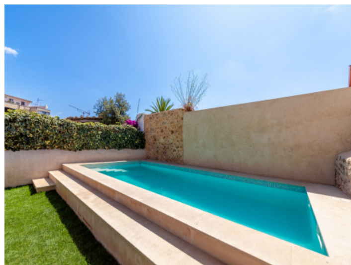
Relaxing pool area