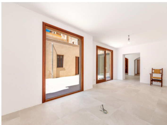
Patio access from another side