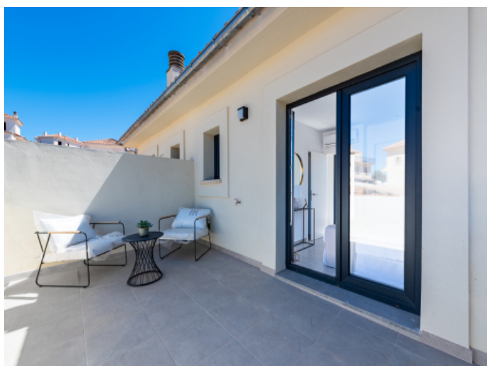
Terrace on the upper floor