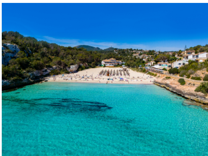
Beach close to the house