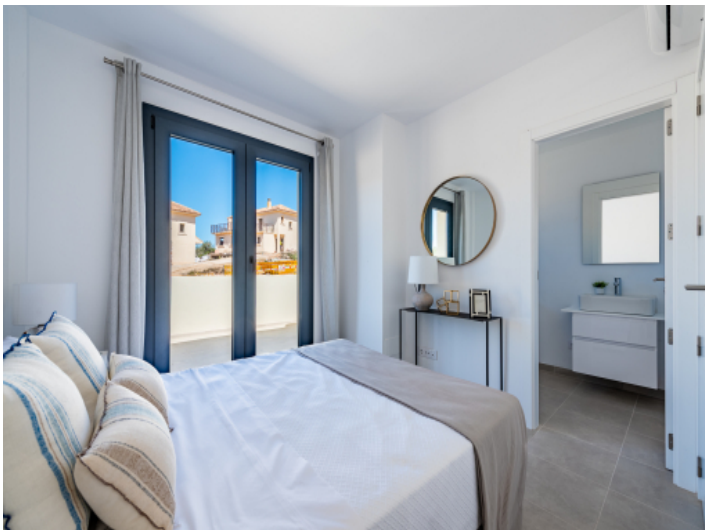
Masterbedroom with bath en suite