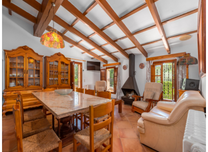
Living and dining area with fireplace