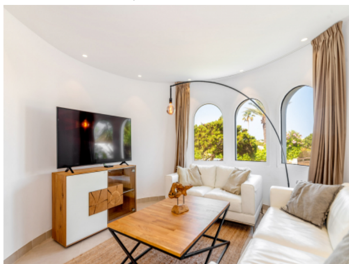
Cozy living area