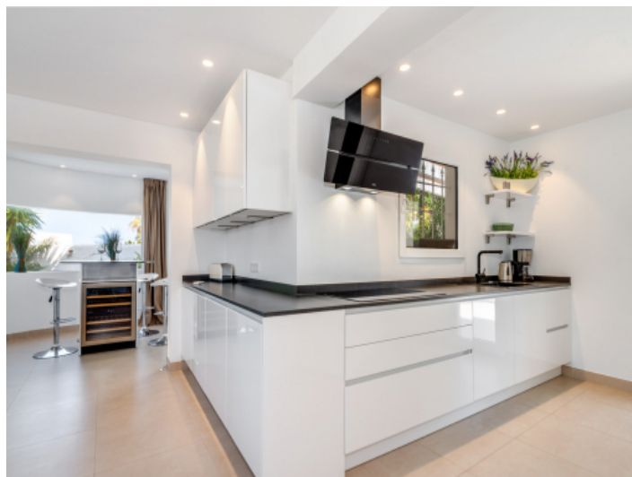
Modern kitchen in white