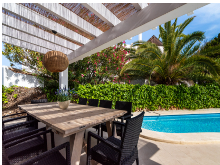
Covered pool terrace with dining area