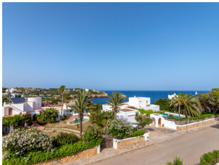
Splendid sea views