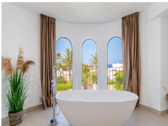
Free standing bath tub