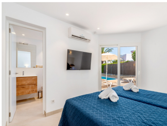
Another bedroom with bathroom en suite