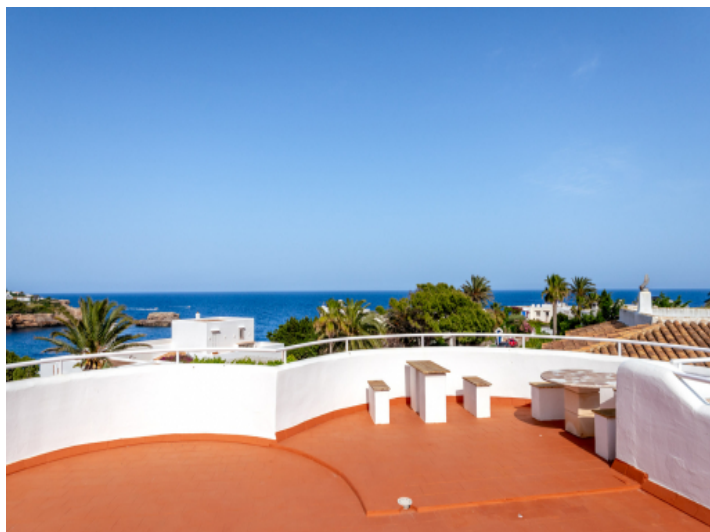
Sea view roof terrace