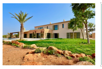
Llucmajor search for property MAL-119981