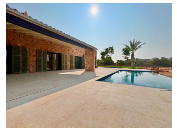
Large pool area