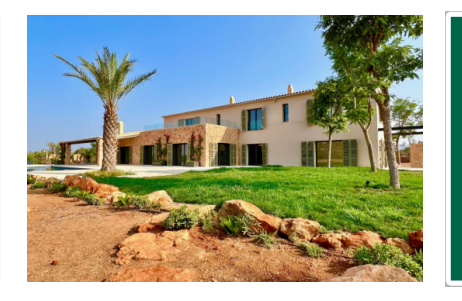
Llucmajor search for property MAL-119981