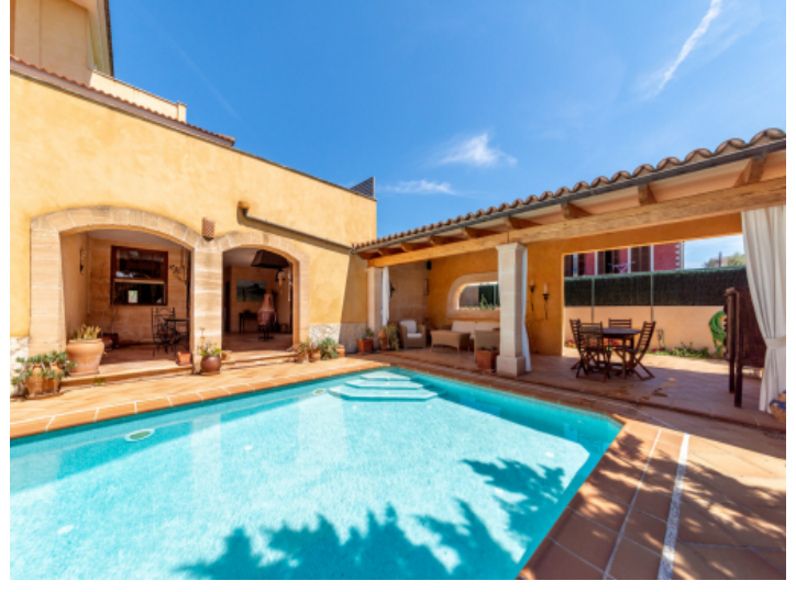
Pool area and covered terrace