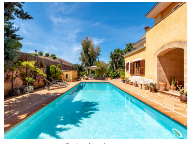
Pool and garden area