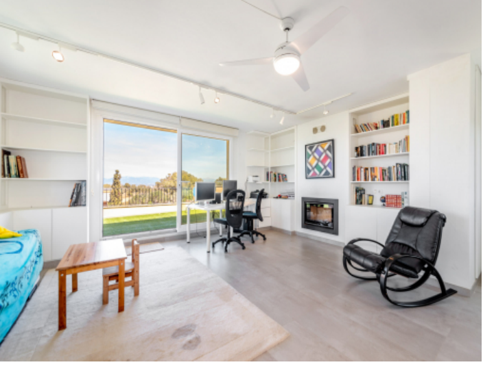
Bedroom with terrace