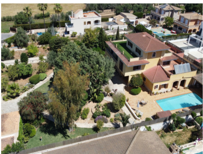
Townhouse villa with pool in Llucmajor