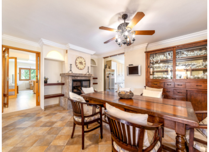
Rustic dining area