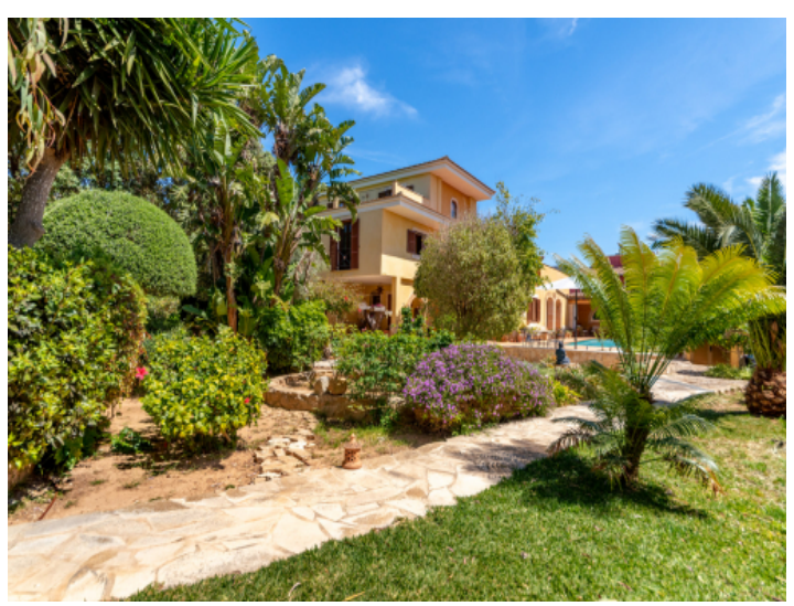
Garden and exterior area of the townhouse