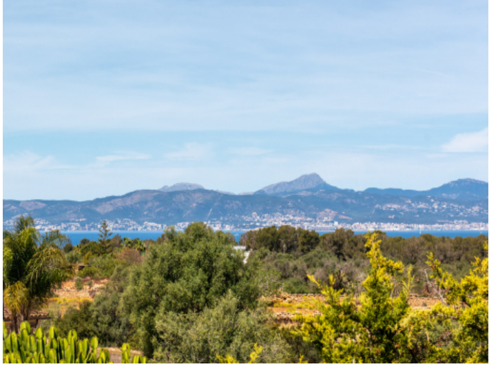
Splendid views to the sea