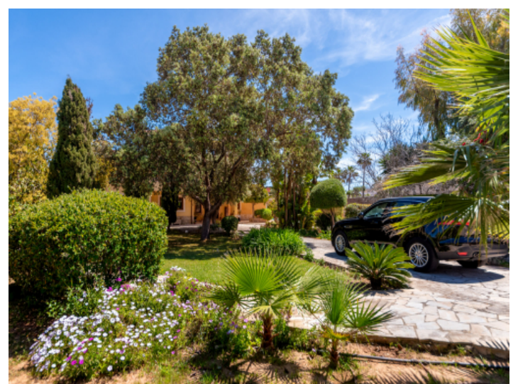
Garden and exterior area of the townhouse