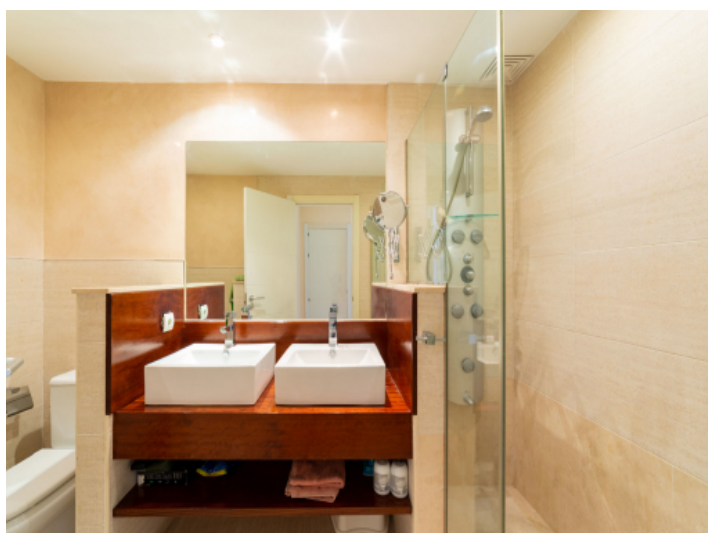
Bathroom with a shower