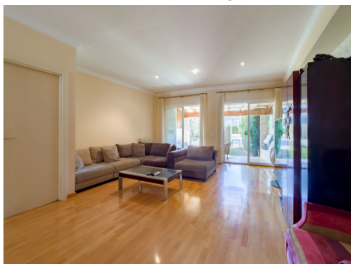
Living room with direct access to the terrace