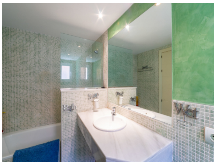
Bathroom with a bathtub