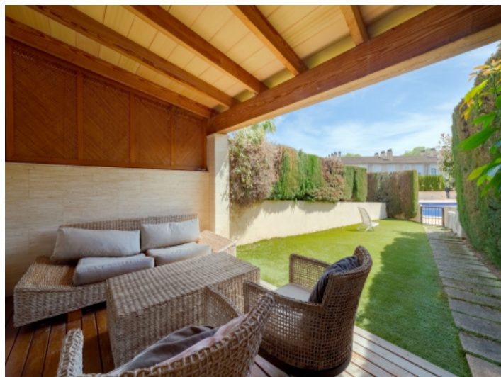
Covered terrace and the garden