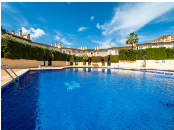
Large community pool