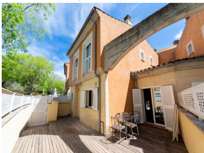
Sunny terrace with seating