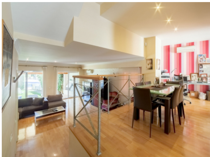
Beautiful dining area