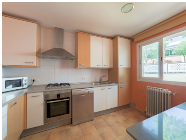
Bright, fully equipped kitchen