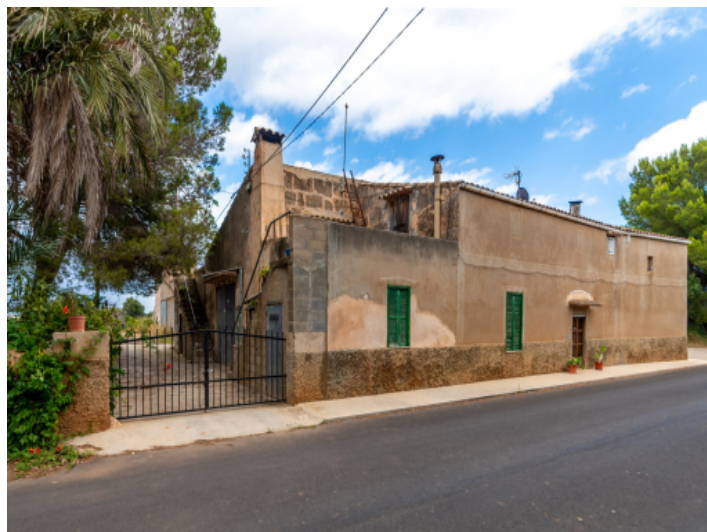
Views from the street to the finca