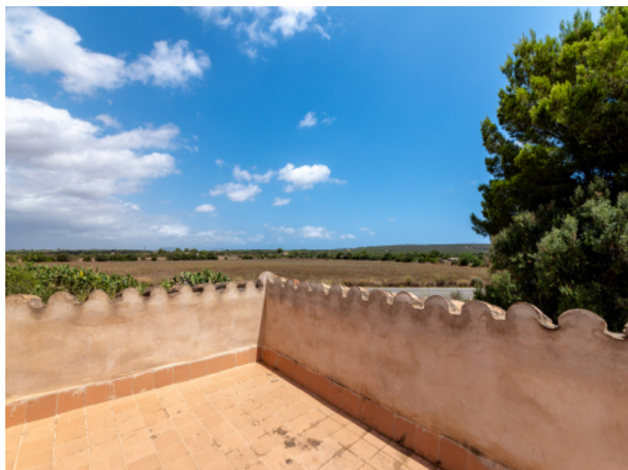
Impressive landscape views from the roof terrace