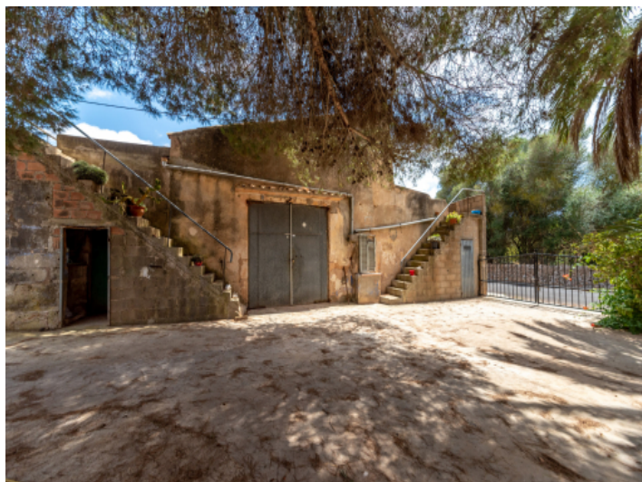
Access to the plot