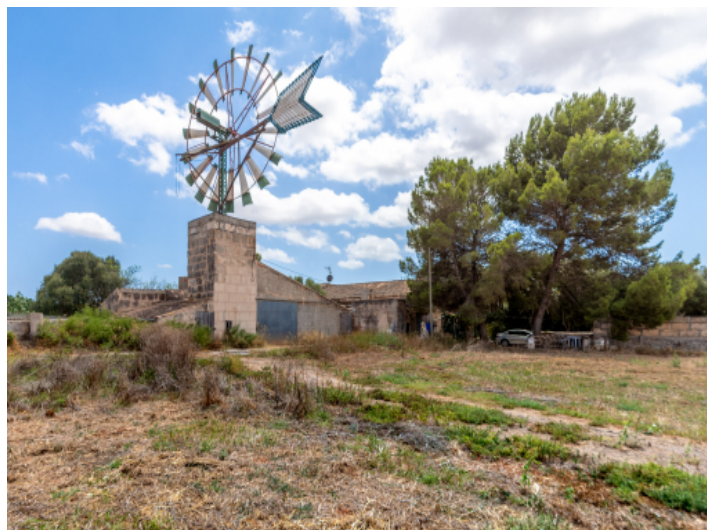
Spacious plot with a windmill