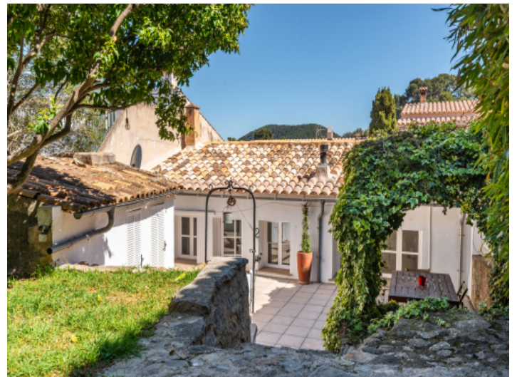
Enchanting outdoor area