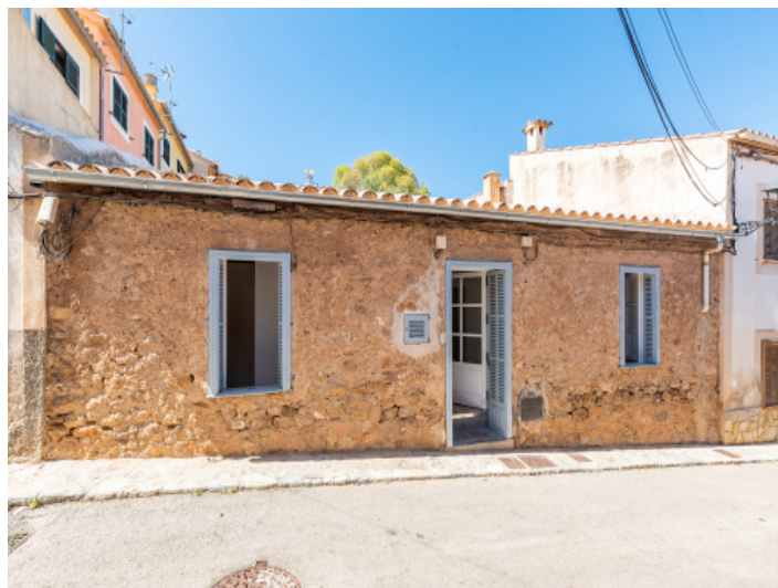
Natural stone façade