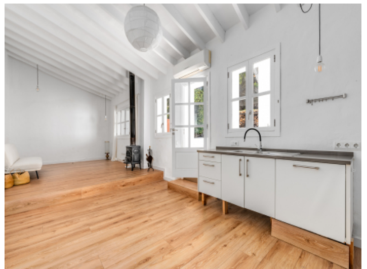
Open, modern kitchen