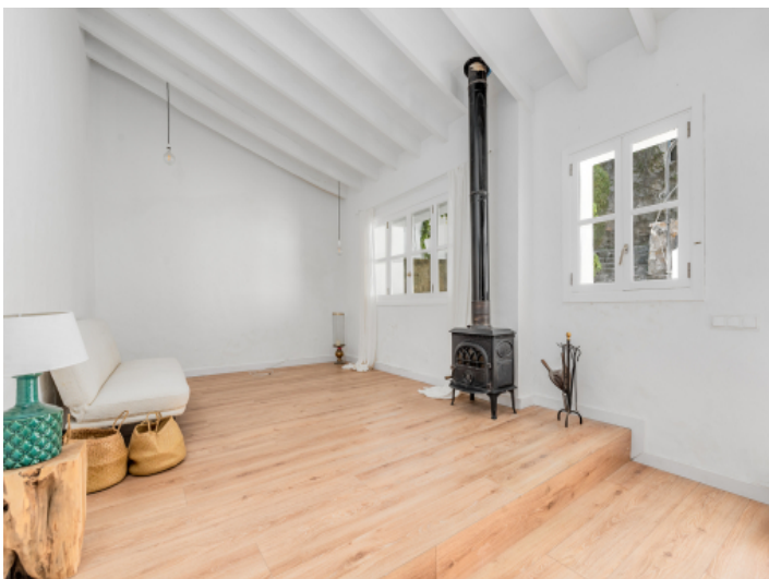
Living area with a stove