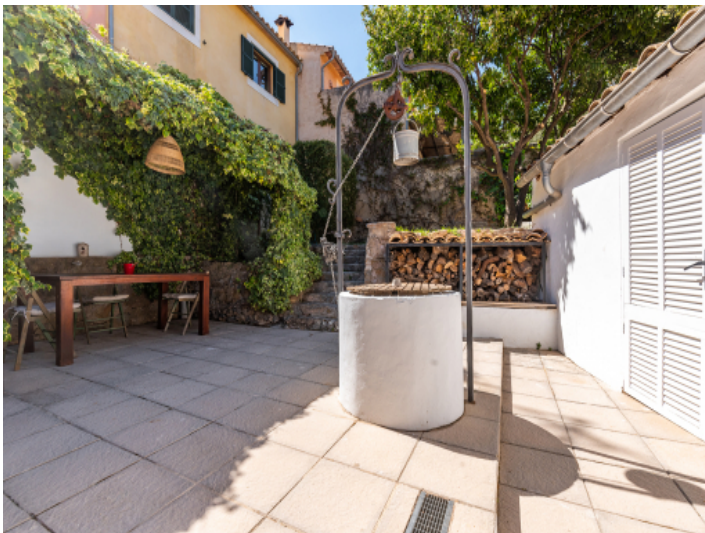
Sunny terrace with a well