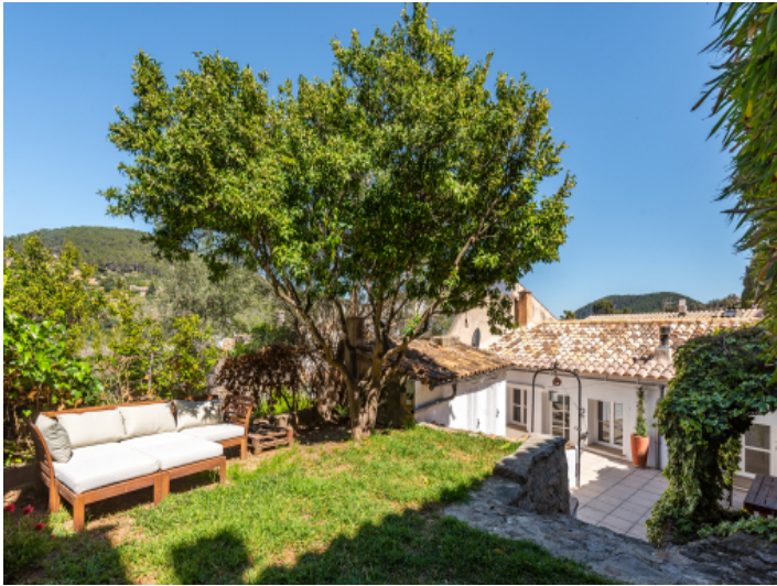
Garden with seating