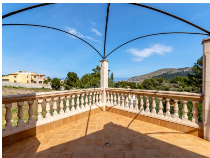
Terrace with sweeping views