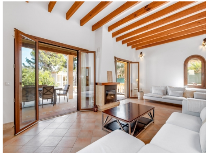
Living area with fireplace and terrace access