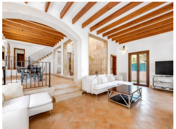
Living and dining room on 2 levels