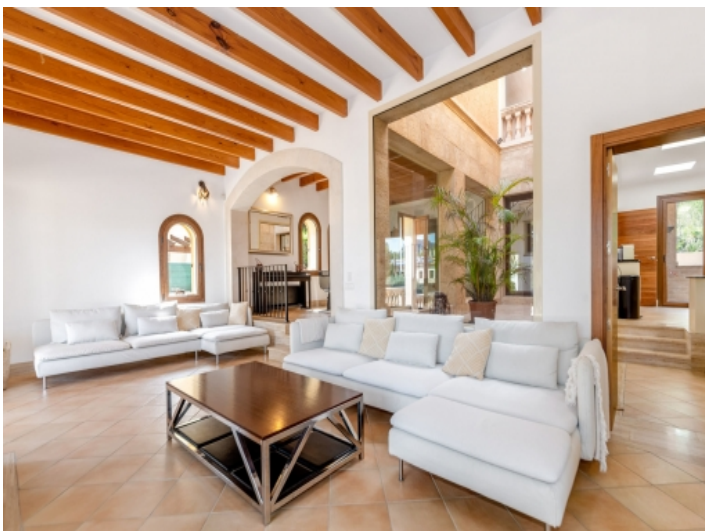
Beautiful living room with high ceilings