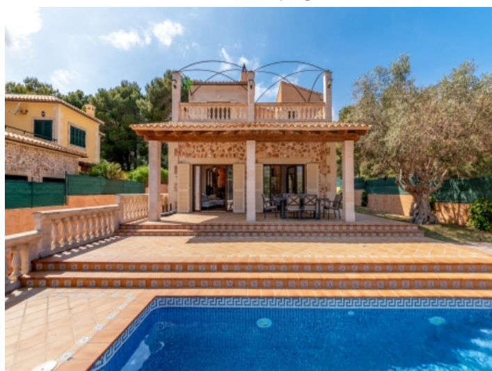
Alternative view of the villa