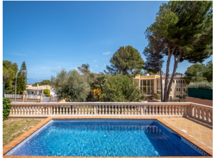
Sunny pool area