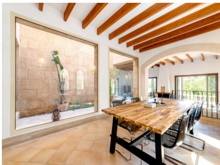
Dining area with glazed patio