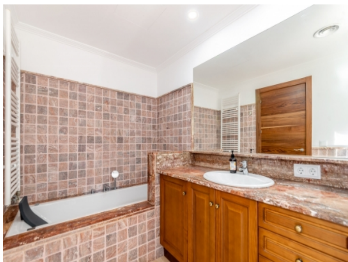
One of 3 bathrooms