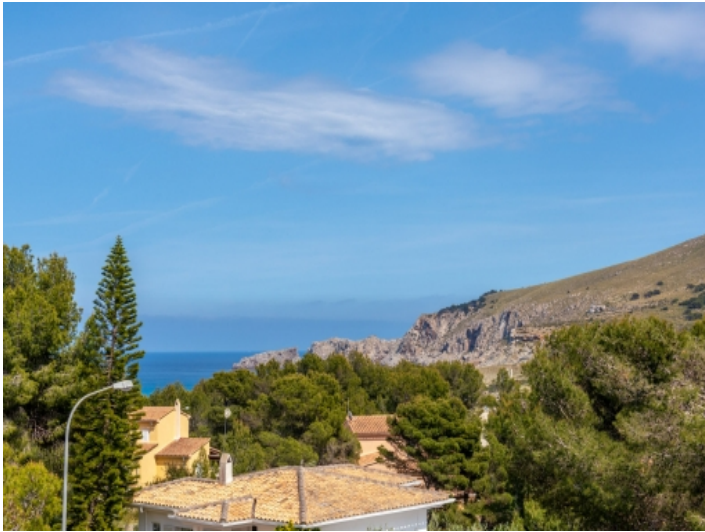
Beautiful sea views