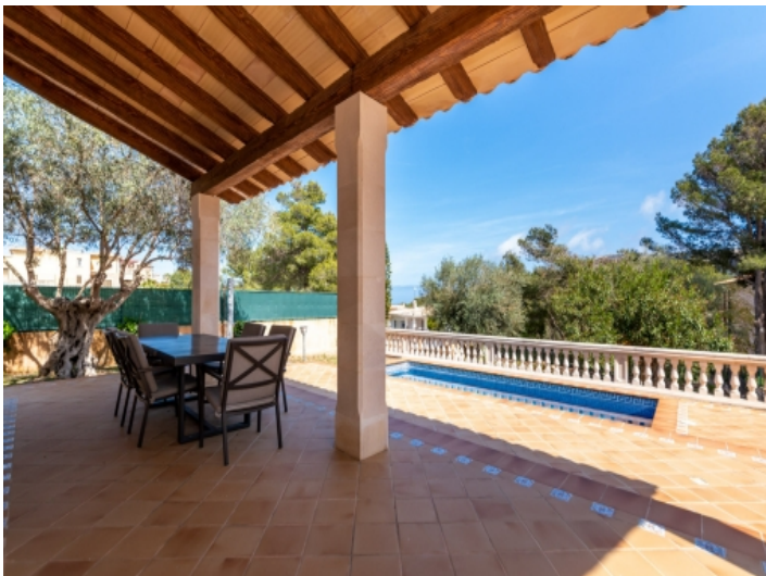
Covered terrace with dining area