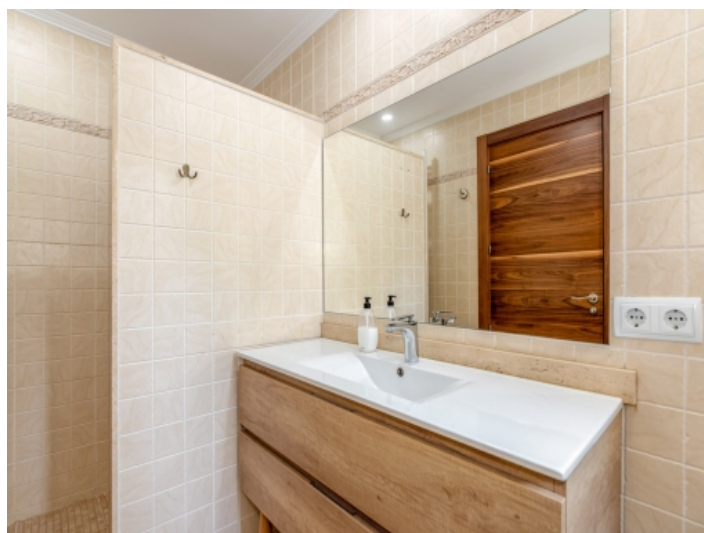
One of 3 bathrooms