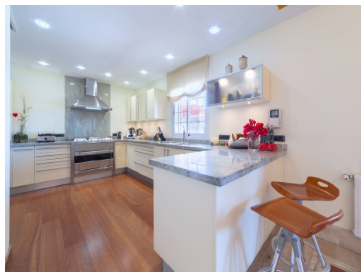
Modern, fully equipped kitchen