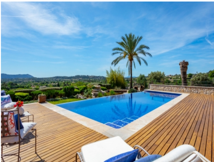
Large pool with sweeping views