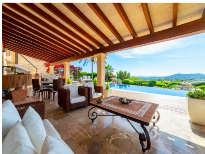
Fabulous covered terrace with fantastic views