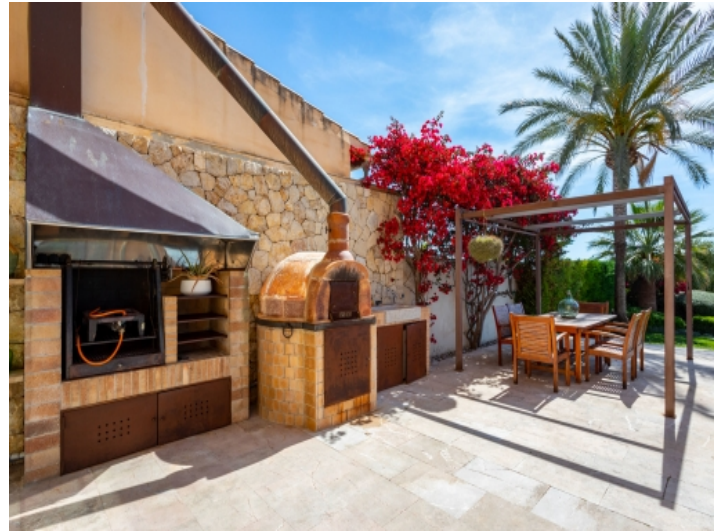
Spacious BBQ area