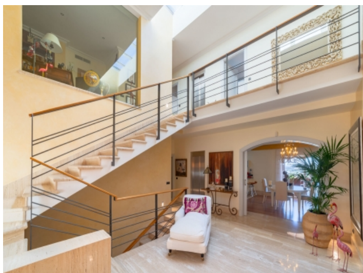
Impressive entrance hall