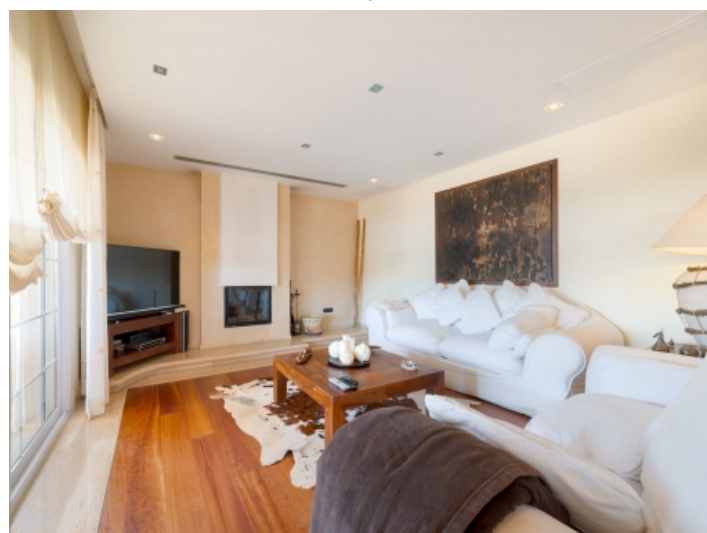
Cosy living room