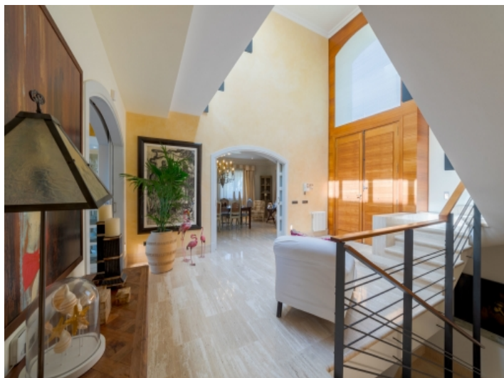
Entrance area with high ceilings