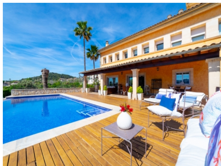
Luxurious pool area