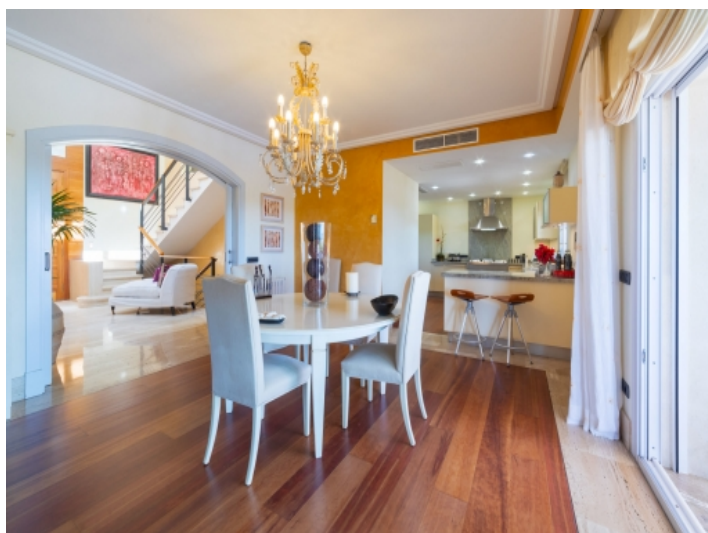
Open dining area