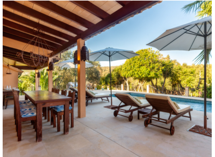
Covered terrace with pool views