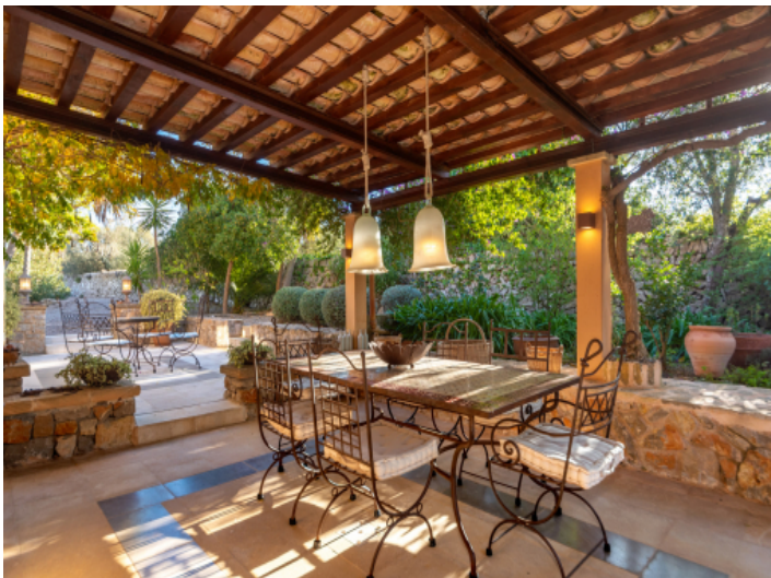
Garden views from the covered terrace