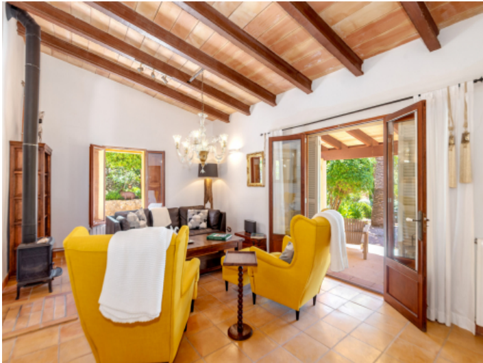
Bright and cosy living area