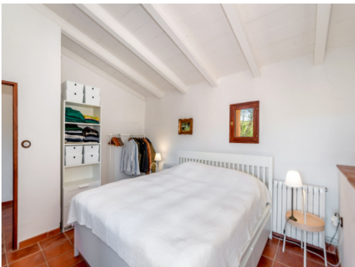
Master bedroom upstairs