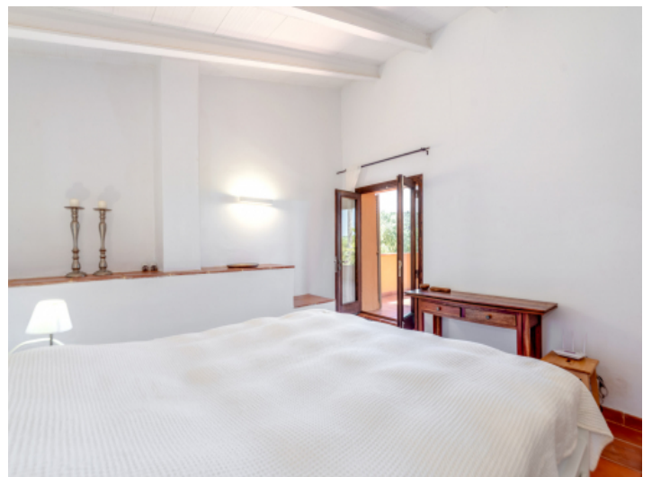
Master bedroom upstairs