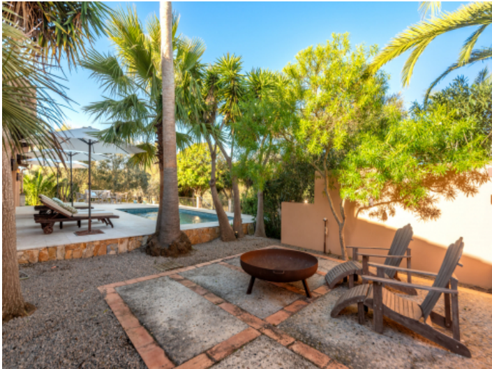
This area invites for cosy nights at the fire bowl