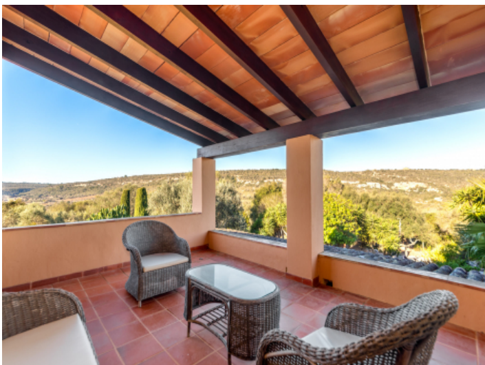
Unique landscape views from the balcony