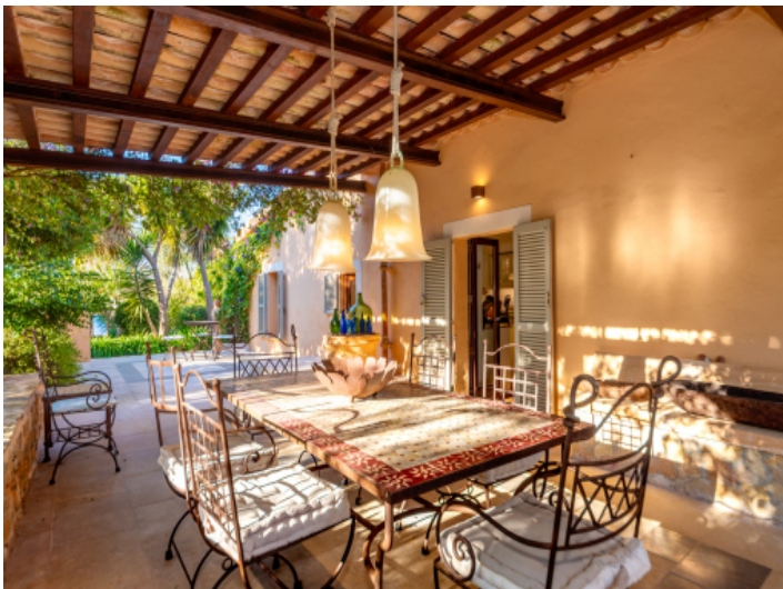
Mallorquin covered terrace