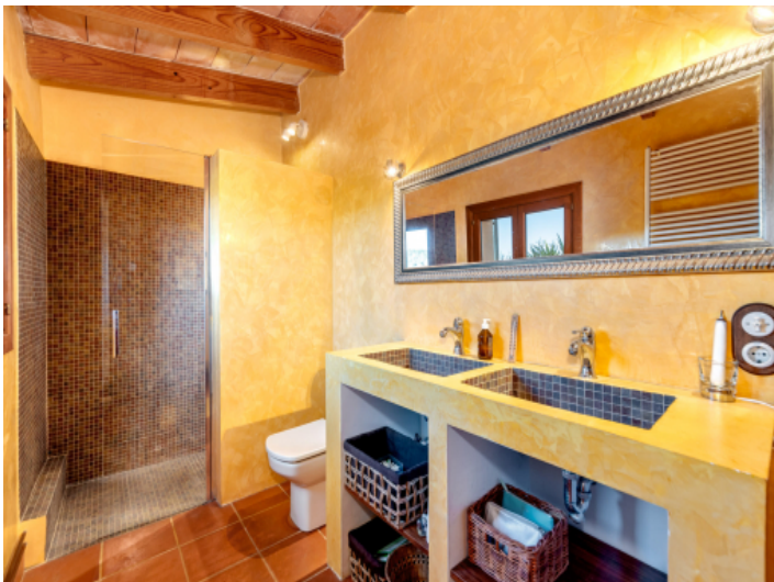
Bathroom with two washbasin