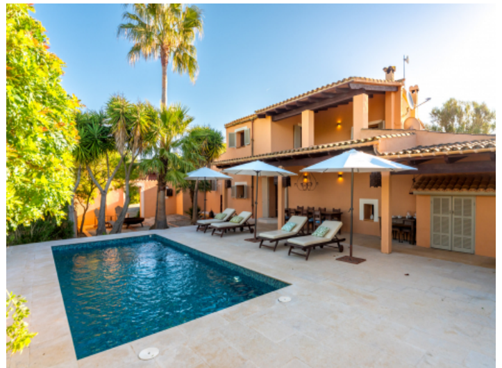
Pool is surrounded by a terrace