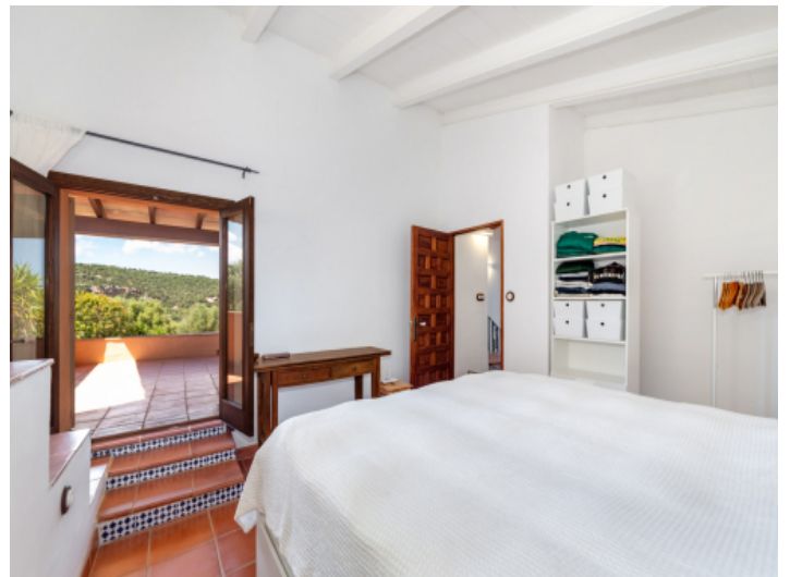
Master bedroom upstairs