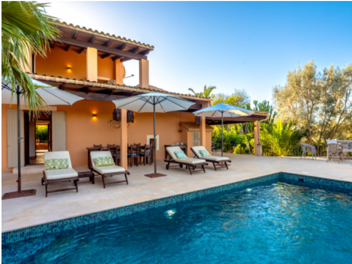
Cosy terrace with pool