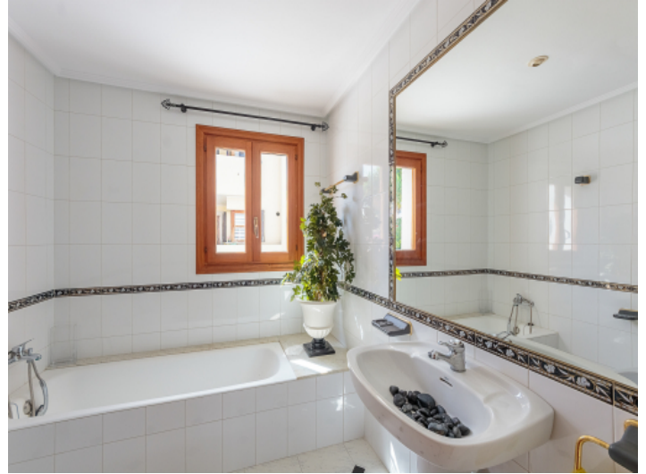
Bathroom with bathtub