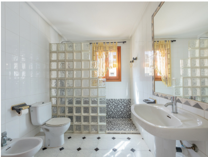
Bathroom with shower