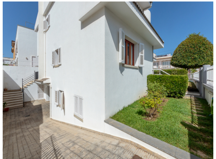
Private parking space