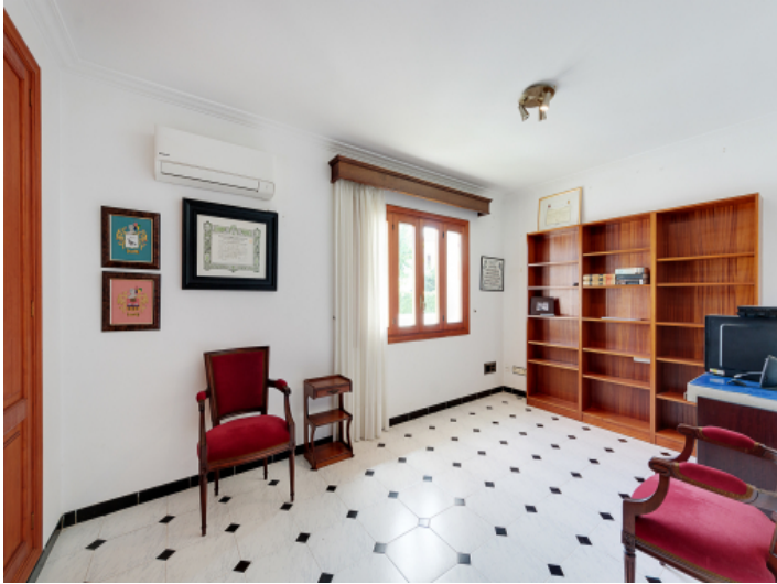
Room with a lot of possibilities