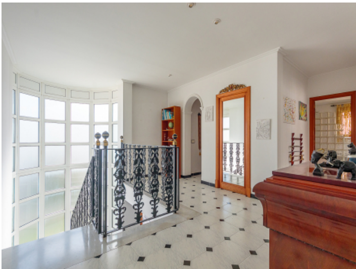
Upper floor from the villa