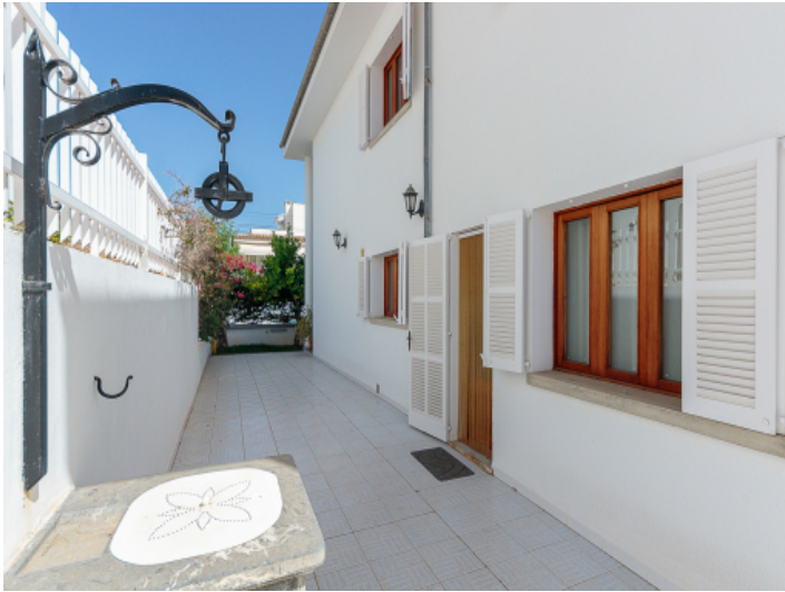
Entrance from the house