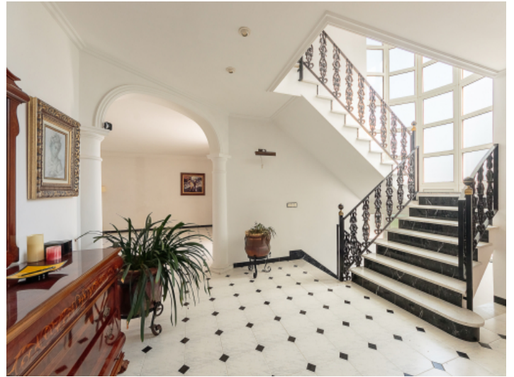
Hall from the villa