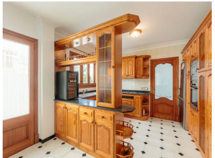
Fully equipped kitchen