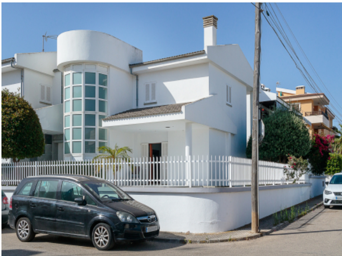
Views to the front from the villa

PORTA MALLORQUINA • C./ COLOM 20 2º, 07001 PALMA, SPAIN