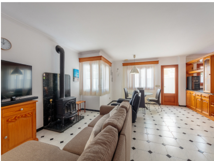
Living area with fireplace