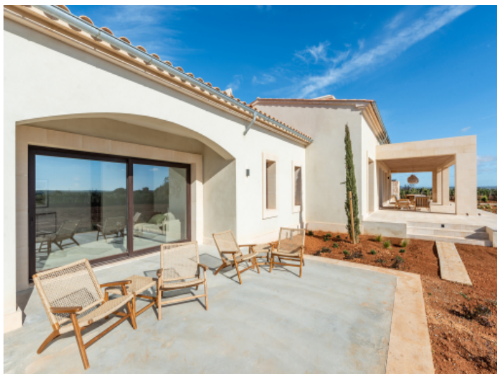
Guest house terrace