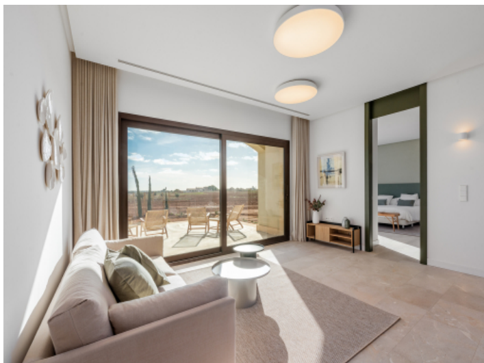
Guest house - Living area