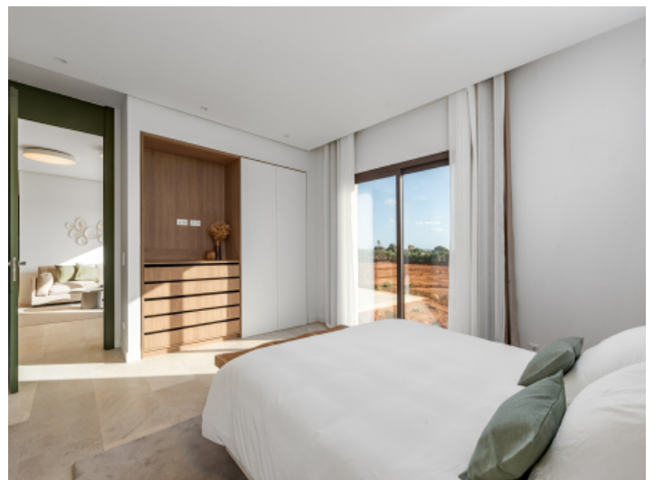
Guest house - Bedroom