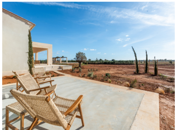
Guest house terrace