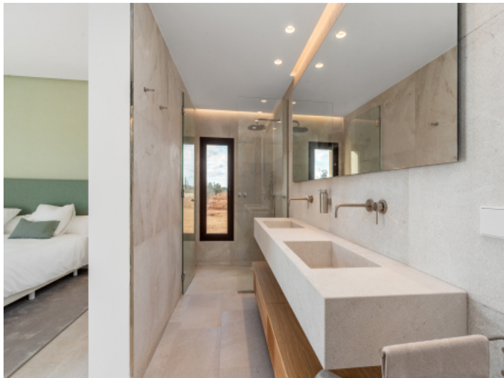
Guest house - Bathroom