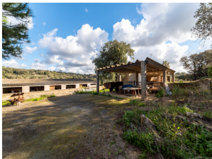
Garden area and stable