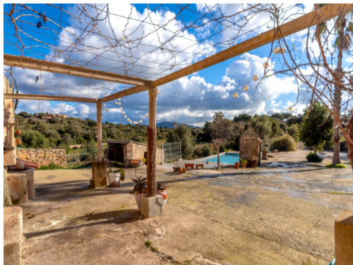
View to the pool