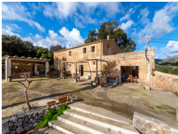
View to the finca