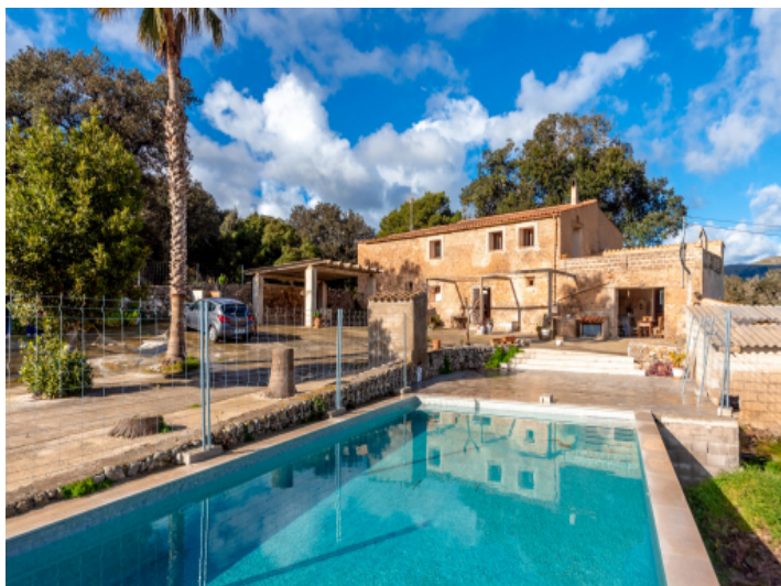
View to the finca