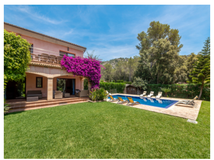
Very well mantained garden