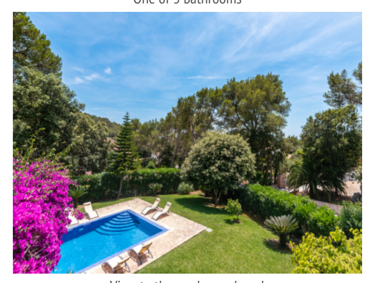
View to the garden and pool