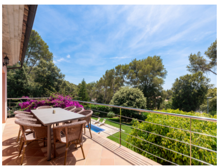
Terrace first floor