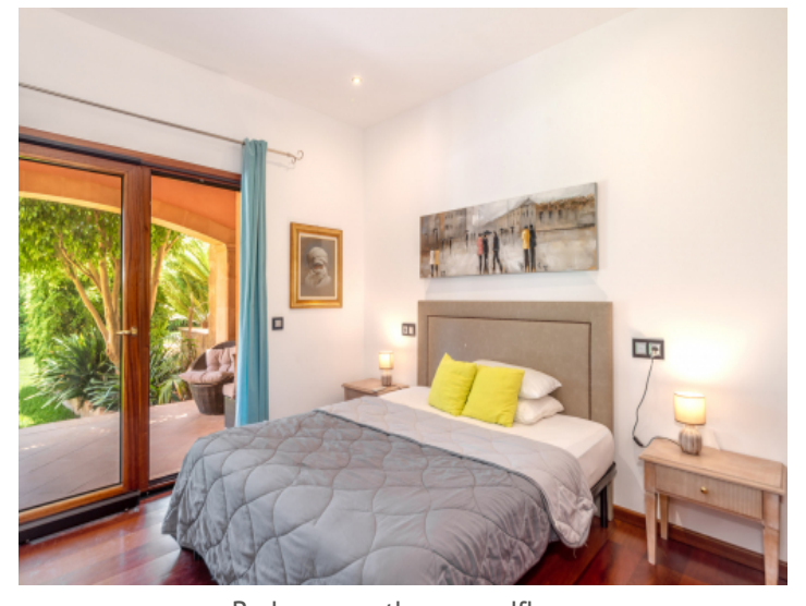
Bedroom on the groundfloor