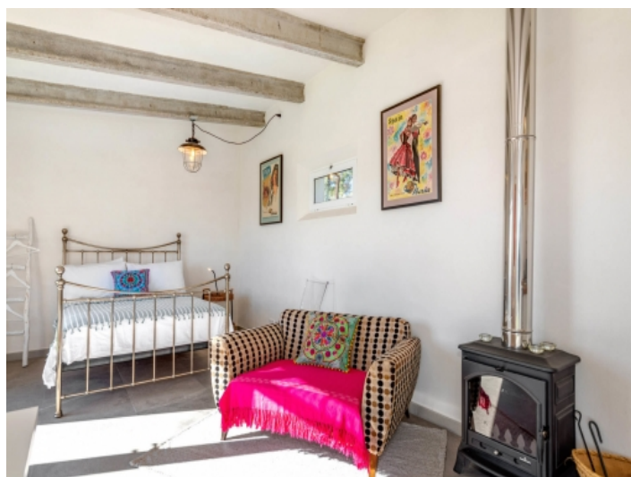
Open living and bedroom area with fireplace