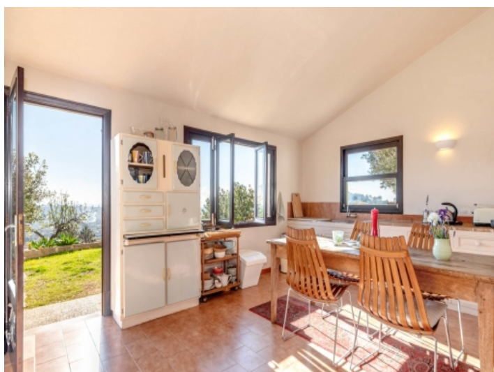
Kitchen and dining area with fireplace