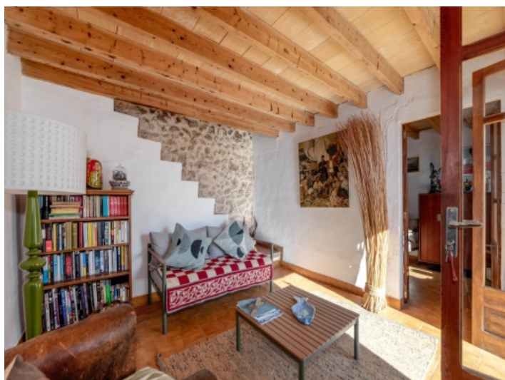
Rustic living area