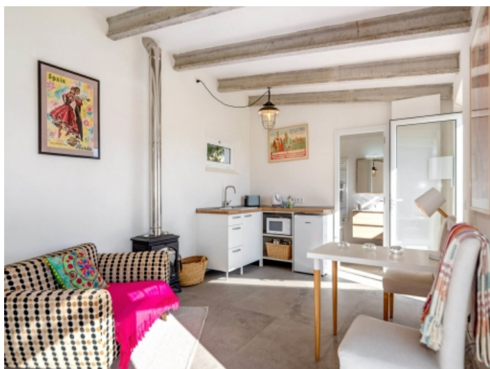
Open living and bedroom area