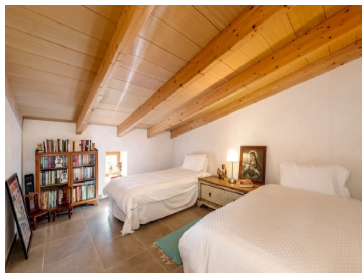
Another double bedroom