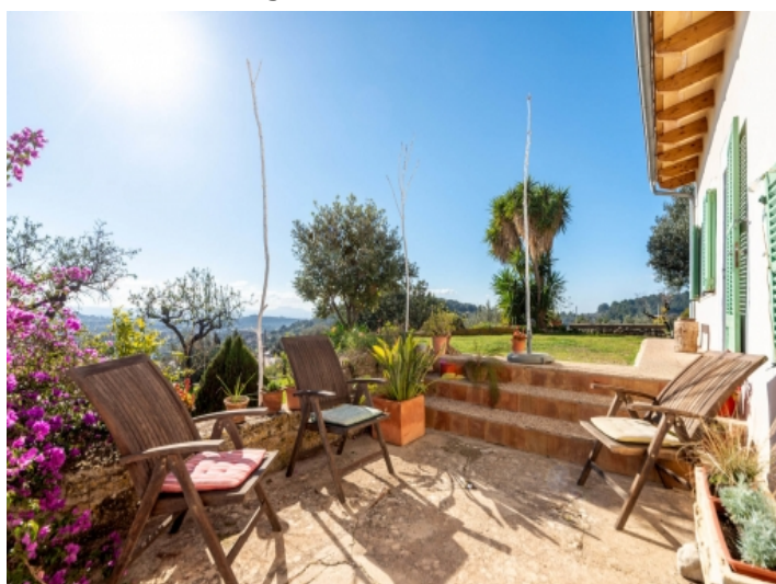
Inviting terrace in front of the house