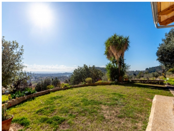
Splendid landscape views