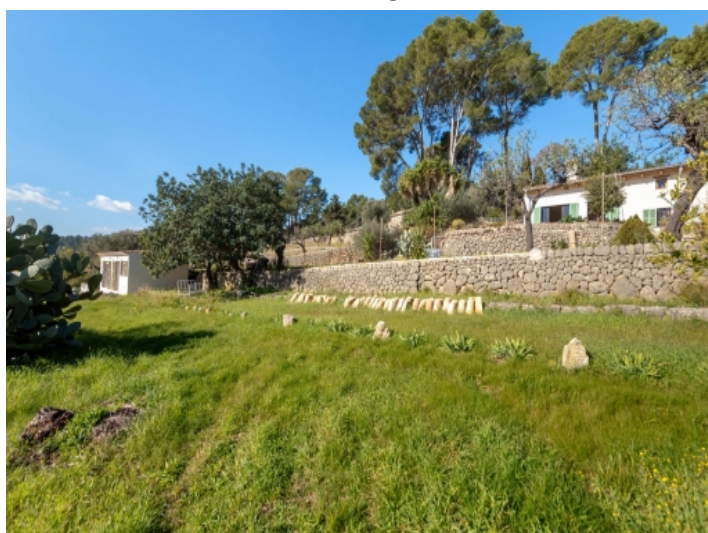
Garden and guest house view