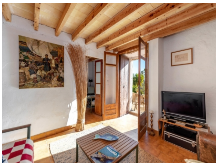
Rustic living area