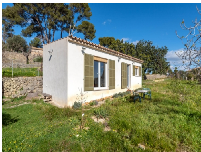
The guest house