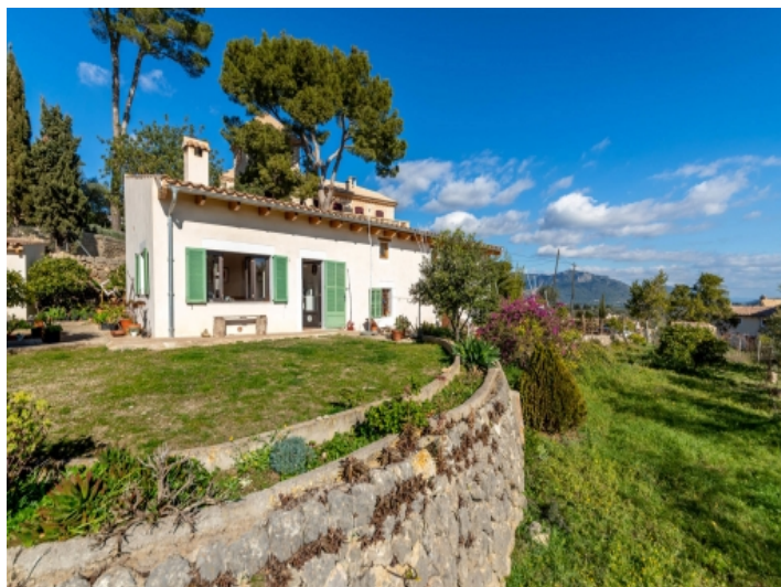
Finca with guest house and a view in Selva