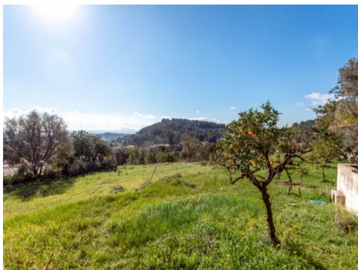
View of the garden