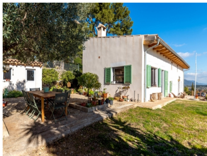
Exterior dining area