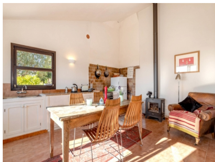
Kitchen and dining area with fireplace