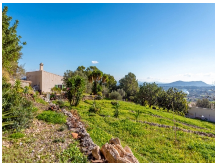
View of the garden