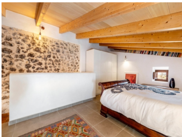
Bedroom with natural stone wall