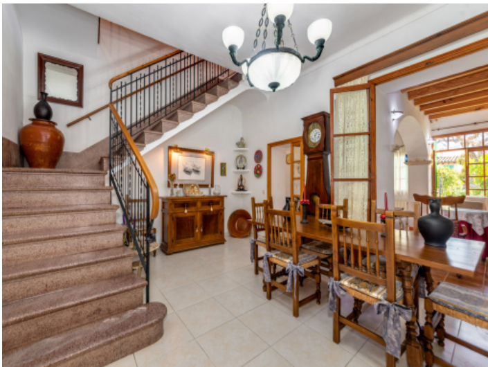
Spacious dining area with stairs