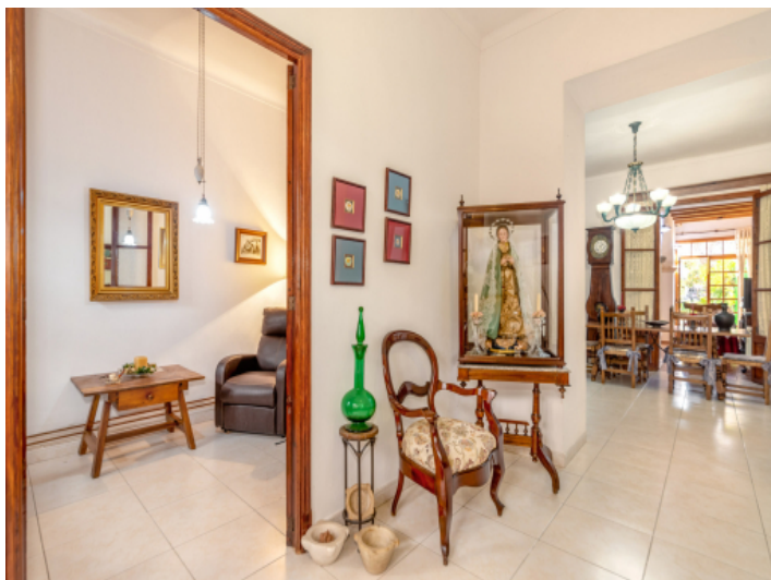
Hall on the ground floor^