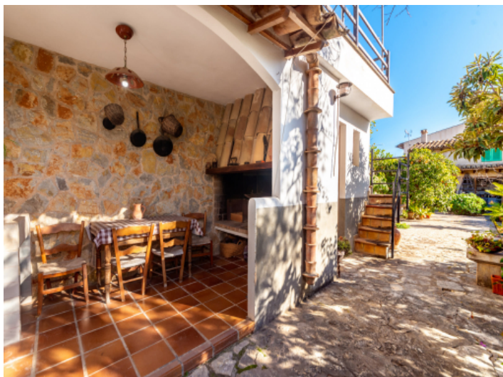
Covered bbq area in the outside