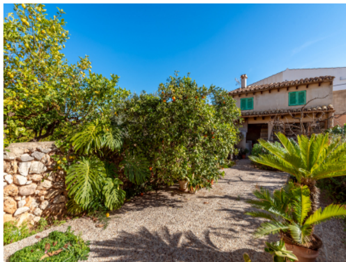
Lovely patio with ample space