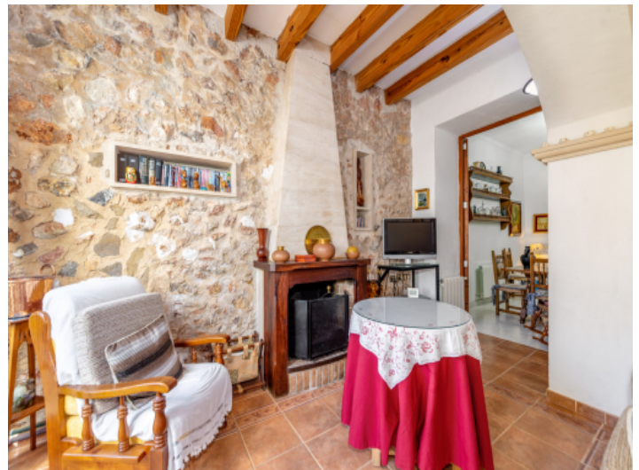
Fireplace area with rustic stone wall