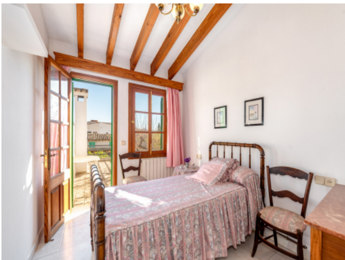
Bedroom with upper terrace