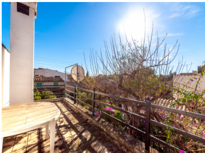
View from the upper terrace