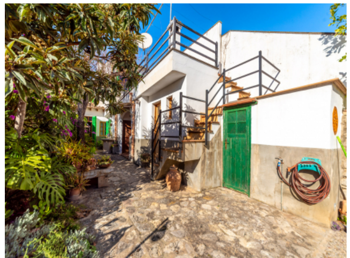
Beautifully planted patio