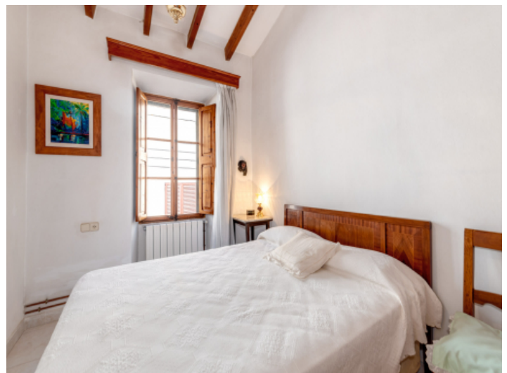
Double bedroom with wooden ceiling beams