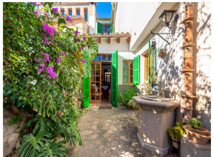
Patio with fountain