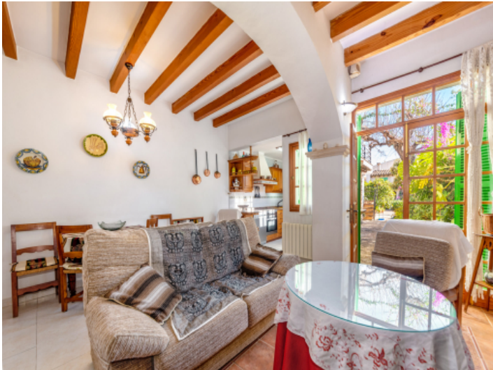
Lightflooded living area with patio access