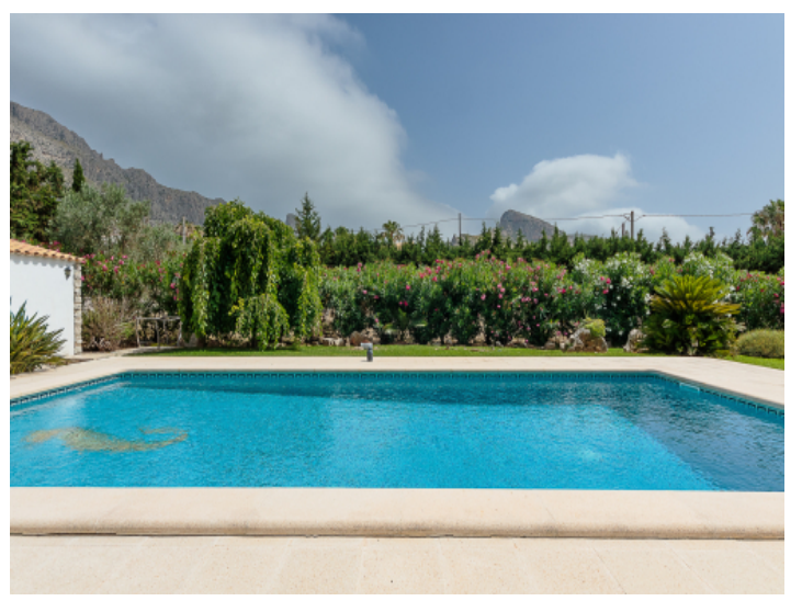
Inviting pool area