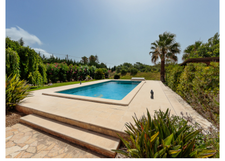
Terrace and pool