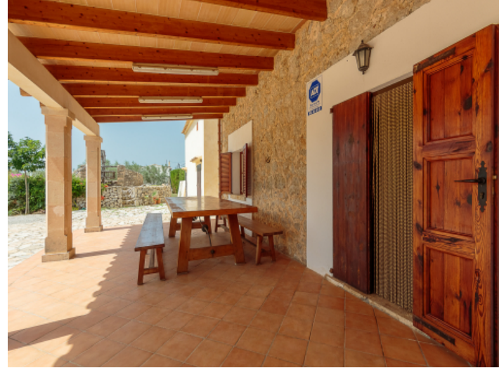
Covered dining area