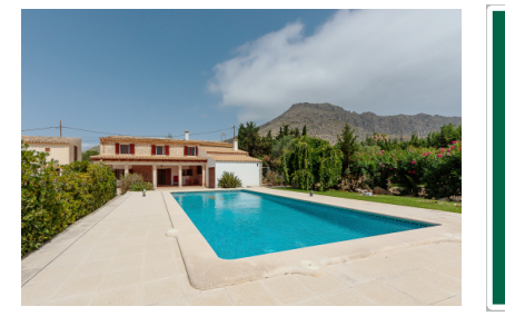
Pollensa search for property MAL-119446