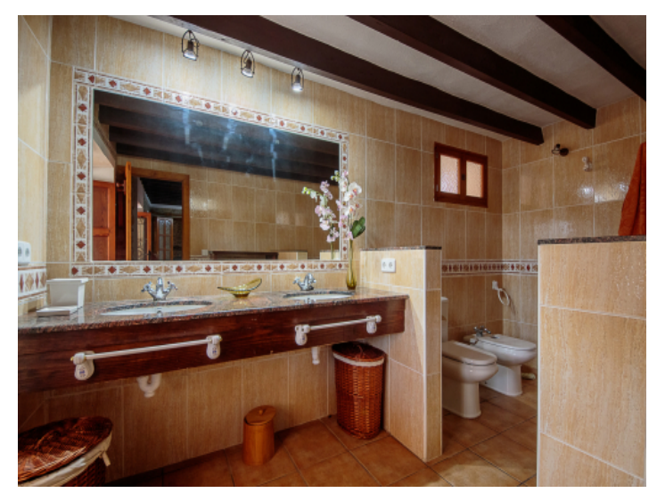
One of 2 bathroom