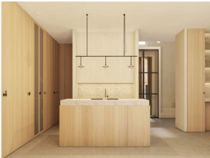
Open kitchen with island