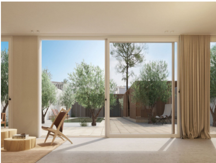
Access to the large outdoor area