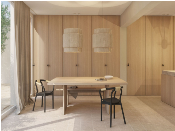
Adjoining dining area