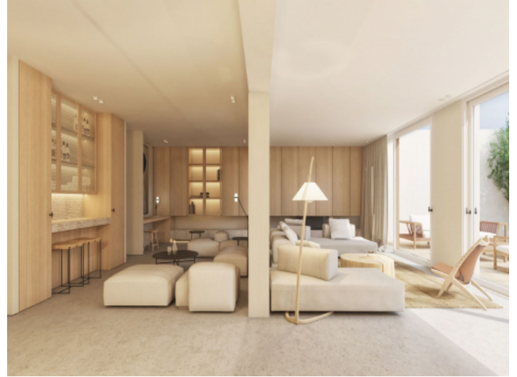
Living area divided into to areas