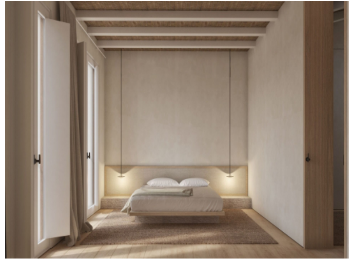
Master bedroom on the upper floor