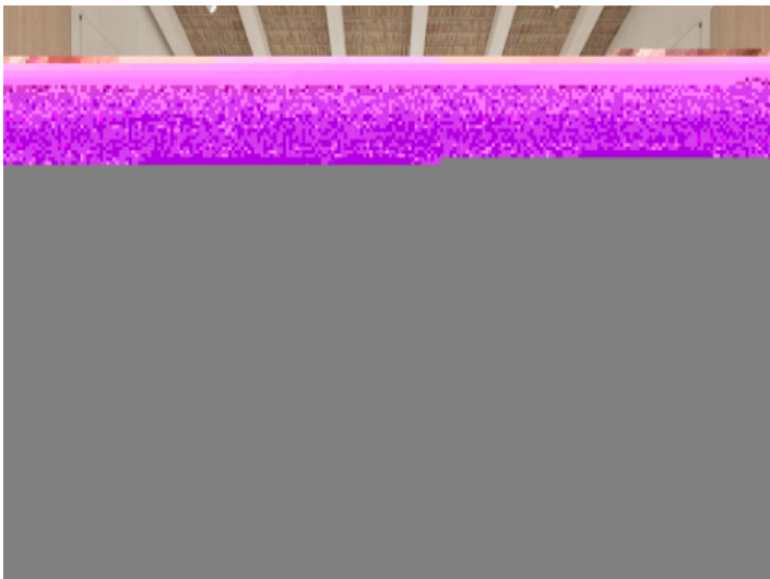
Bedroom with balcony