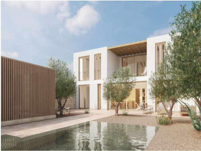
Mediterranean garden with pool