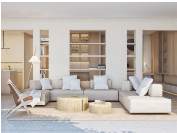
Generous living area