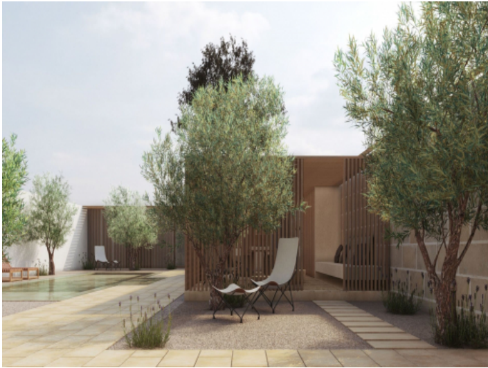
Garden with further building / guest house