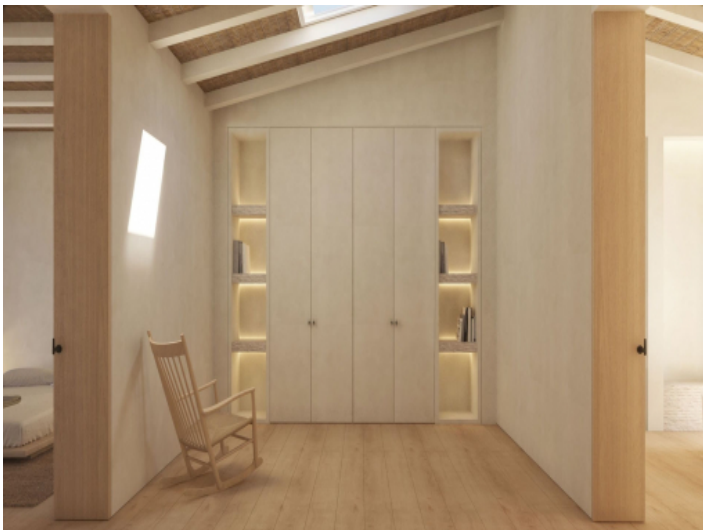
Beautiful dressing area