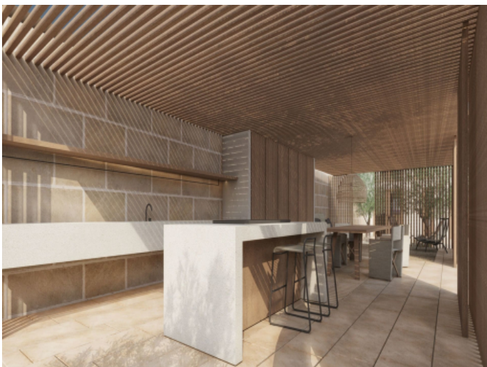
Large outdoor kitchen and dining area