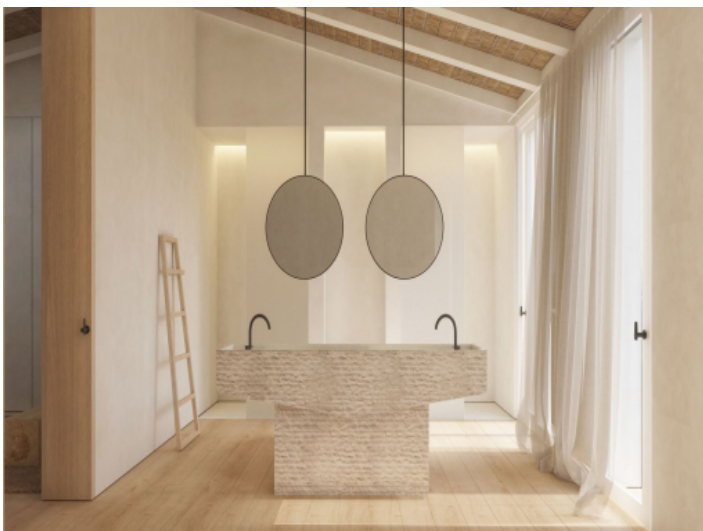
Luxurious master bathroom