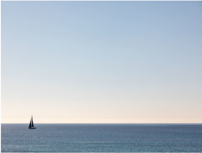
Stunning sea views