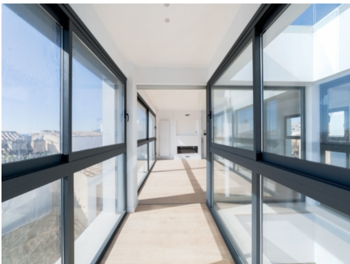
Upper floor with large windows