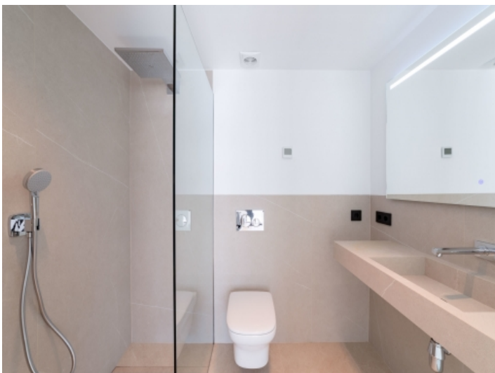
One of in total 4 bathrooms