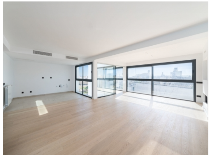
Open-plan living, dining and kitchen area