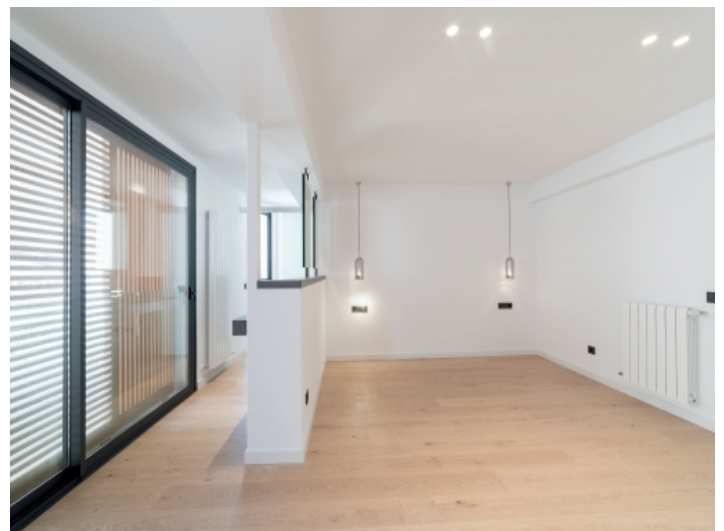
Master bedroom with dressing area