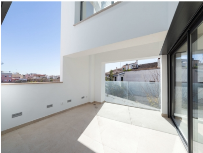
Private terrace ideal for a lounge area