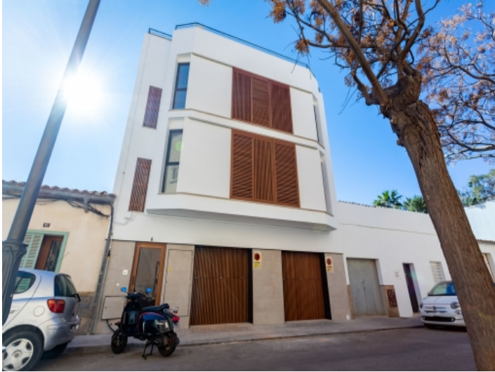
View of the house with garage