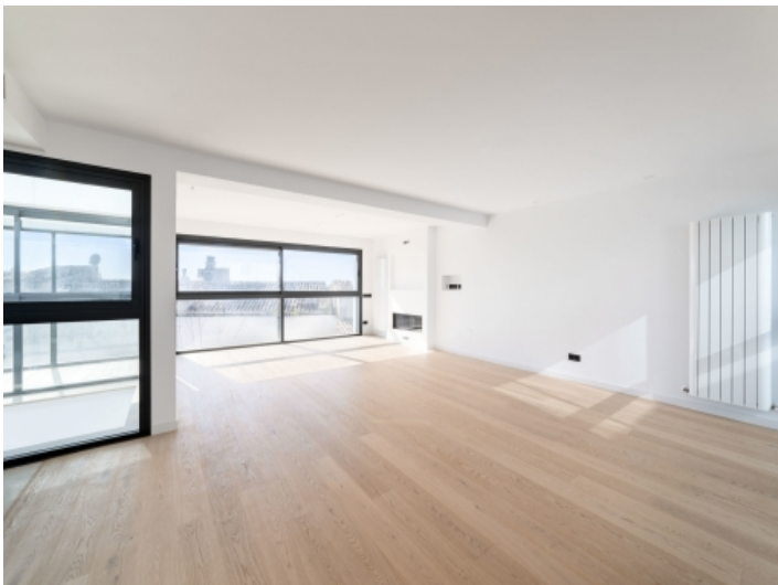
Lightflooded living area with fireplace