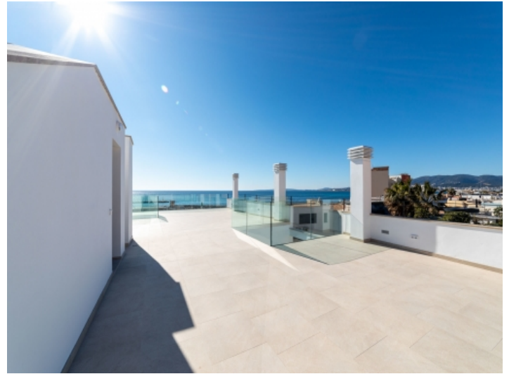
Large 150 sqm sea view terrace