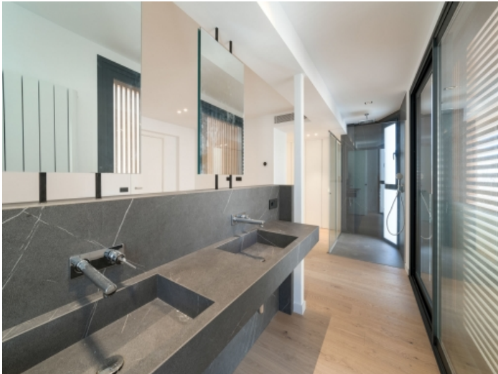
Elegant master en suite bathroom