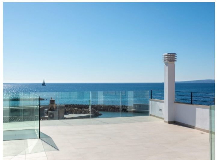
Stunning sea views