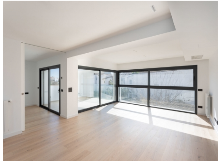
Living area on the first level with terrace