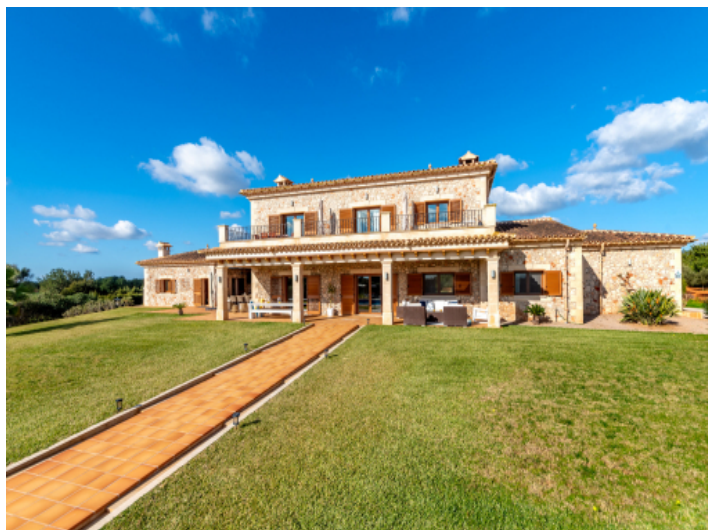
View of the natural stone facade