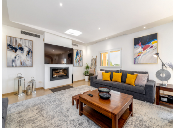
Modern living area with fireplace