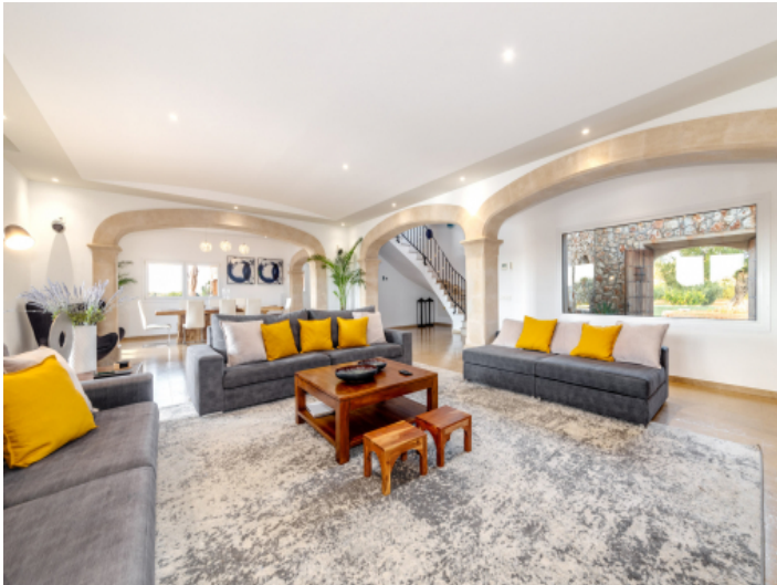
Living area with authentic sandstone arches