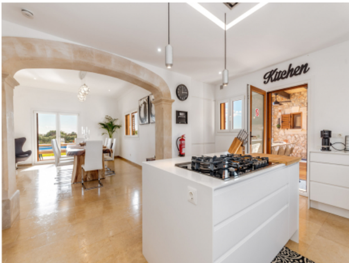
Direct access to the outdoor kitchen