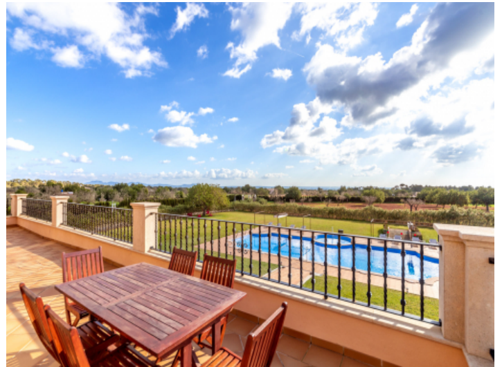
Upper terrace with views over the plot