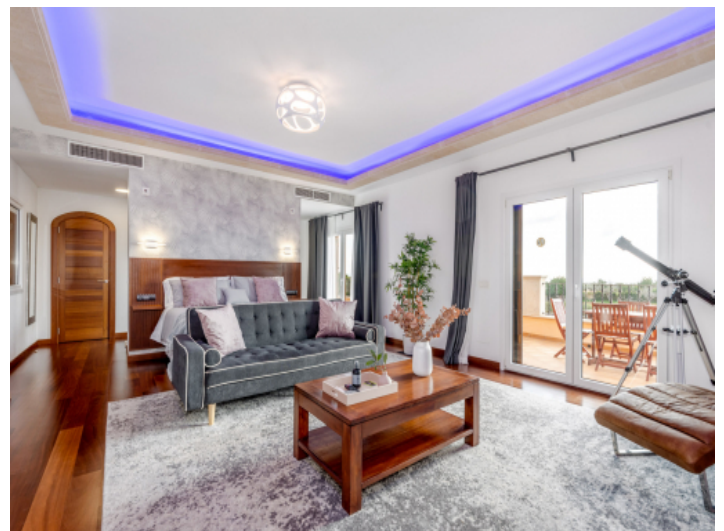
Dreamlike master bedroom