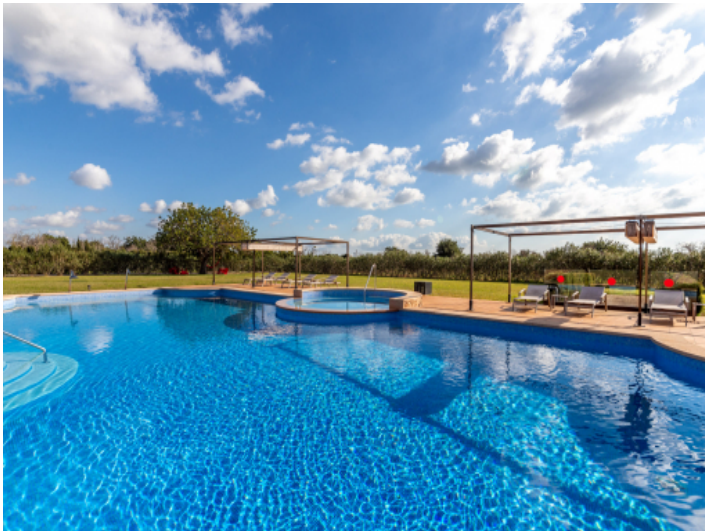
Fantastic pool with sun terrace