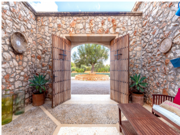
Appealing main entrance