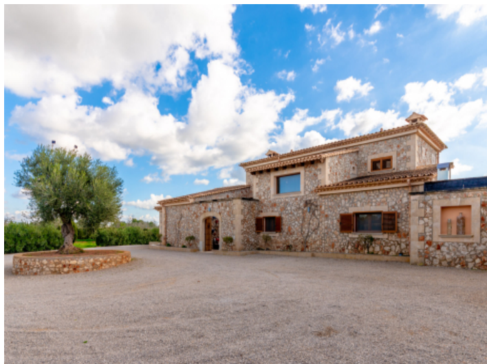
Front view of the finca