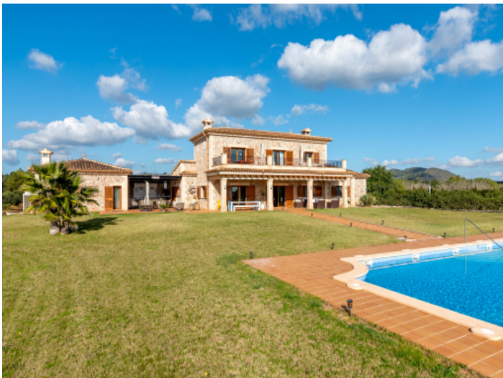
Extensive outdoor area