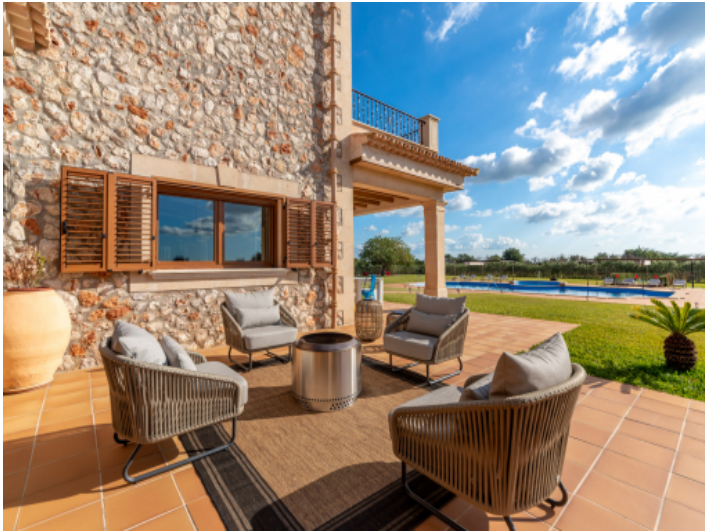
Sunny lounge terrace