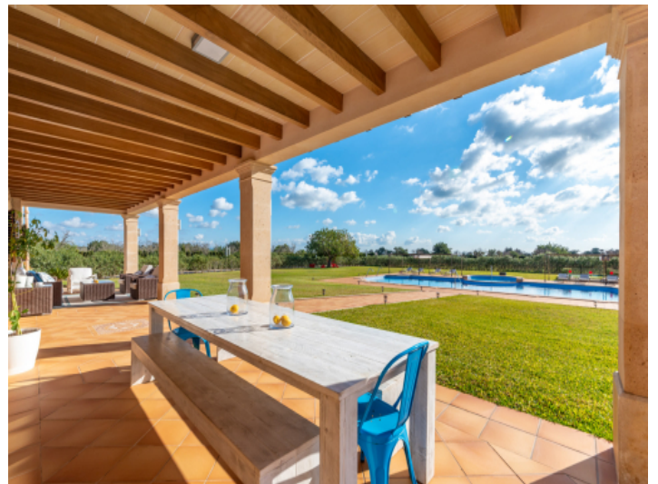
Covered outdoor dining area