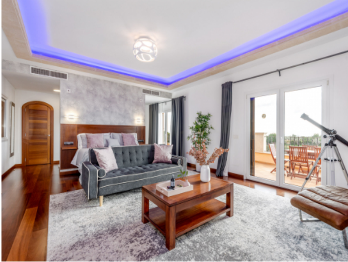
Dreamlike master bedroom