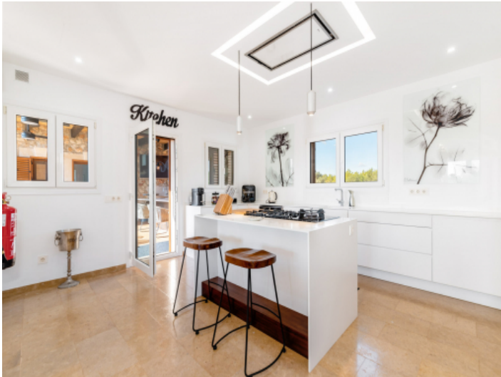
Modern kitchen in white