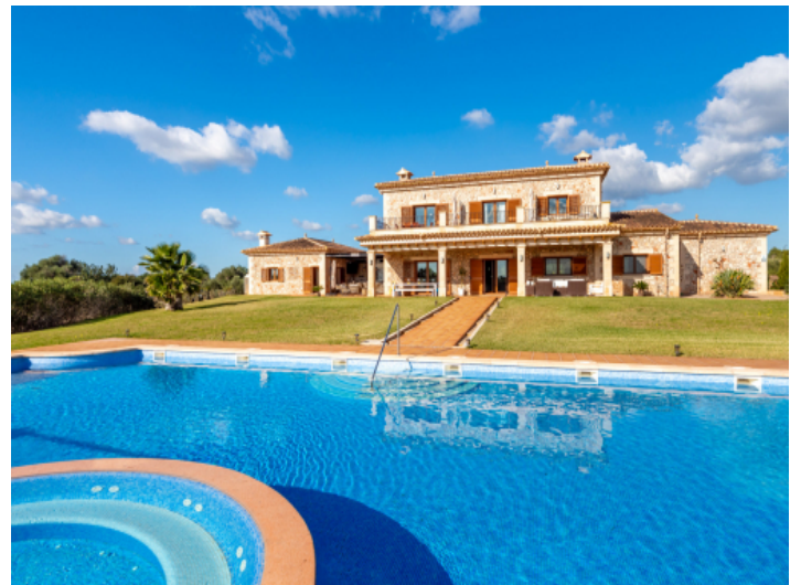
Wonderful swimming pool