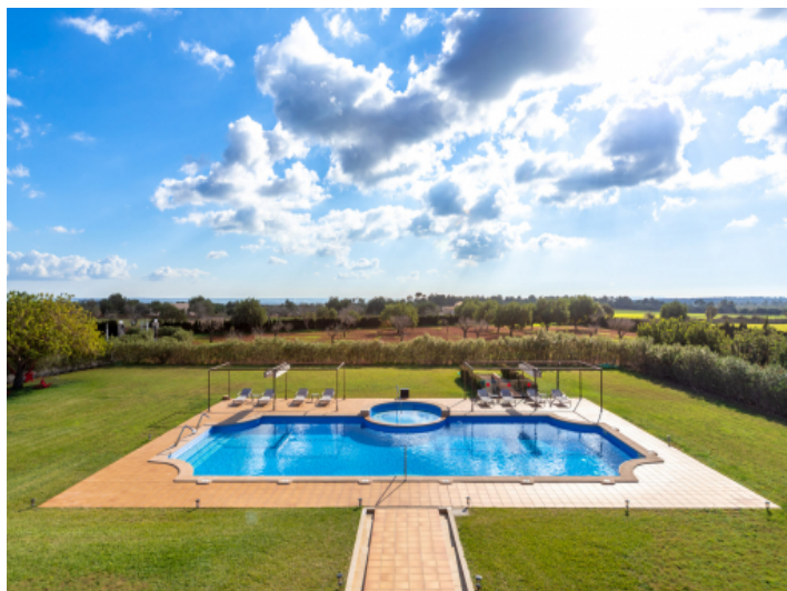
Large 10 x 20 m pool