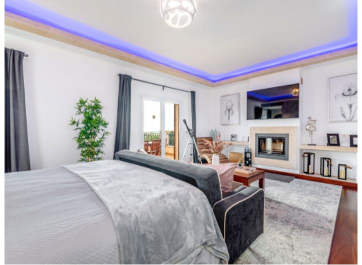
Master bedroom with fireplace and terrace