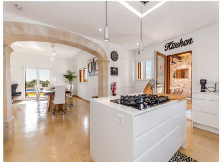
Direct access to the outdoor kitchen