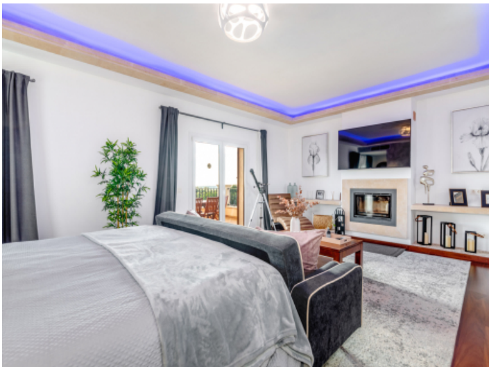
Master bedroom with fireplace and terrace