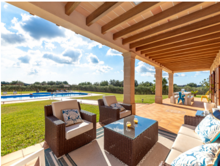
Covered terrace with garden views