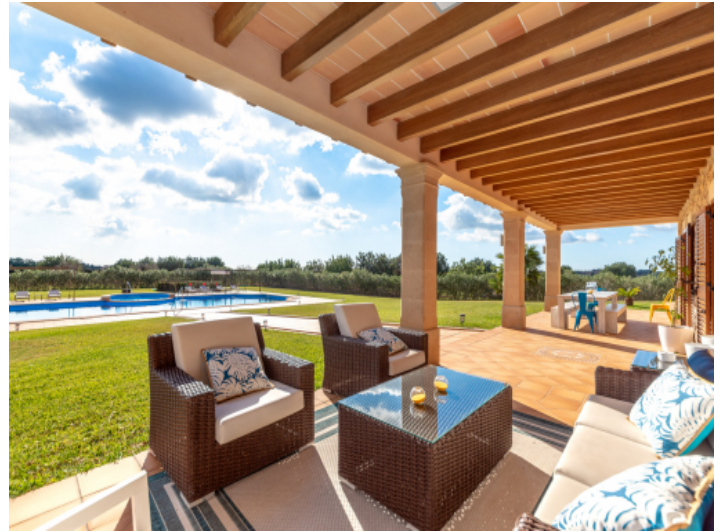
Covered terrace with garden views