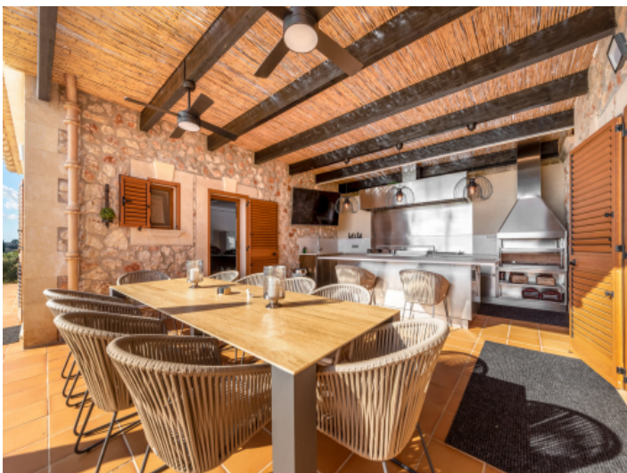
Noble outdoor kitchen and dining area