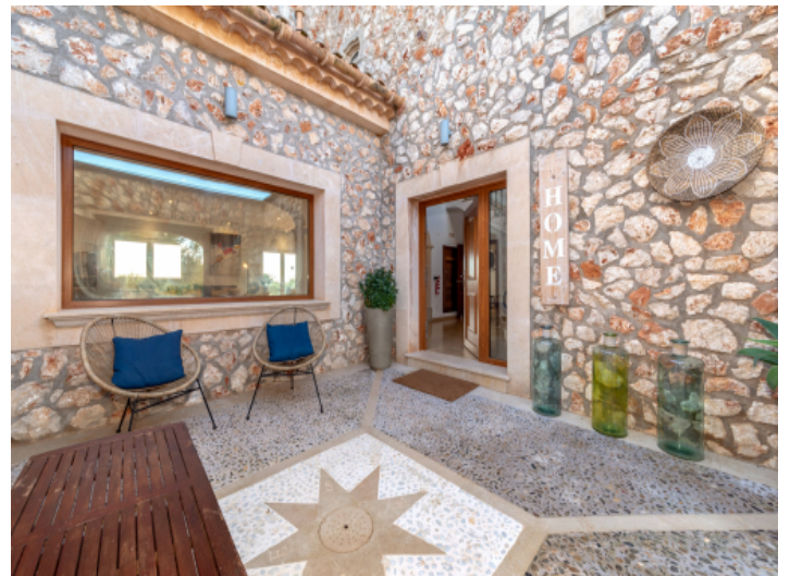
Beautiful entrance through a patio