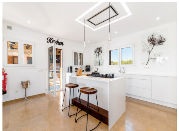
Modern kitchen in white