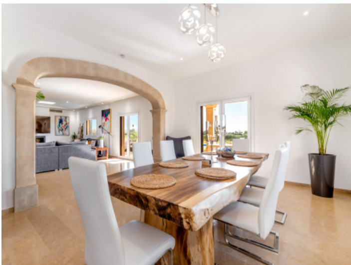
Spacious and adjoining dining area