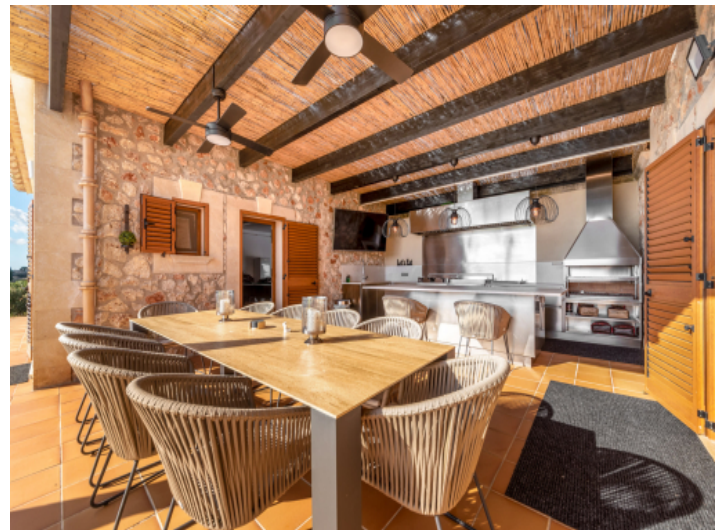
Noble outdoor kitchen and dining area