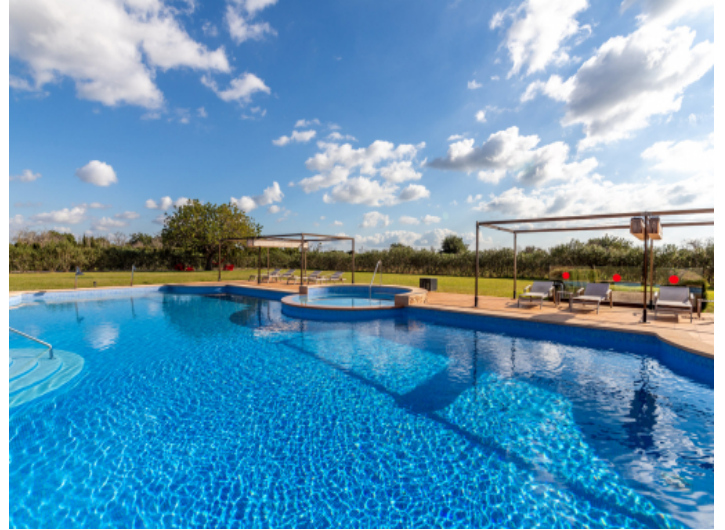
Fantastic pool with sun terrace