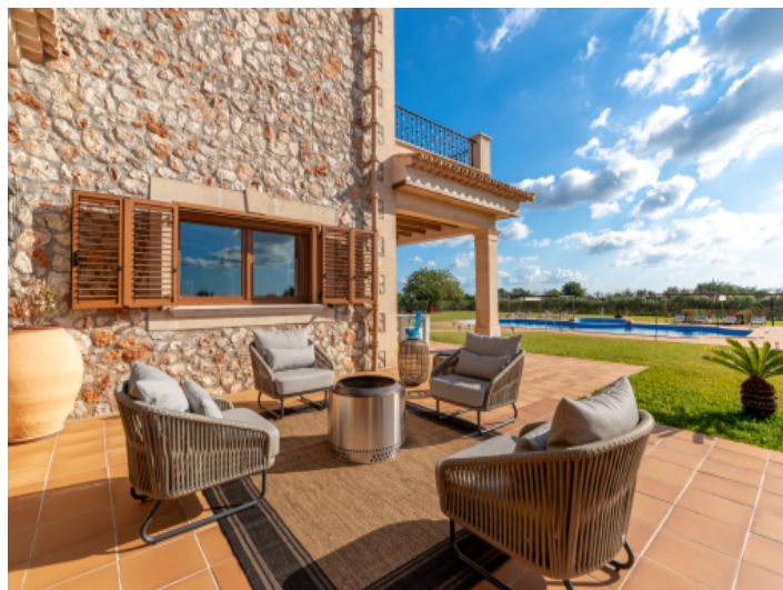
Sunny lounge terrace