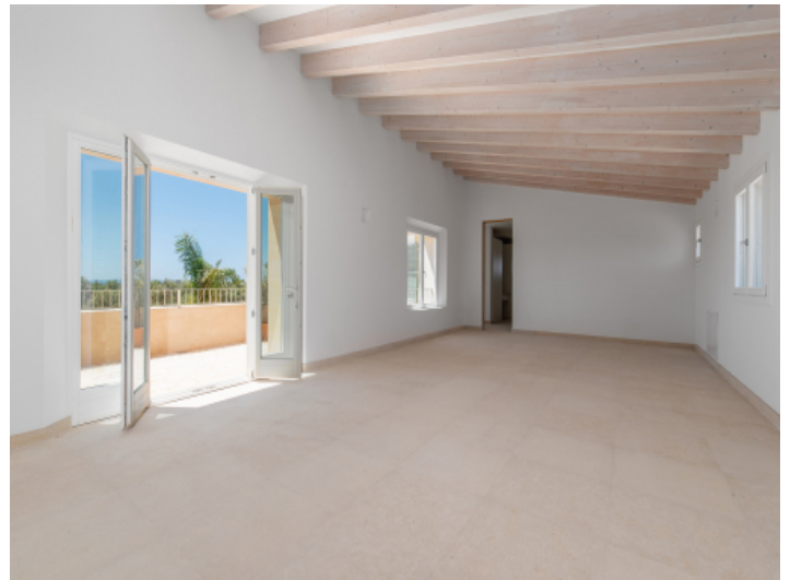
Second living room