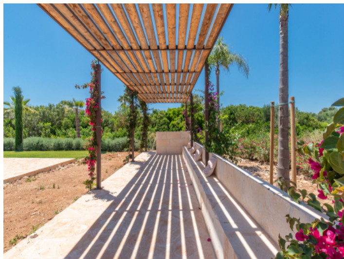
Cozy Seating area