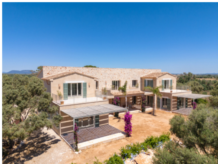
Newly built finca with natural stone