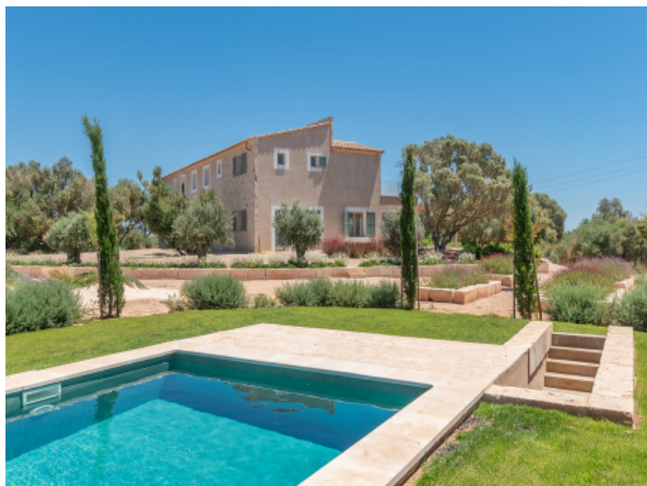
Finca with pool