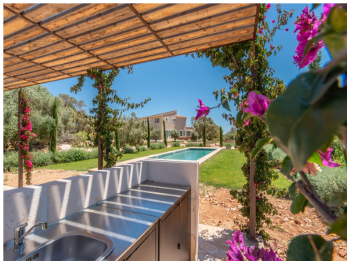
Pool with Barbecue area