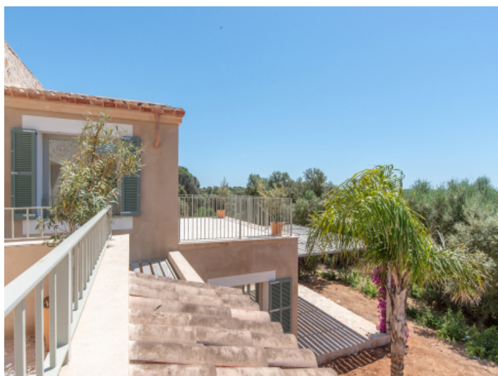
Terrace with views