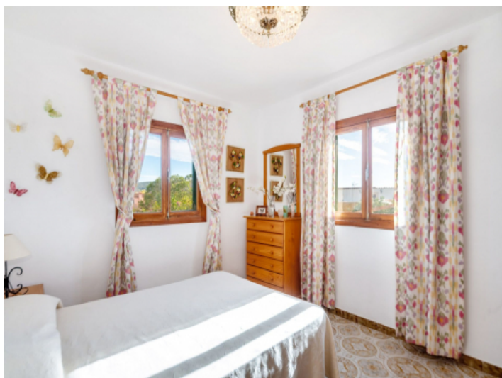
Finca with 4 bedrooms