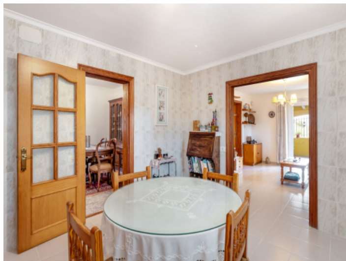
Dining area kitchen