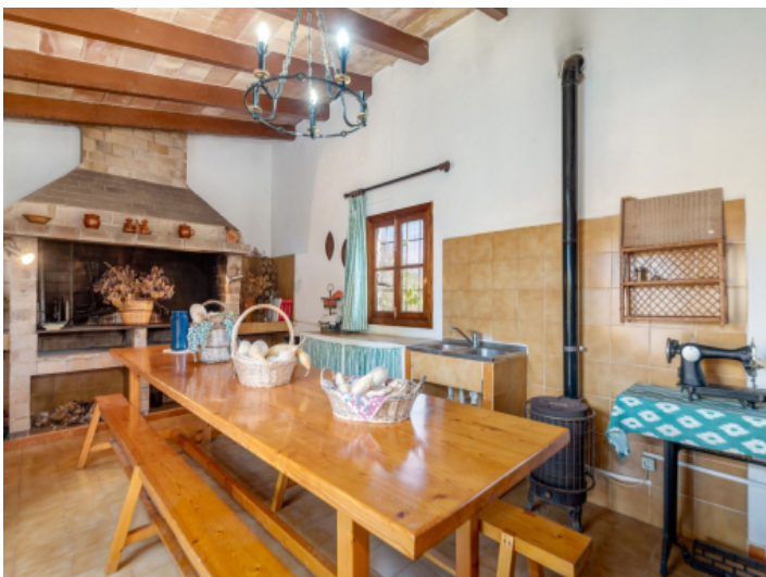
Seperated BBQ area