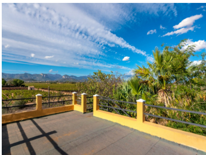
Rooftop terrace with views