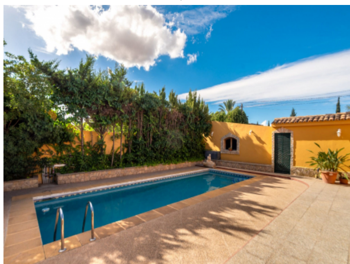
Beautiful pool area