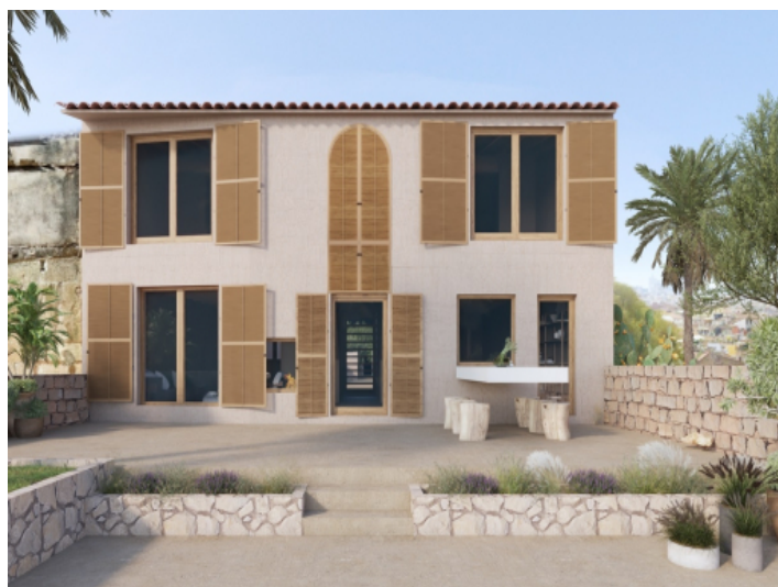
Facade view with outdoor terrace