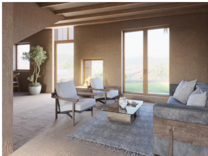
Modern interior design