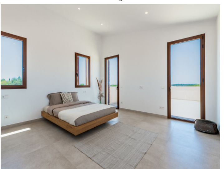
Bedroom on the first floor