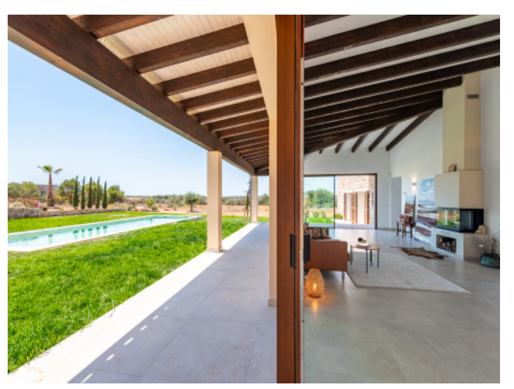
Large covered terrace