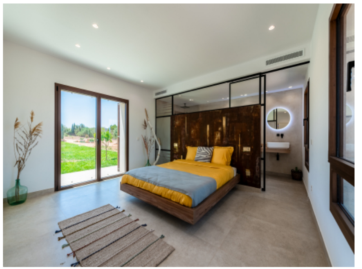
Bedroom on the groundfloor