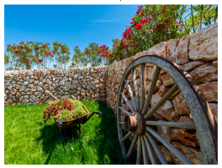
Natural stone walls