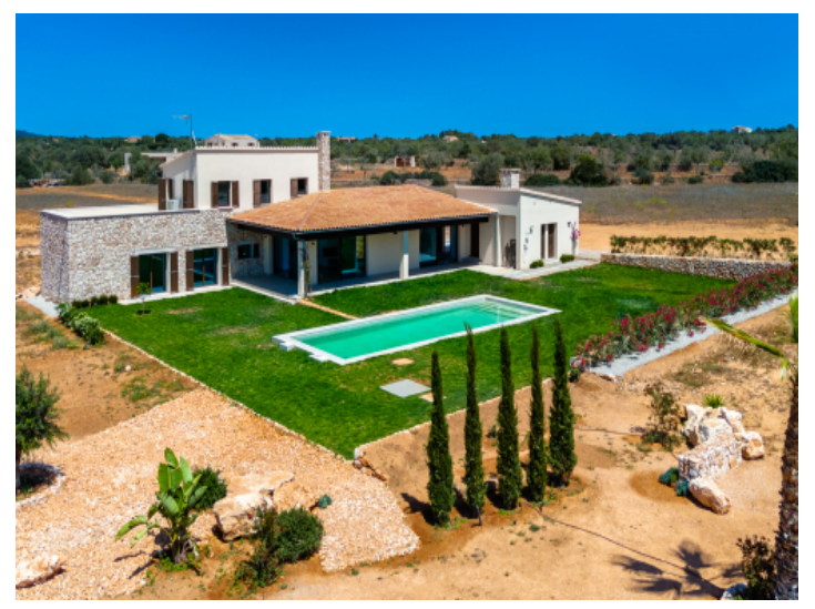
Aerial view to the property