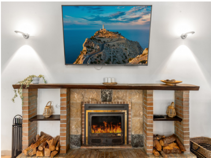
Cosy fireplace for winter days