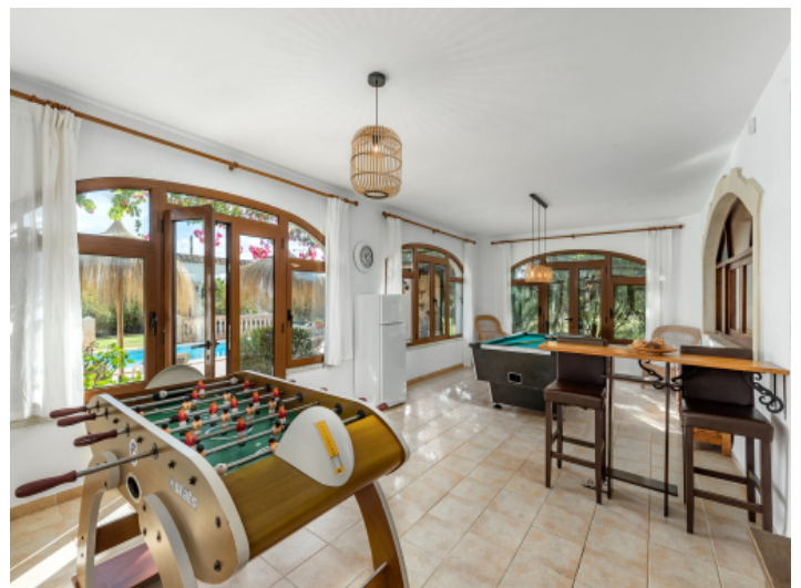
Wintergarden-like leisure room with terrace access