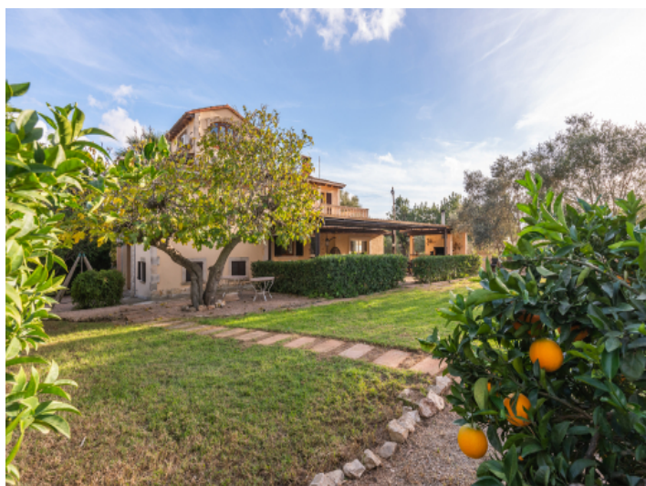
Garden with various plants and trees