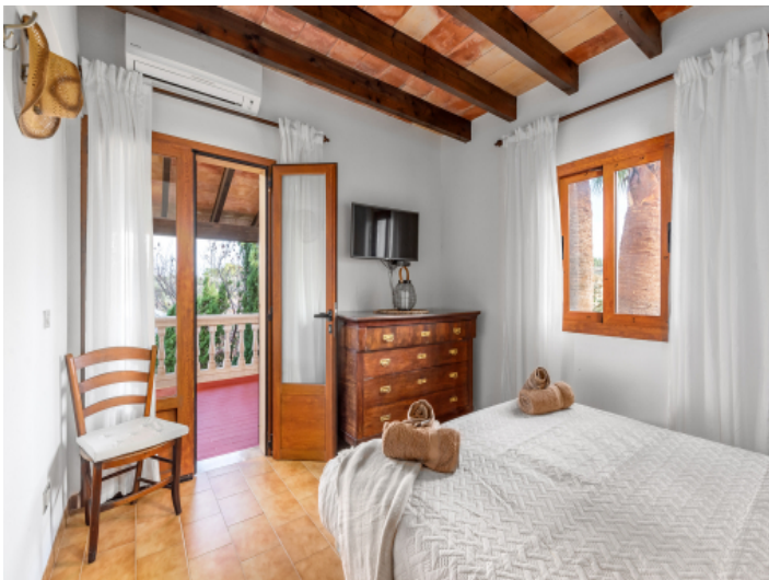
Bedroom with access to the upper terrace