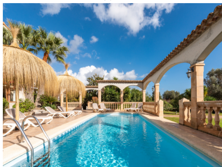
Dreamlike finca with holiday rental license in Biniamar, Selva