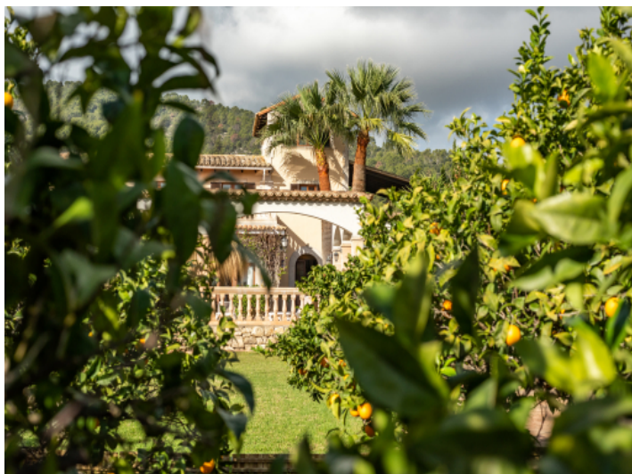
Garden and finca