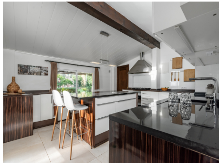
Large, modern kitchen