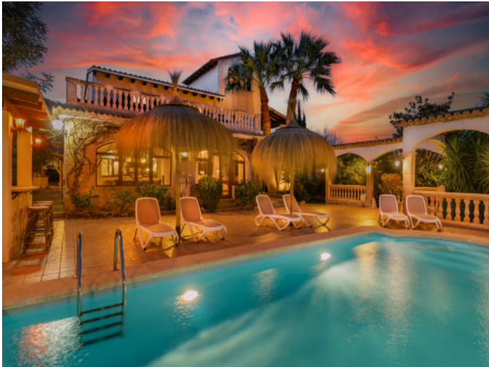
The pool area at night