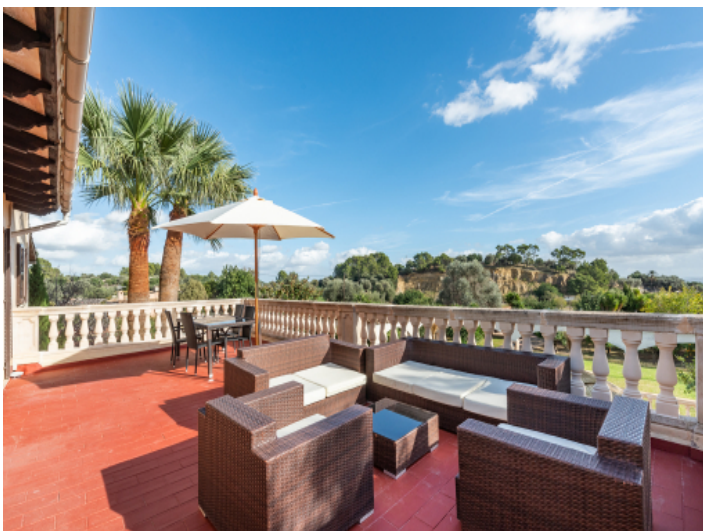
Upper terrace with a view