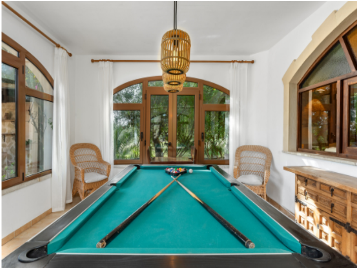
Fantastic billiard area