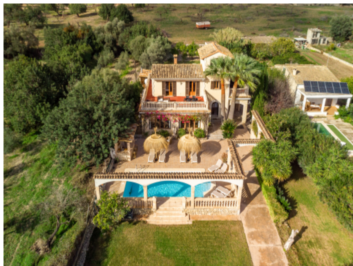
Dreamlike finca with holiday rental license in Biniamar, Selva