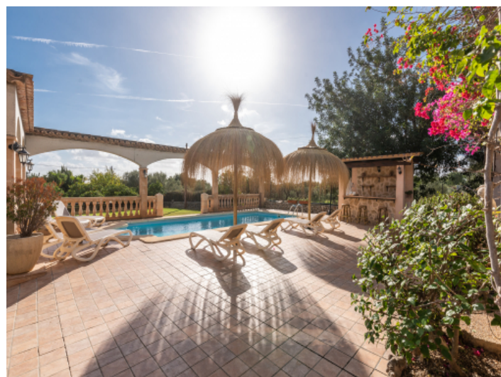
Lovely pool area