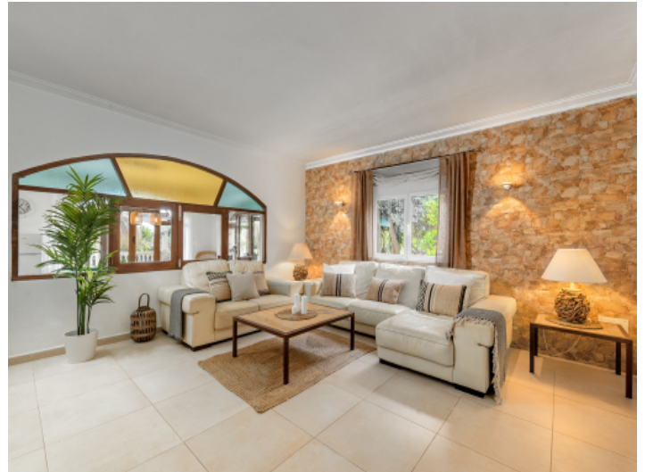
Living area with stone wall