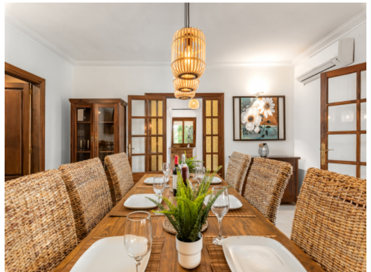
Dining area in the centre of the room