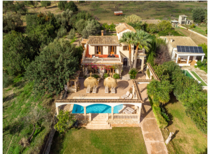
Dreamlike finca with holiday rental license in Biniamar, Selva