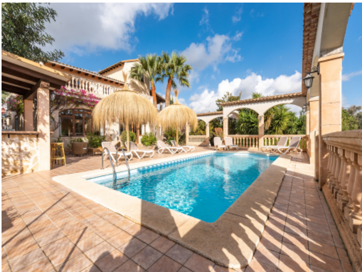
Wonderful, sunny pool area