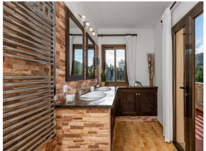
Bathroom with terrace access