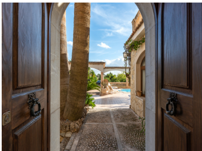
Entrance to the house