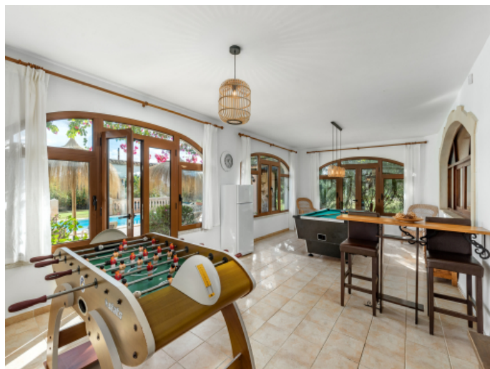
Wintergarden-lilke leisure room with terrace access