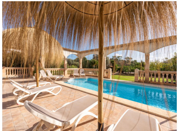
Pool oasis with garden views