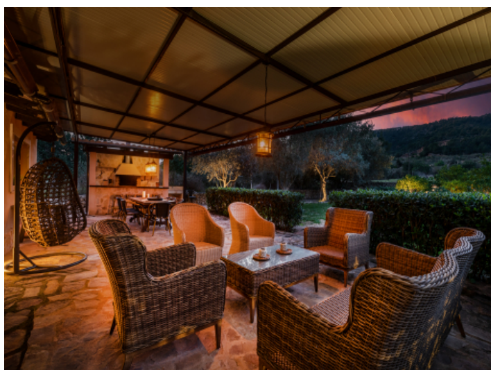
Terrace at night