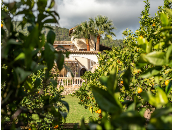
Garden and finca