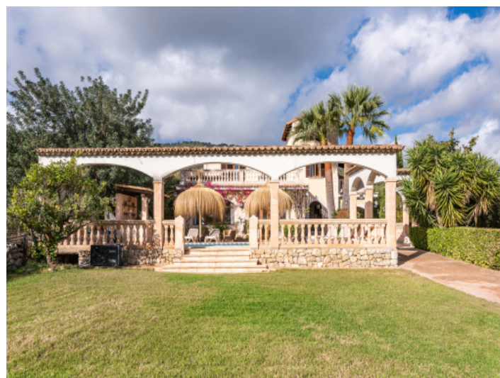
View from the garden