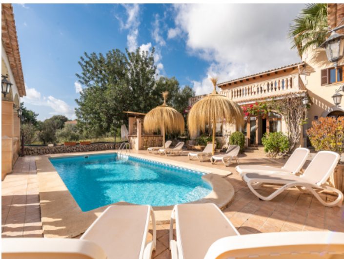
View from the pool to the house