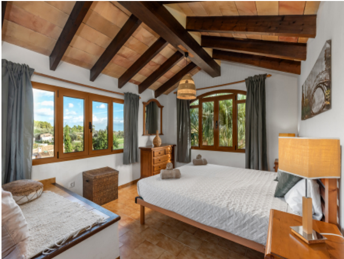
Cosy bedroom with wooden beams