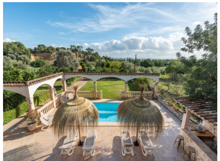
View over the garden