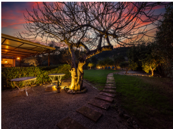
View into the garden