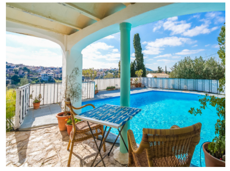
Beautiful swimmig pool