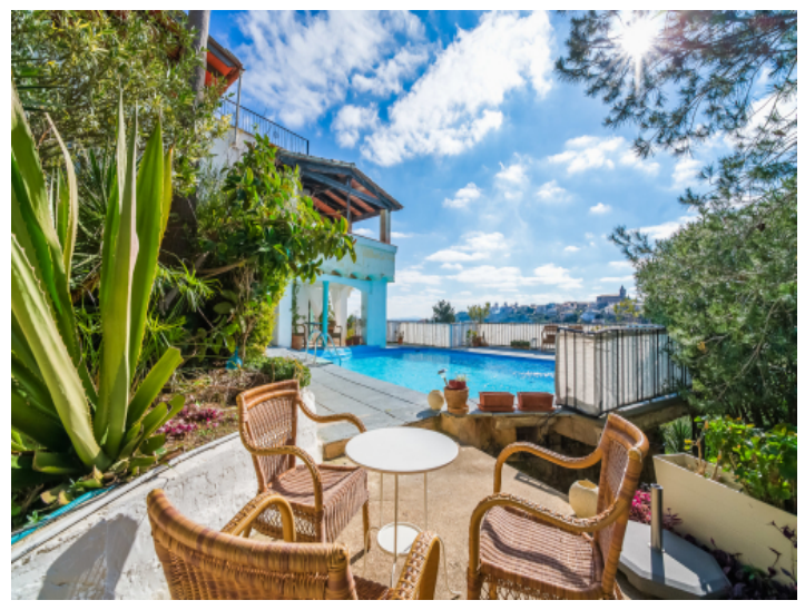
Pool area with stunning views