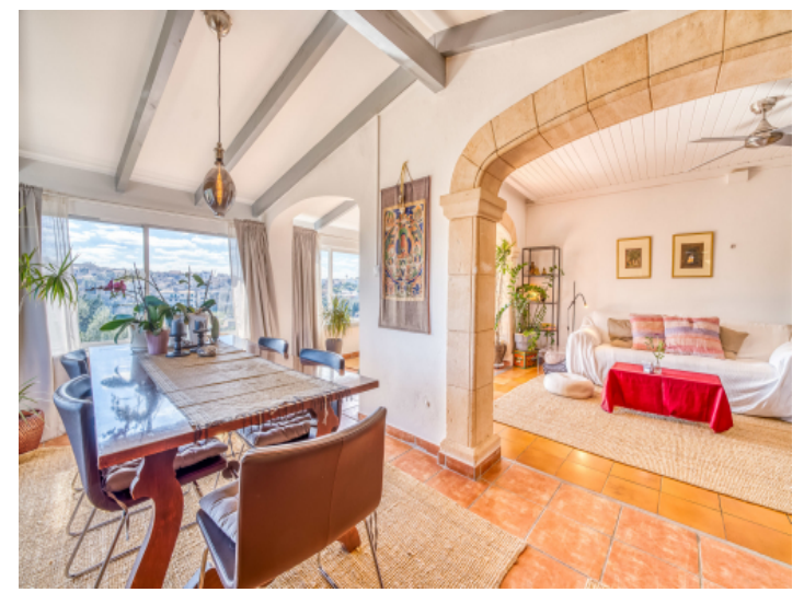
Adjoining dining area with panorama views