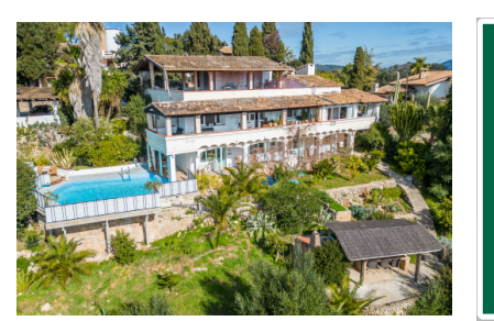
Buger search for property MAL-119097