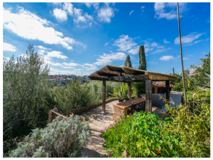
Beautifully planted garden