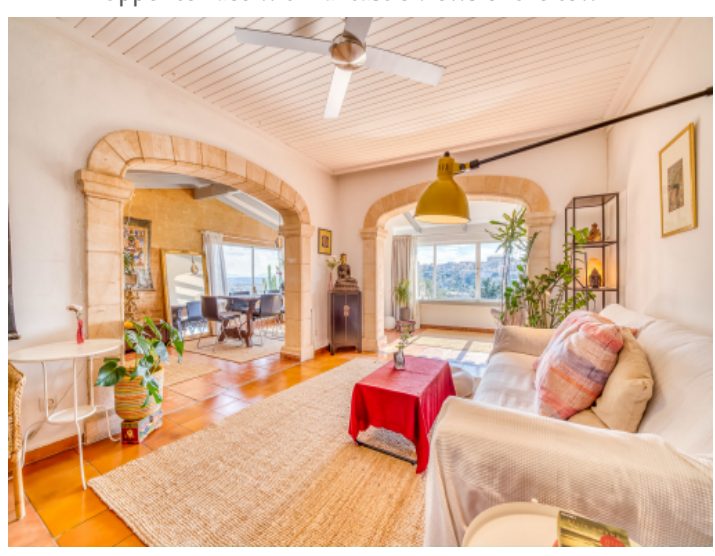
Livind area with original sandstone walls

PORTA MALLORQUINA • C./ COLOM 20 2°, 07001 PALMA, SPAIN TEL.: +34 971 698 242 • INFO@PORTAMALLORQUINA.COM • WWW.PORTAMALLORQUINA.COM