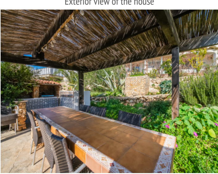
Dining and bbq area in the garden