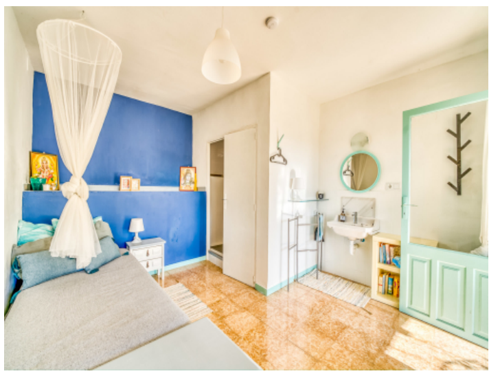
Sunny guest apartment

PORTA MALLORQUINA • C./ COLOM 20 2°, 07001 PALMA, SPAIN TEL.: +34 971 698 242 • INFO@PORTAMALLORQUINA.COM • WWW.PORTAMALLORQUINA.COM