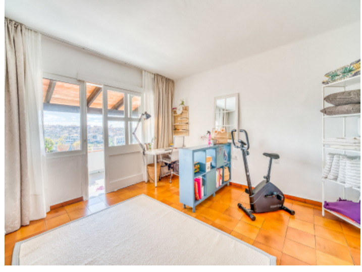
Bedroom with terrace access

PORTA MALLORQUINA • C./ COLOM 20 2°, 07001 PALMA, SPAIN TEL.: +34 971 698 242 • INFO@PORTAMALLORQUINA.COM • WWW.PORTAMALLORQUINA.COM