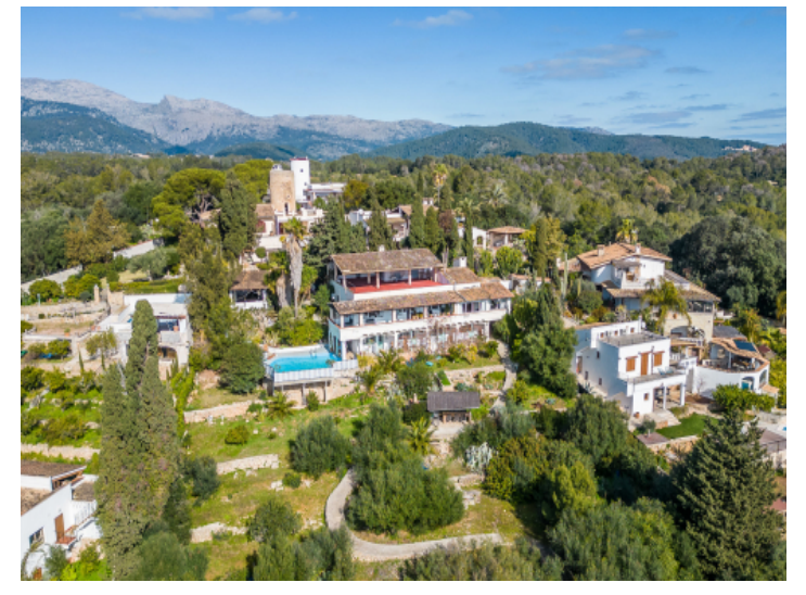
Bird's eye view of the finca