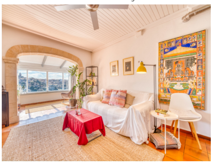
Lightflooded spacious living area