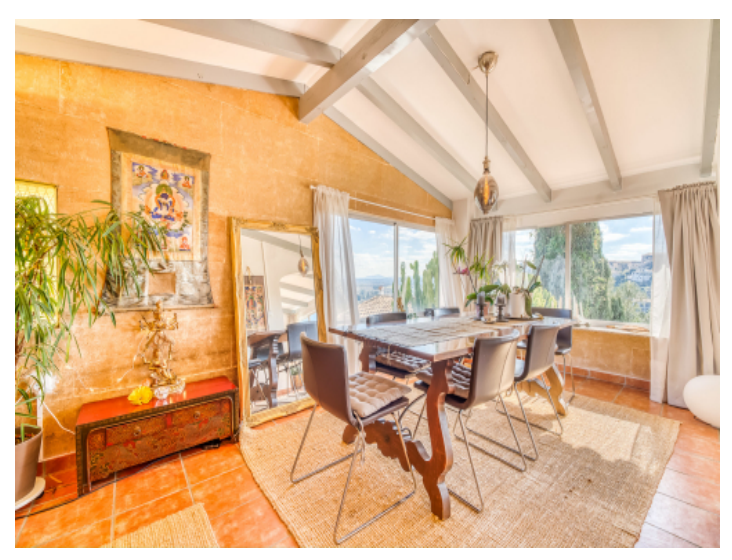
Dining area with wonderful sandstone wall