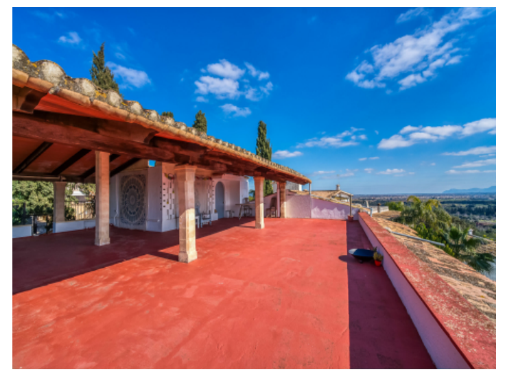
Extensive roof top terrace