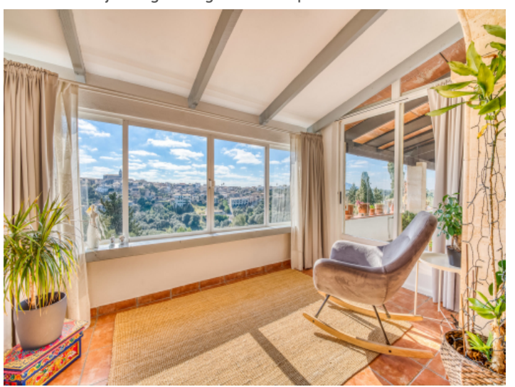
Stunning panorama views