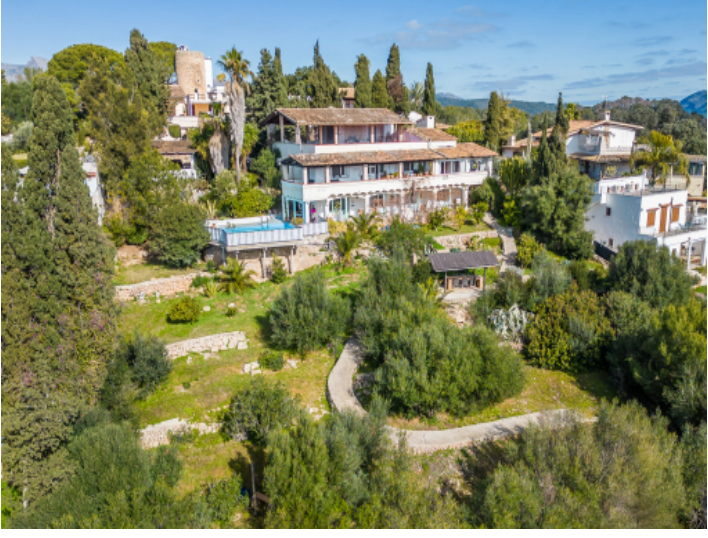
Bird's eye view