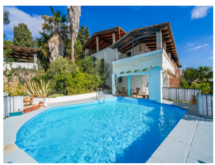
Refreshing pool for summer days