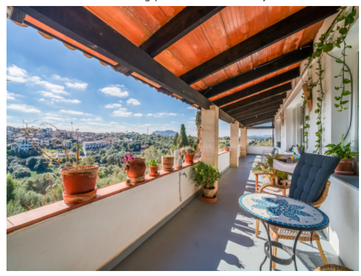
Upper terrace with fantastic views of the town