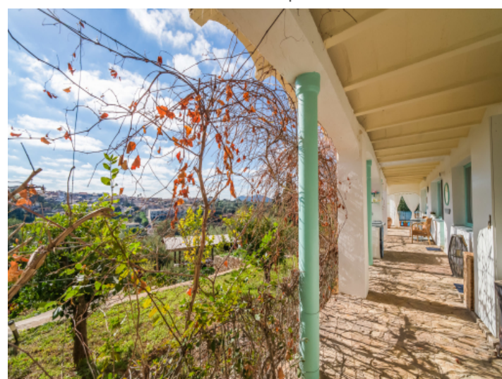
Lower terrace with garden