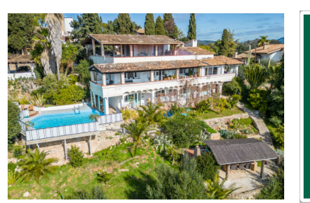
Buger search for property MAL-119097