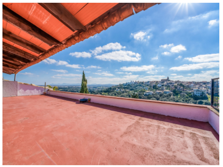
Impressive panorama views from the terrace