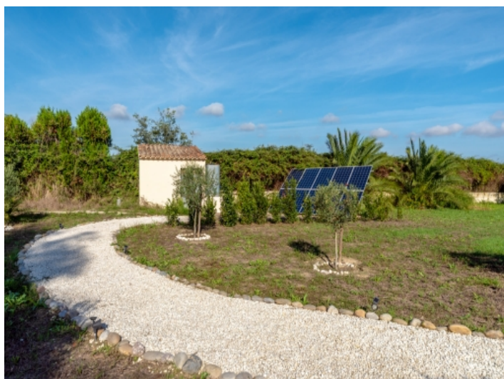
Plot with solar panel