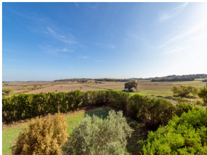
Wonderful sweeping views