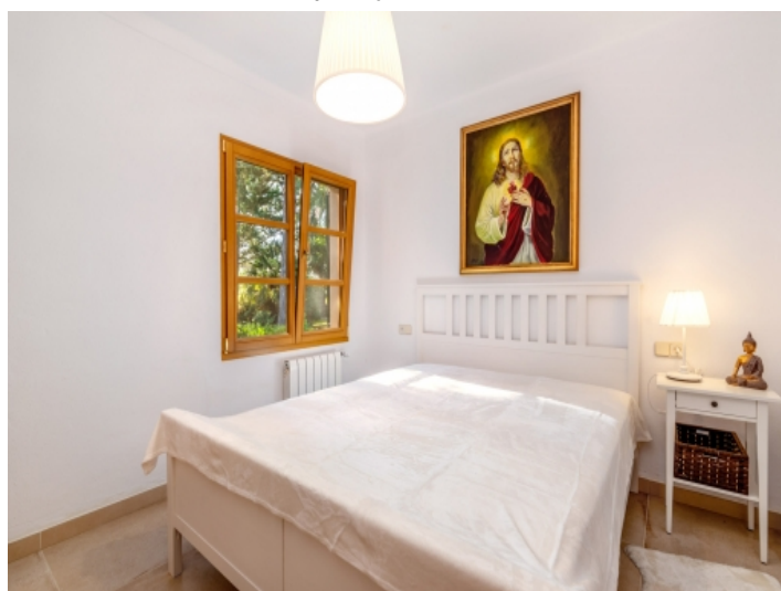
One of 2 double bedrooms