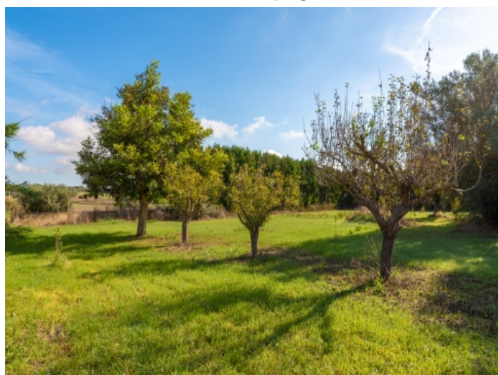
Garden with various fruit trees