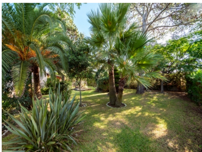
Wonderful garden with palm trees