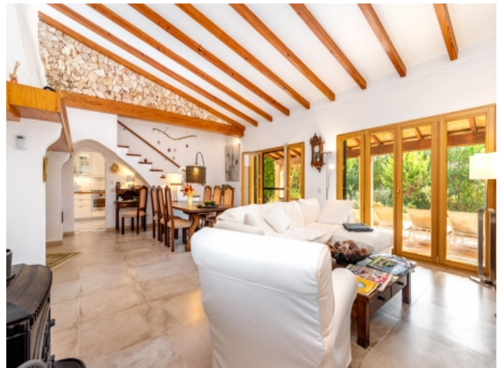
Tastefully renovated living area