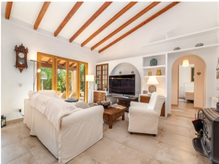
Lightflooded living area with terrace access