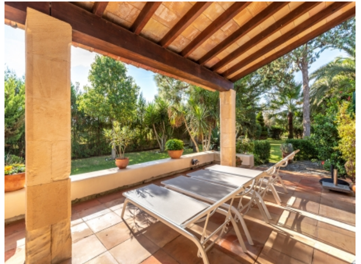
Idyllic sun terrace