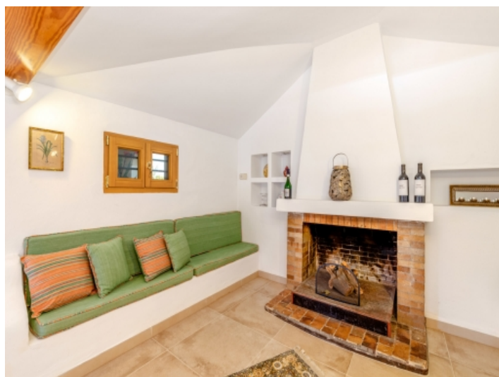
Cozy fireplace corner