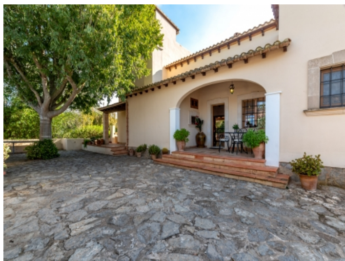
Entrance to the finca