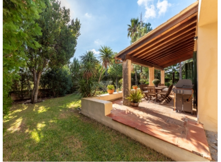
Enchanting terrace and garden