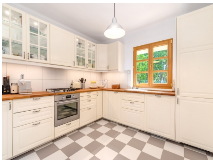
Modern kitchen in white