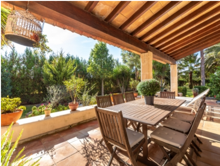
Covered outdoor dining area