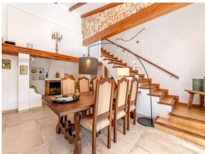
Dining area and access to the upper floor