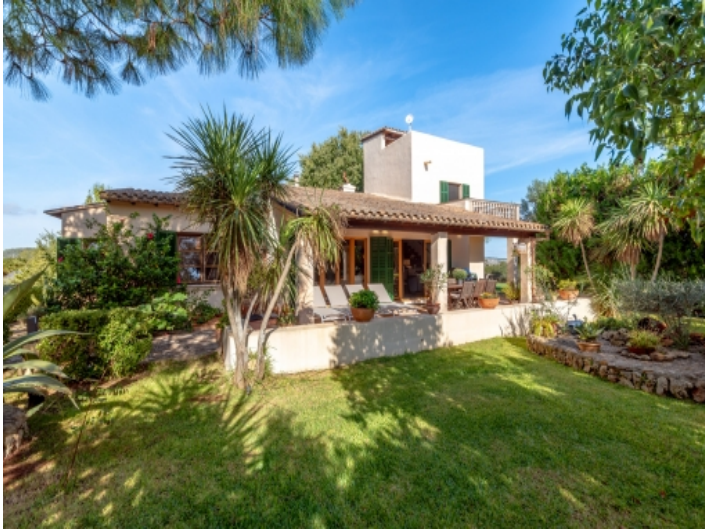
Finca surrounded by a mediterranean garden