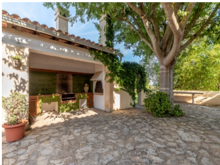
Covered bbq terrace