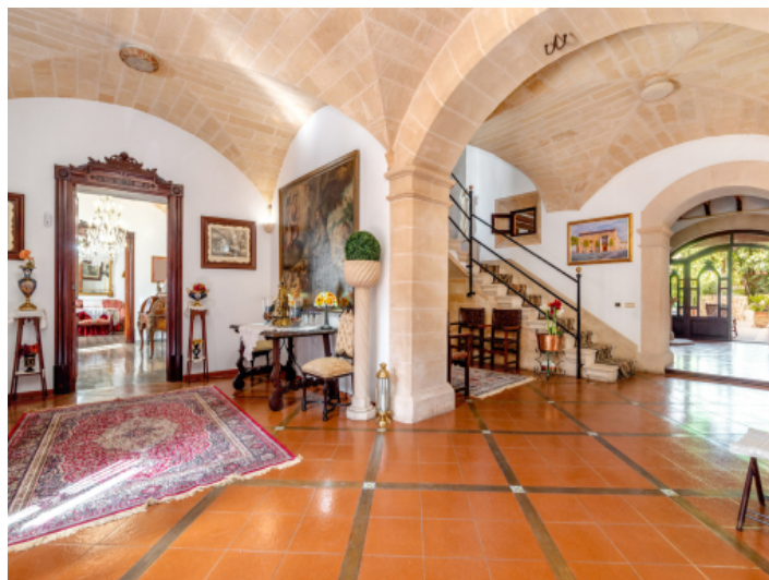
Living and entrance area