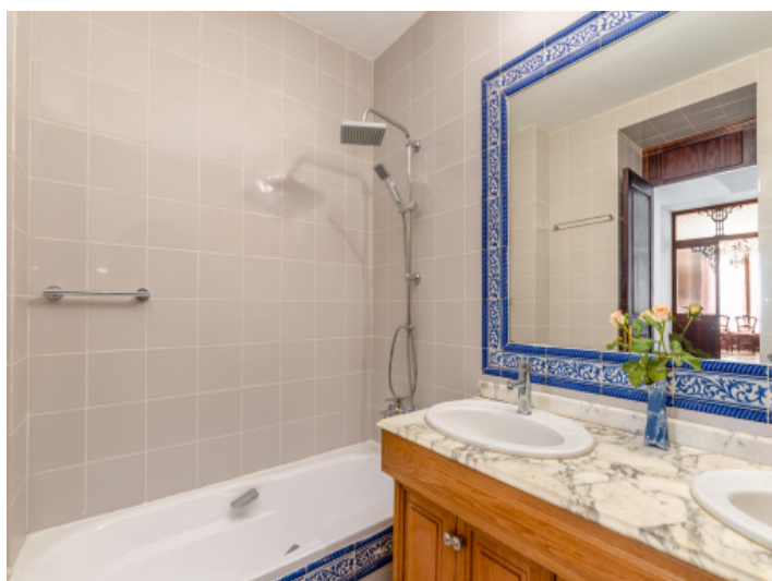
Bathroom with bathtube