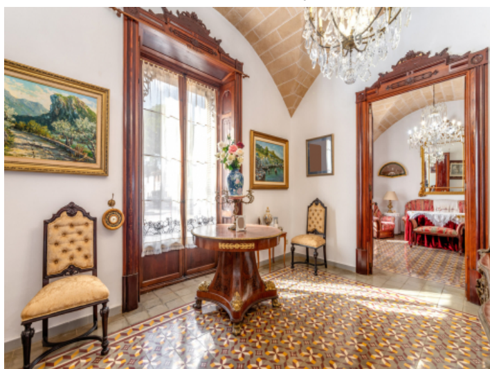
Traditional living area