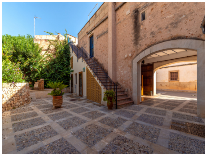
Entrance area with patio