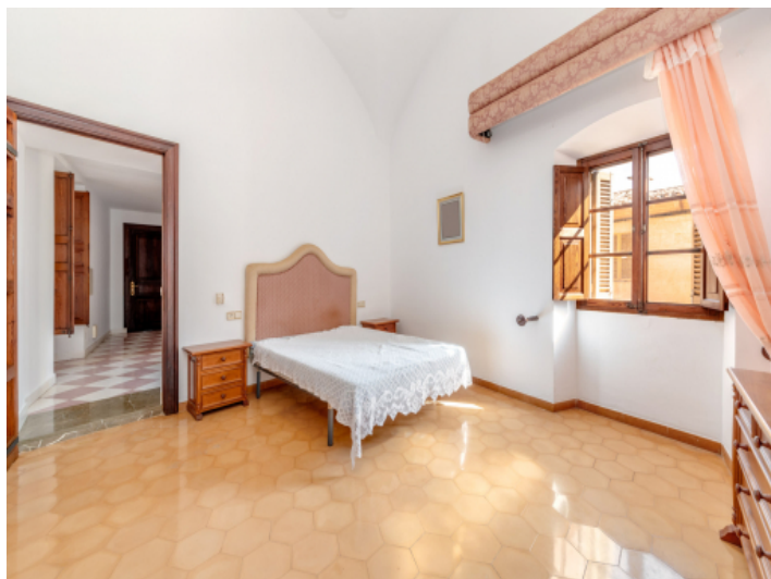
1 of 6 bedrooms