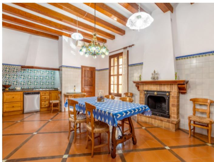
Country style kitchen