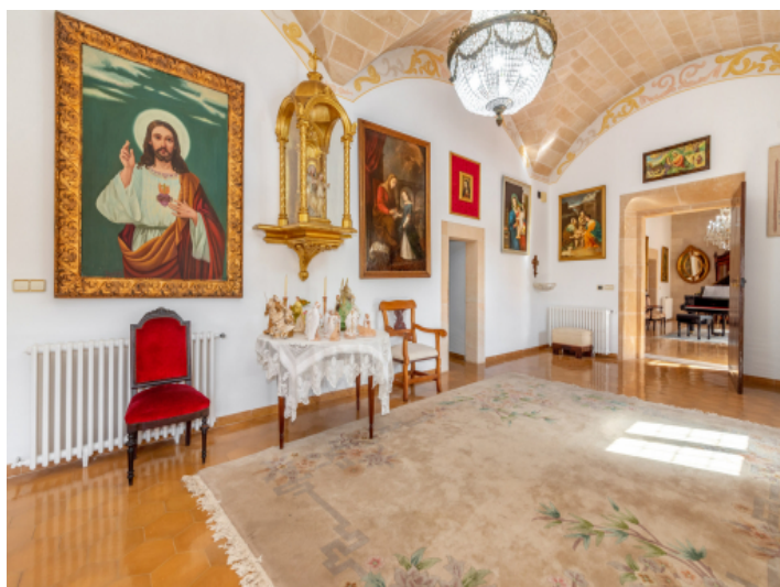
Living area with stone vault