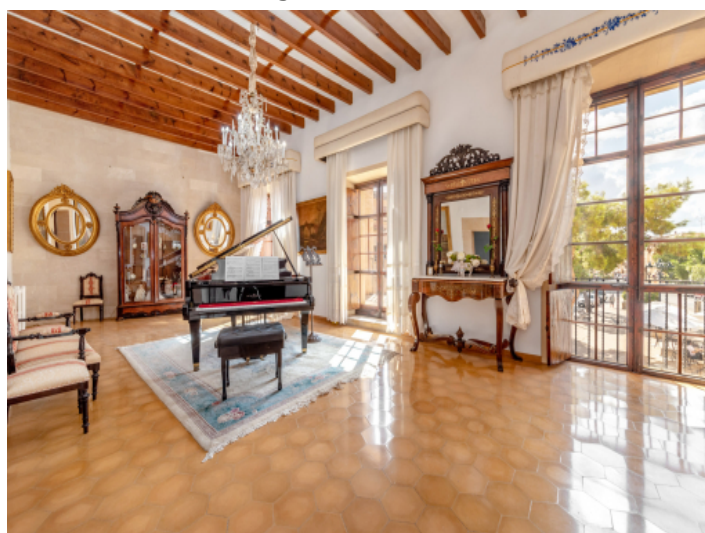
Living area with Wooden beam ceiling