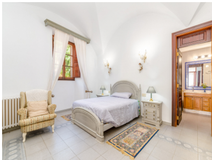
Bedroom with bath en suite