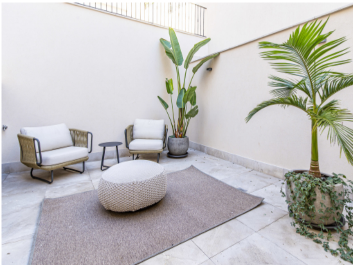
Private patio of the master bedroom