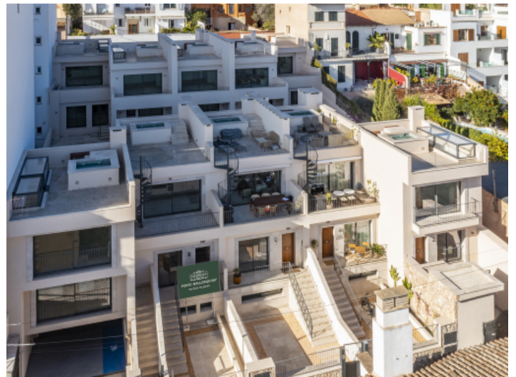
Terraced house with 3 levels and rooftop