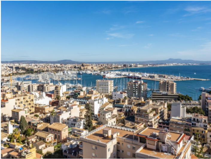
Close to the harbour and city center