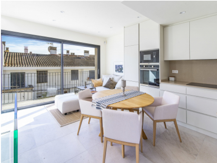
Modern american kitchen