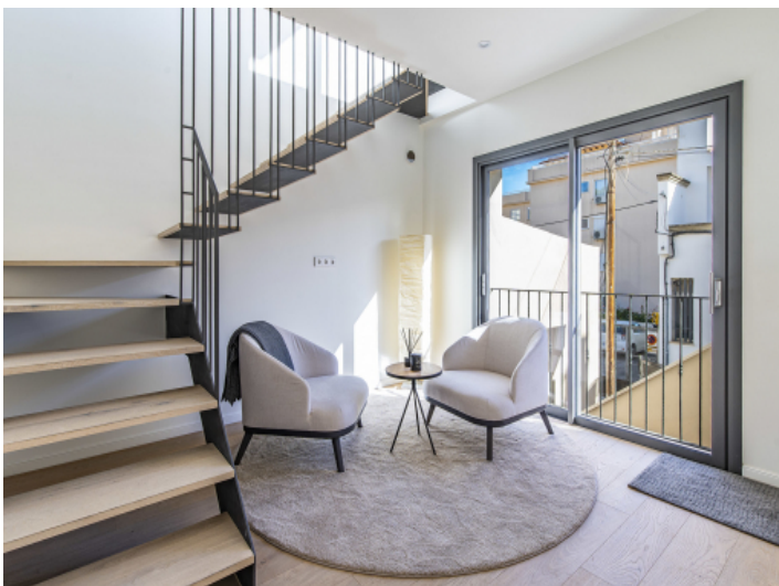
Bright entrance hall