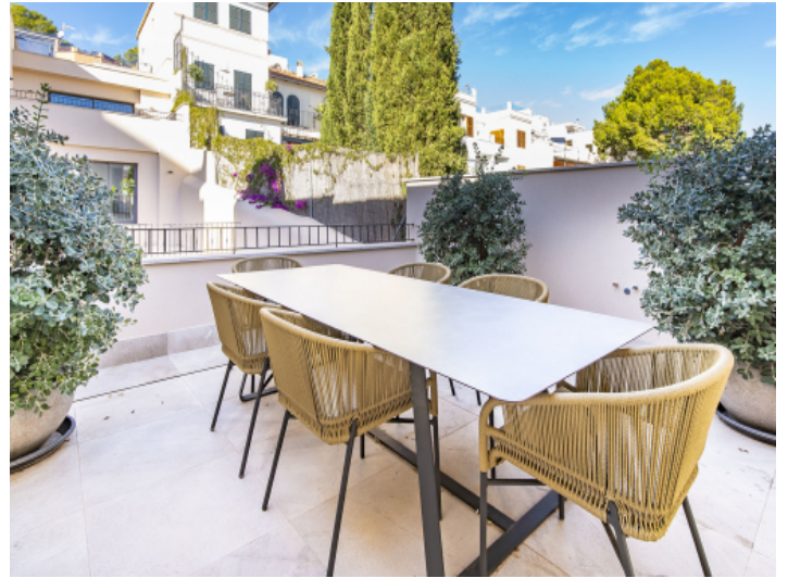
Large outdoor dining area