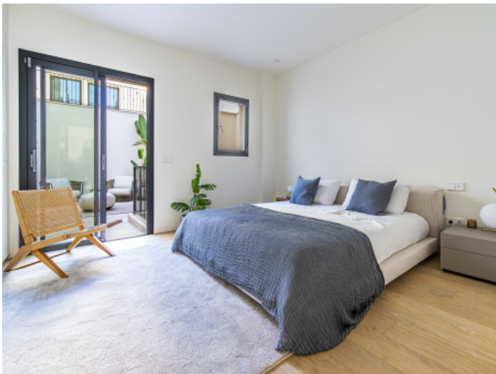
Masterbedroom with private patio