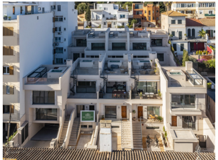
Fassade of the complex