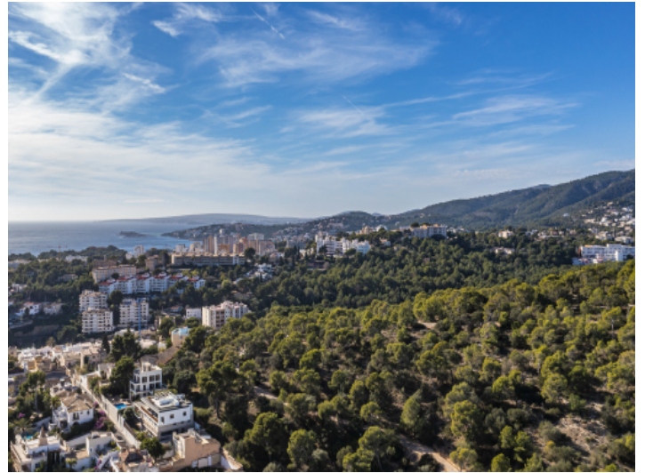
Bellver Forest is the city's green lung