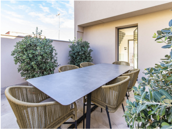
Great outdoor dining area