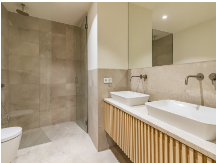
One of two modern bathrooms with shower