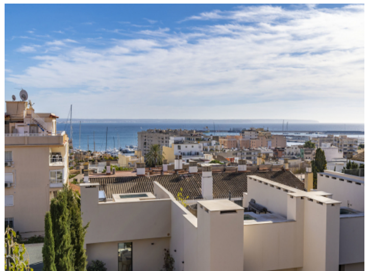
View over the roofs to the sea