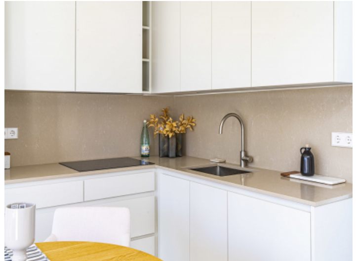
Kitchen with plenty of storage space