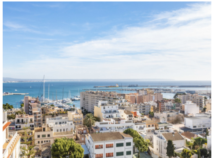
Close to the city center and harbour