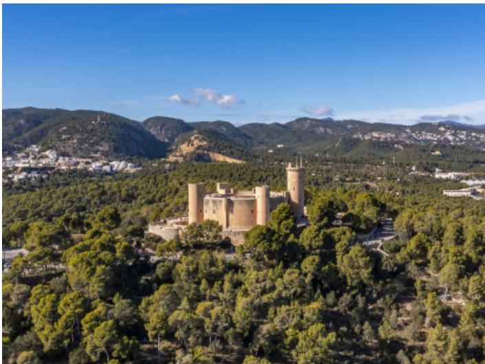
Castle of Bellver in walking distance