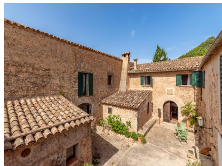
Wonderful typically mallorquin patio