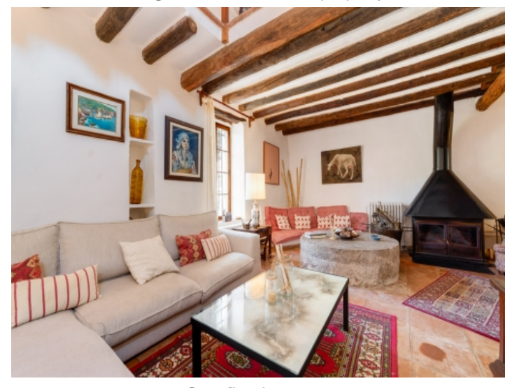
Cosy fireplace area