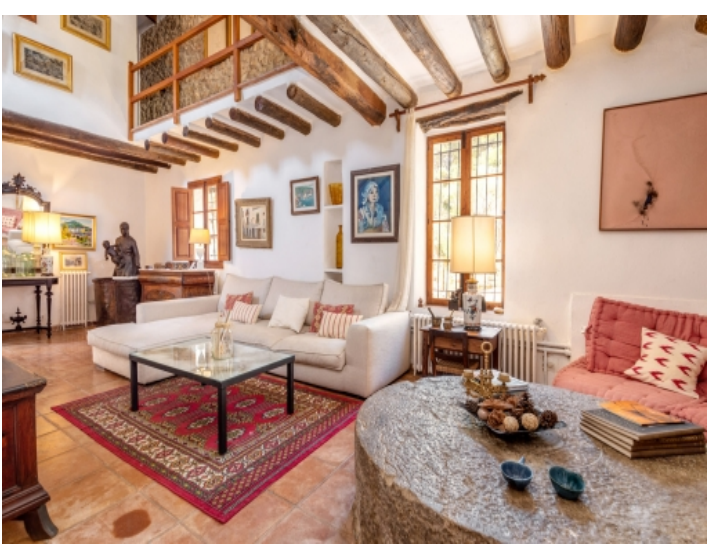
Enchanting living area with wooden ceiling beams