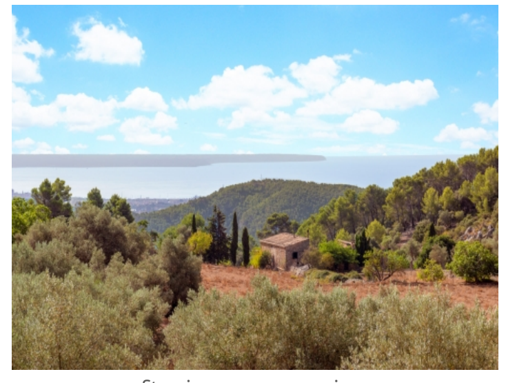
Stunning panorama sea views