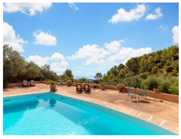
Pool area in a unique location