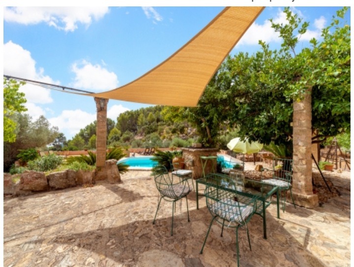
Idyllic terrace next to the pool area