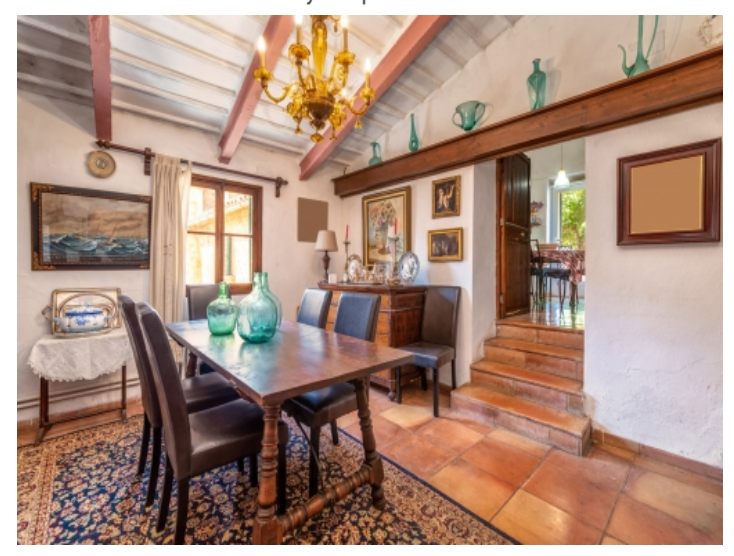
Further dining area