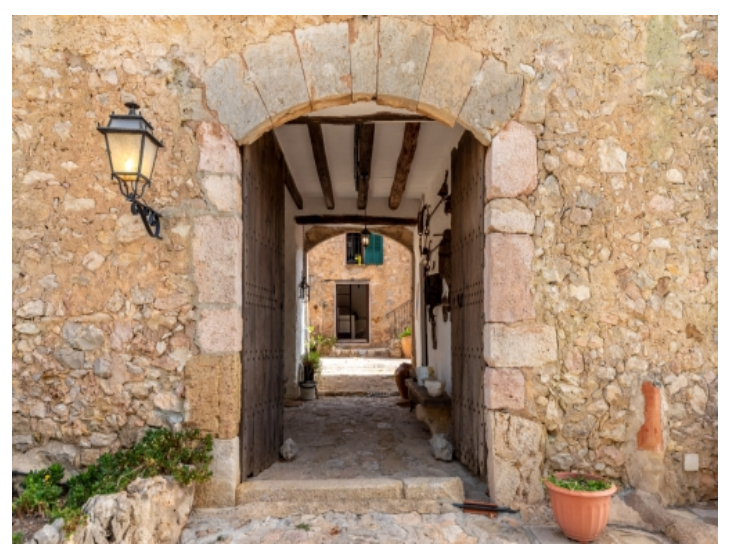
Original entrance to the property