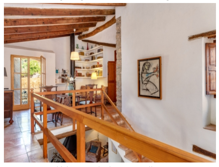
Living room in the upper gallery