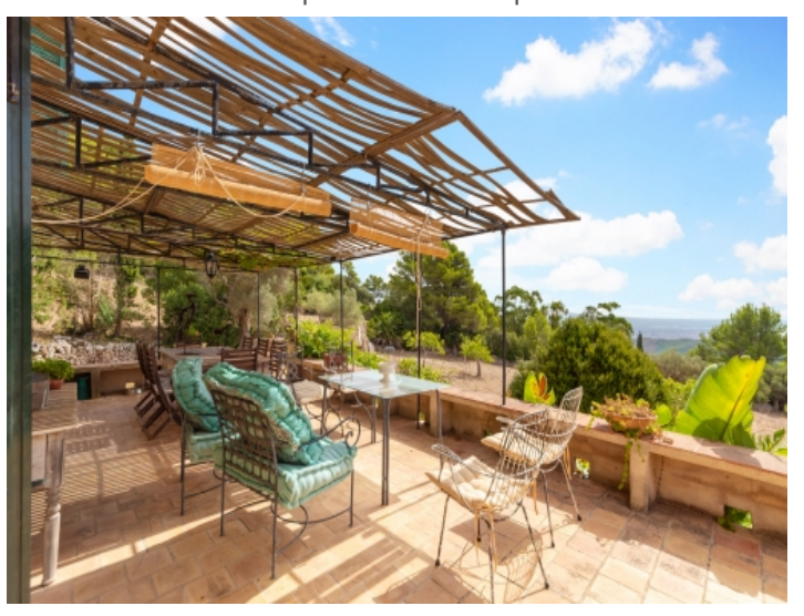
Terrace with wonderful distant views