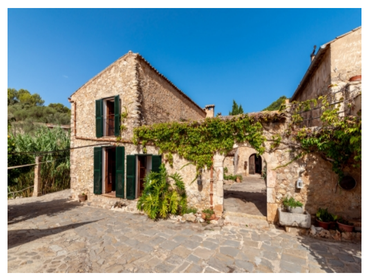
Exterior view of the authentic finca property