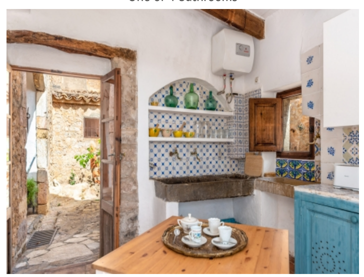
Rustic mallorquin kitchen with patio access