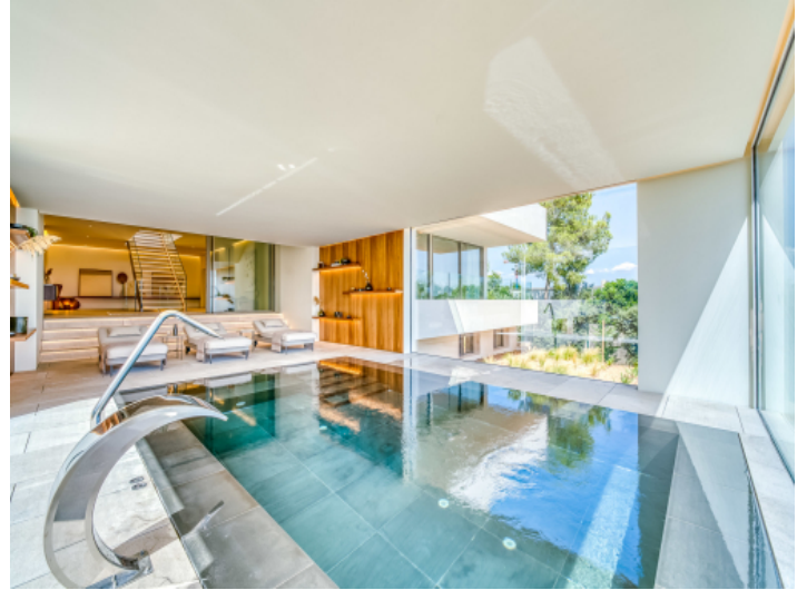
The Spa area