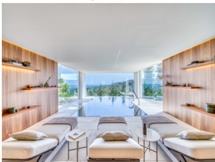
The Spa area with loungers and indoor pool