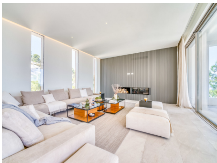
Beautiful living room