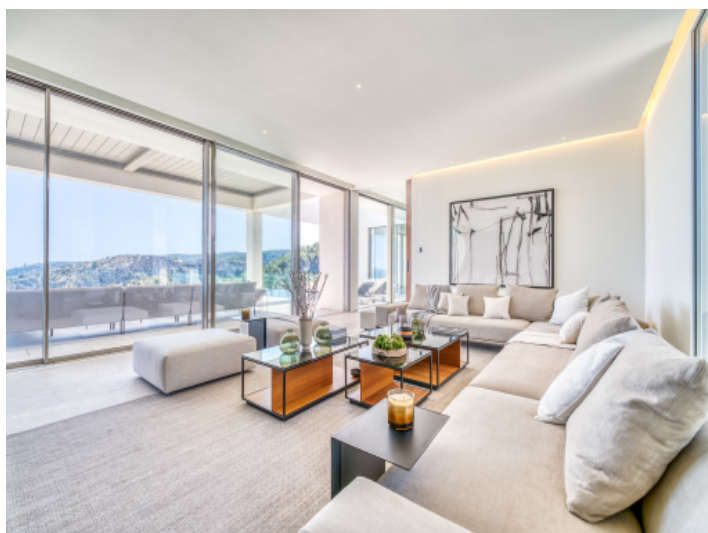
Bright living room with superb views