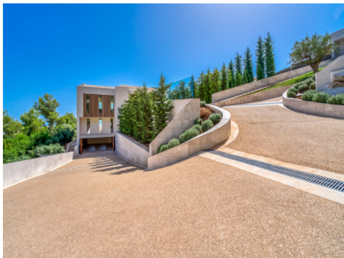
The driveway towards the garage