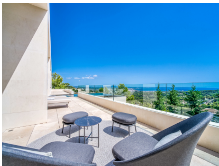
Spacious terrace with views