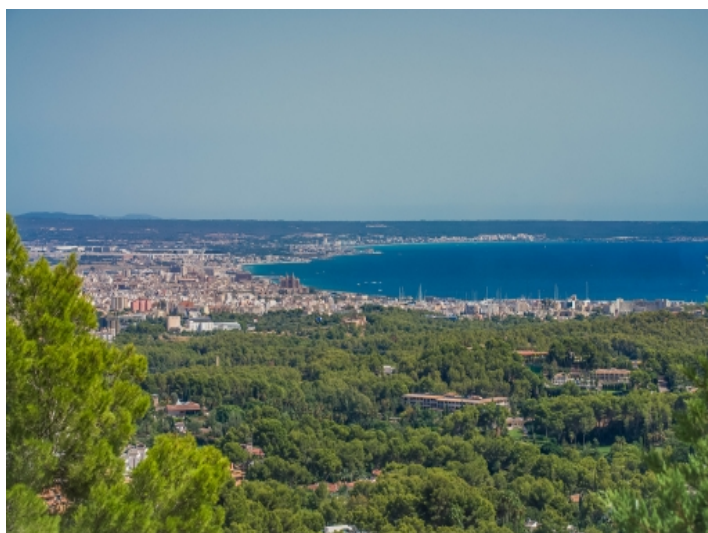
Magnificent sea views