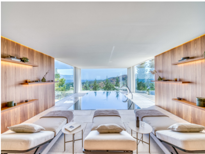
The Spa area with loungers and indoor pool