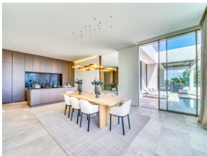
Open-plan dining area with kitchen