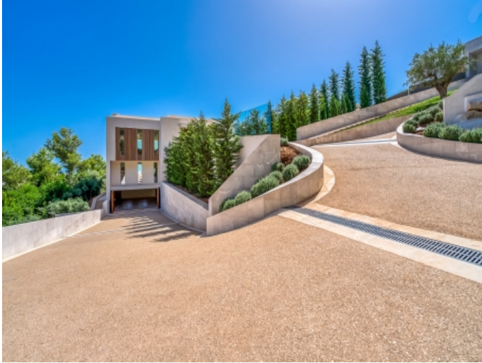
The driveway towards the garage