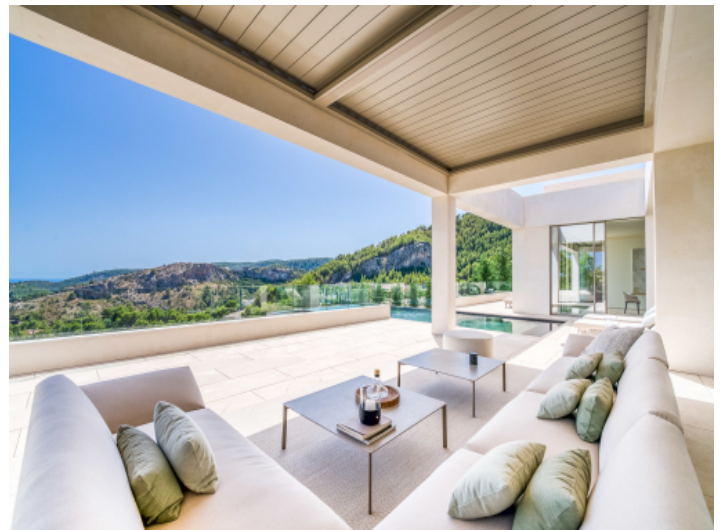
Covered terrace with mountain views