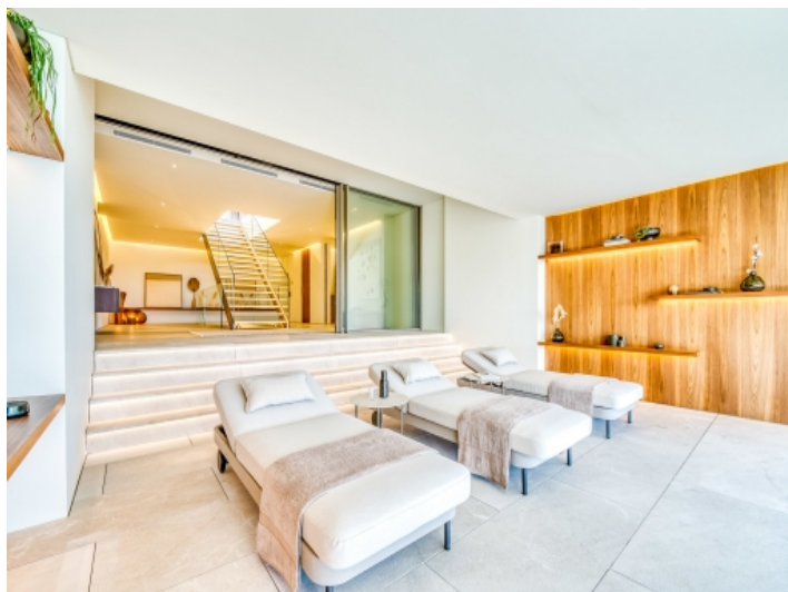
Loungers in Spa area