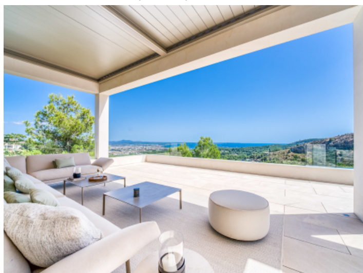
Large covered terrace with seating area