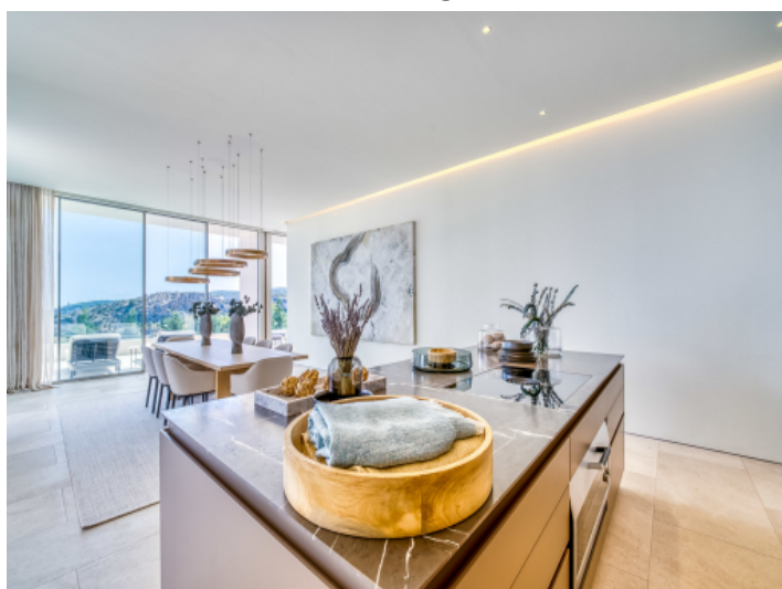
The kitchen island