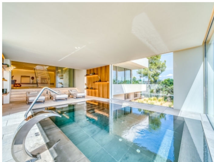
The Spa area