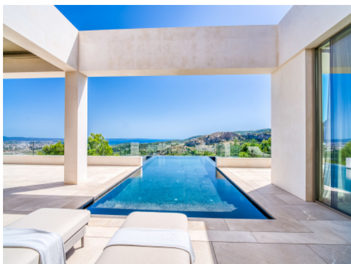
Overflow pool with views