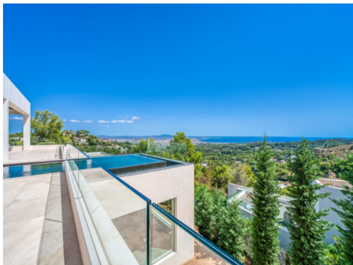
Sea and mountain views