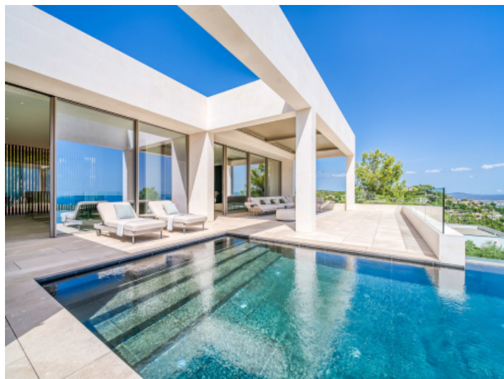
Splendid pool area