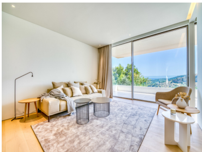
Cozy sitting area with a view