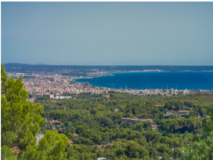
Magnificent sea views