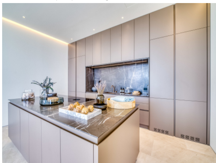
Fully equipped modern kitchen