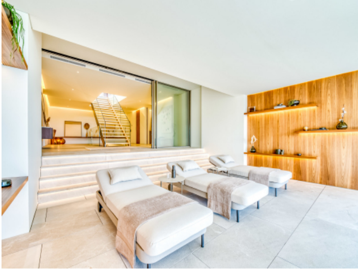
Loungers in Spa area