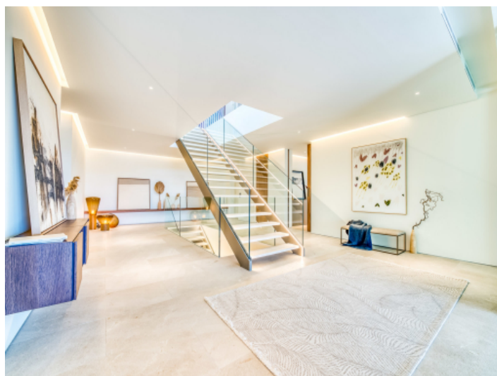
The modern staircase