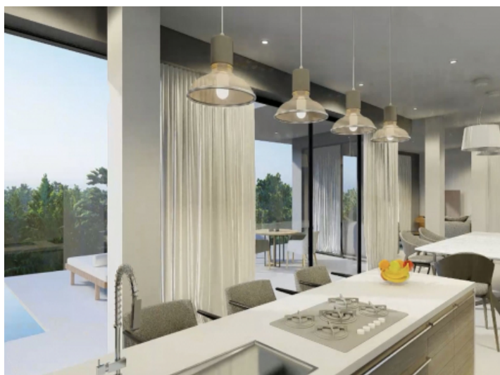
Kitchen with cooking island