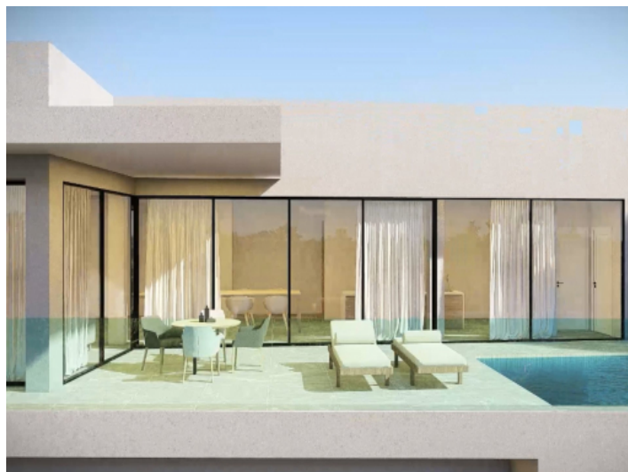
View of the pool