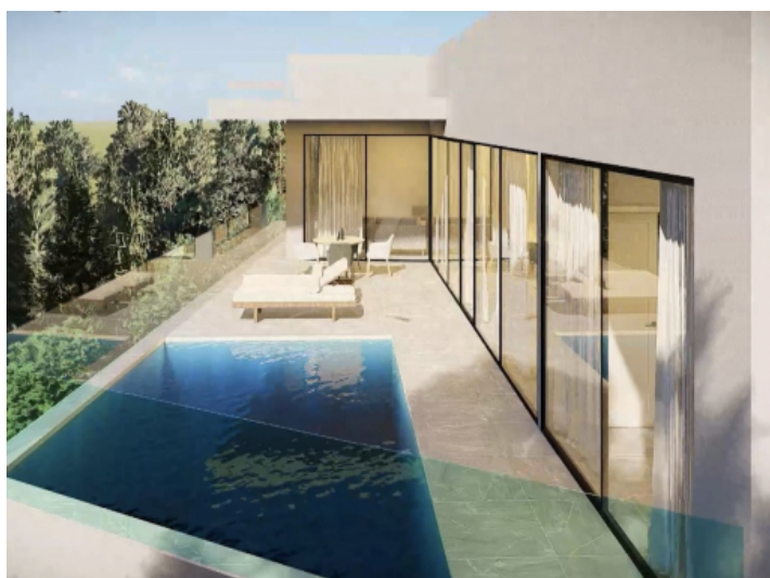
Terrace with pool