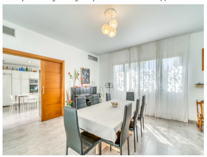
Bright dining area with access to the kitchen