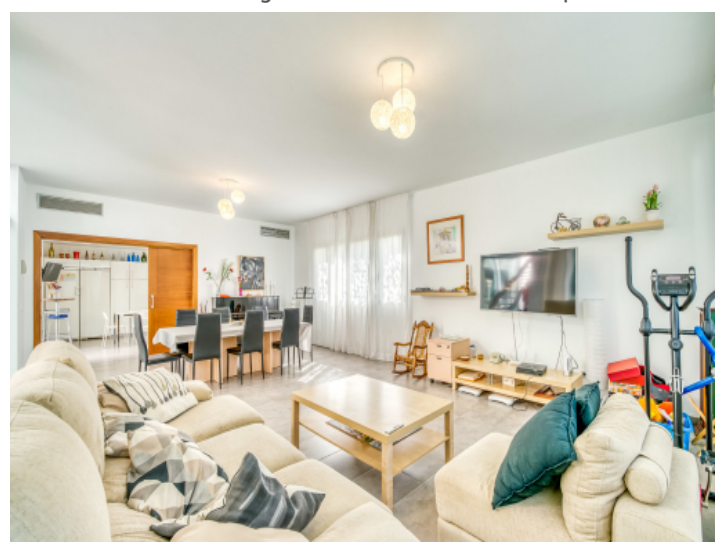
Large living and dining area