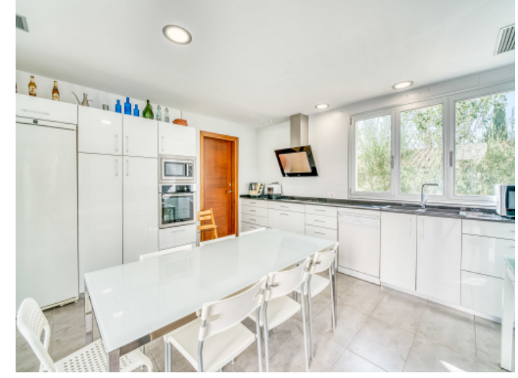
Large, modern kitchen

PORTA MALLORQUINA • C./ COLOM 20 2°, 07001 PALMA, SPAIN TEL.: +34 971 698 242 • INFO@PORTAMALLORQUINA.COM • WWW.PORTAMALLORQUINA.COM