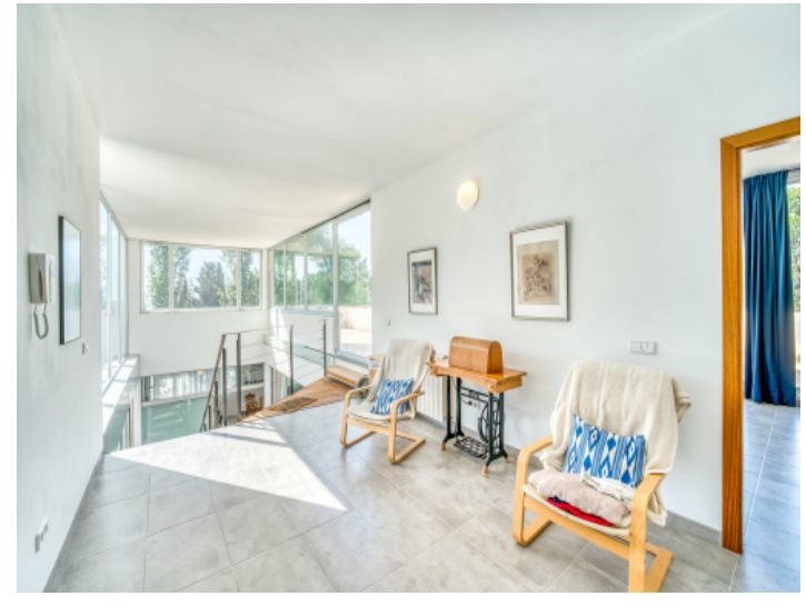
Corridor on the upper floor

PORTA MALLORQUINA • C./ COLOM 20 2°, 07001 PALMA, SPAIN TEL.: +34 971 698 242 • INFO@PORTAMALLORQUINA.COM • WWW.PORTAMALLORQUINA.COM