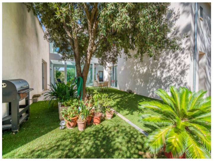
Idyllic patio-like bbq terrace