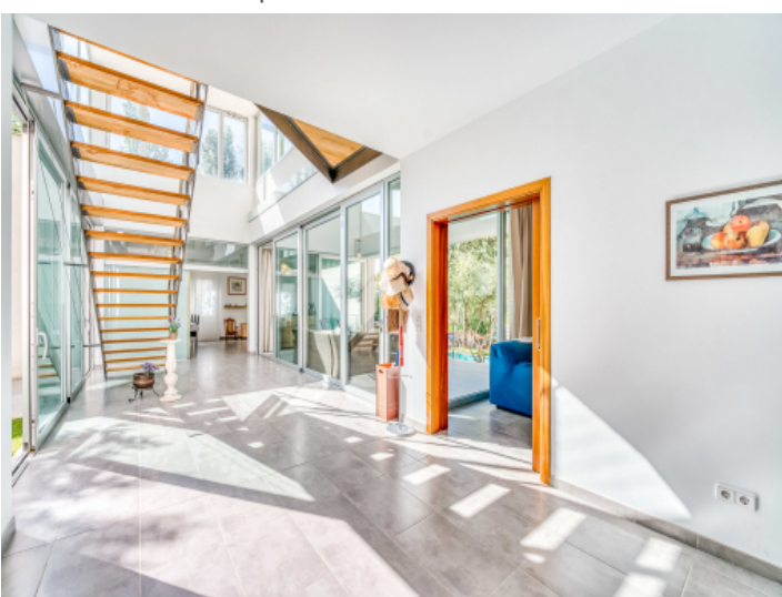
Elegant interior design