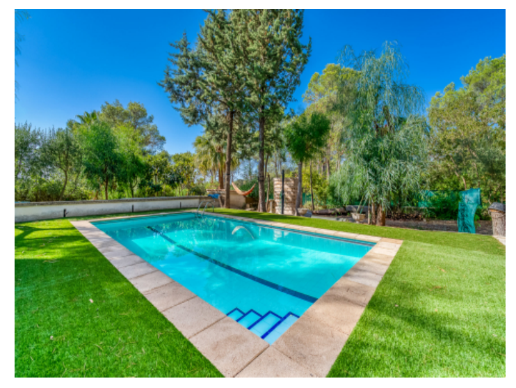
Large, private pool area