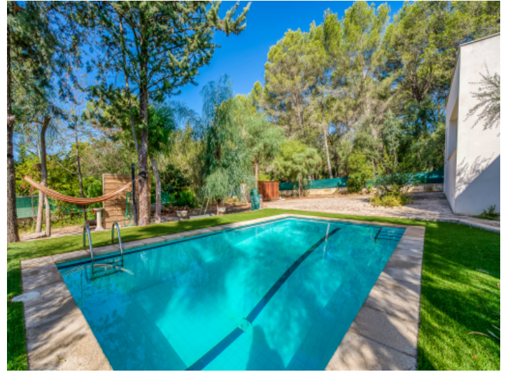
Salt-water pool surrounded by various trees

PORTA MALLORQUINA • C./ COLOM 20 2°, 07001 PALMA, SPAIN TEL.: +34 971 698 242 • INFO@PORTAMALLORQUINA.COM • WWW.PORTAMALLORQUINA.COM