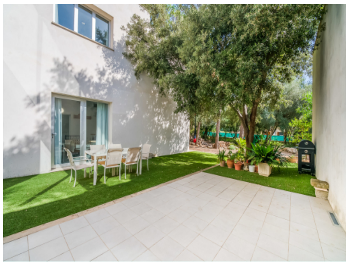
Spacious kitchen terrace