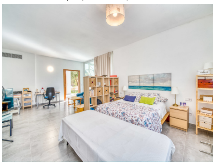
Large bedroom on the ground floor