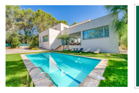
Sa Pobla search for property MAL-118759