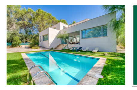
Sa Pobla search for property MAL-118759