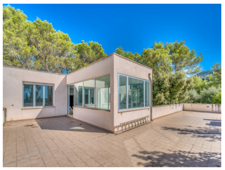
100 sqm roof terrace