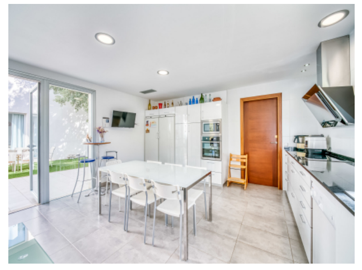
Direct access to a patio-terrace