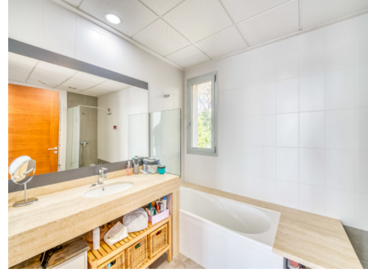
Modern bathroom with bathtub