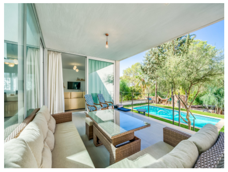
Covered lounge terrace with view to the pool