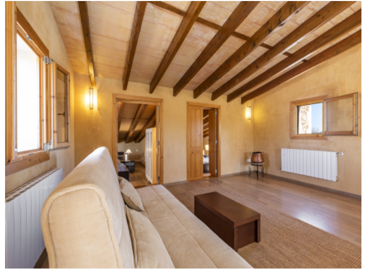
Living room on the upper floor