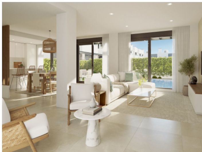
Open living and dining area