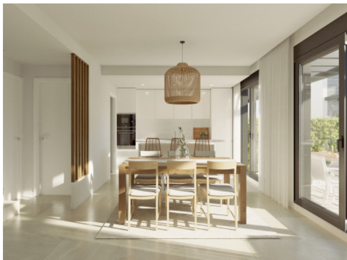
Open living and dining area