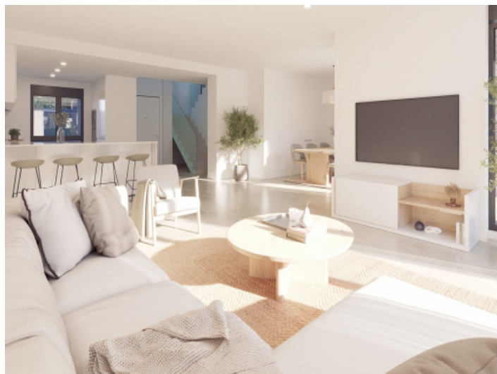
Open living and dining area