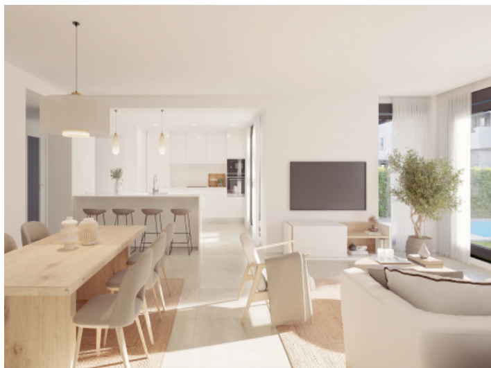
Open living and dining area