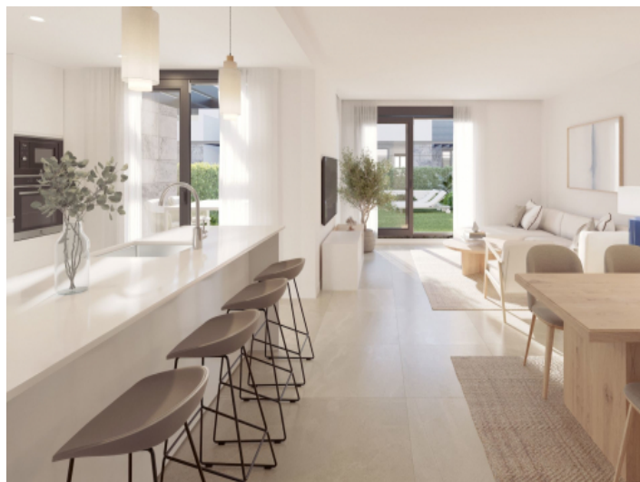
Open living and dining area