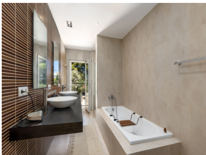
One of 4 bathrooms