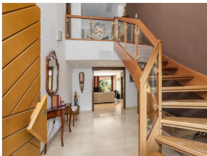
View of the floor