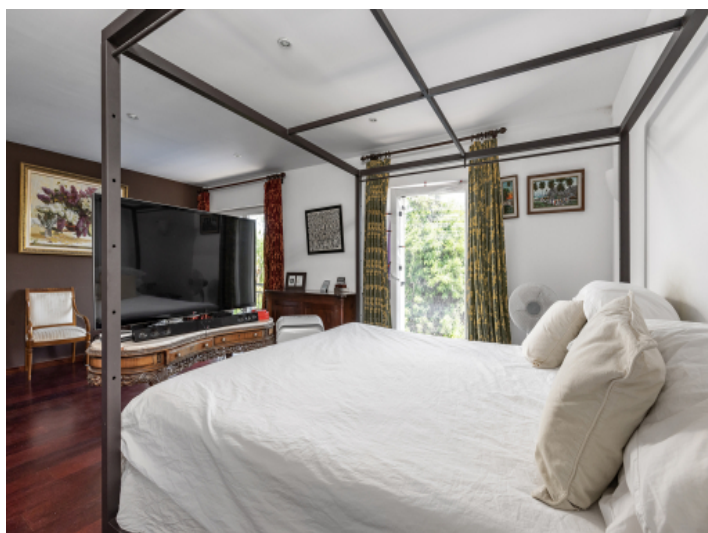
Spacious double bedroom