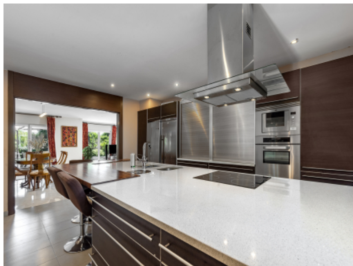
Modern kitchen with cooking island