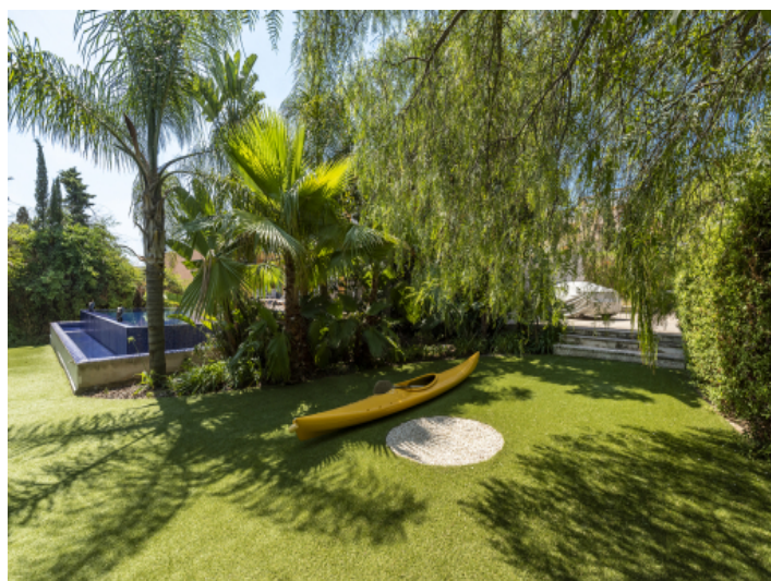
Garden and pool