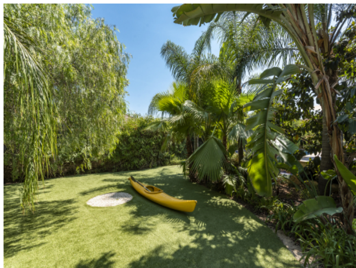
Large garden area