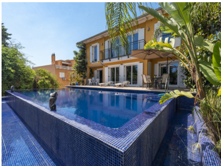
Luxury villa with pool in Magaluf