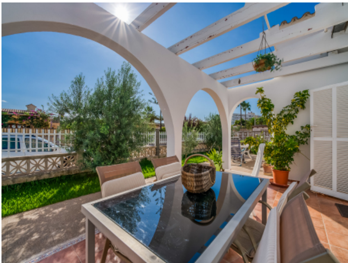
Front terrace with dining area