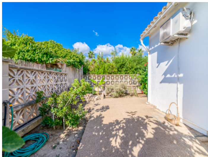
Terrace and small garden