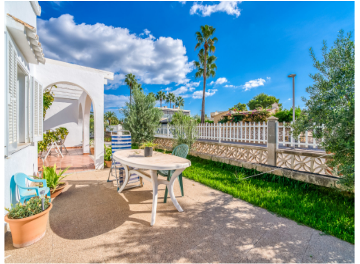
Beautiful front terrace