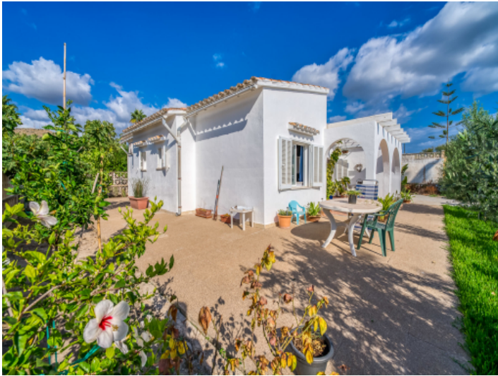
Large terrace surrounds the house