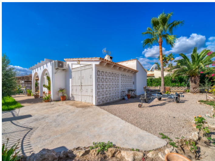
Spacious outdoor area