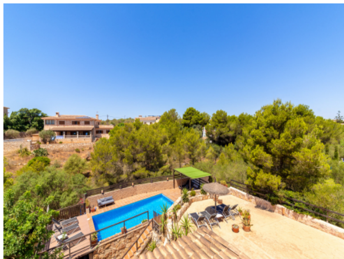
View over the pool and terrace area