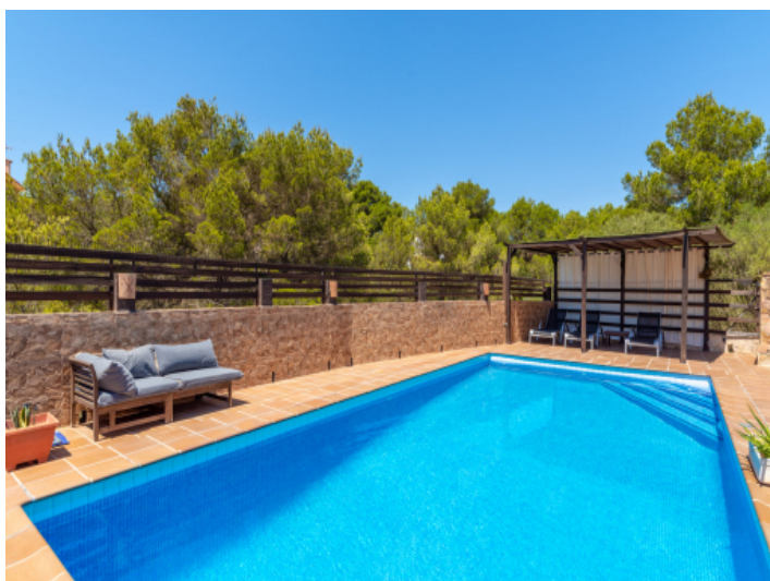
Pool in a tranqui loaction