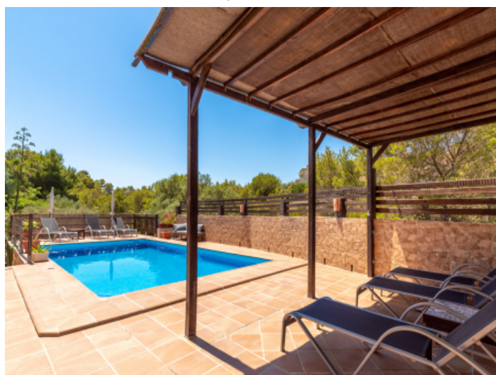
Partly covered pool terrace