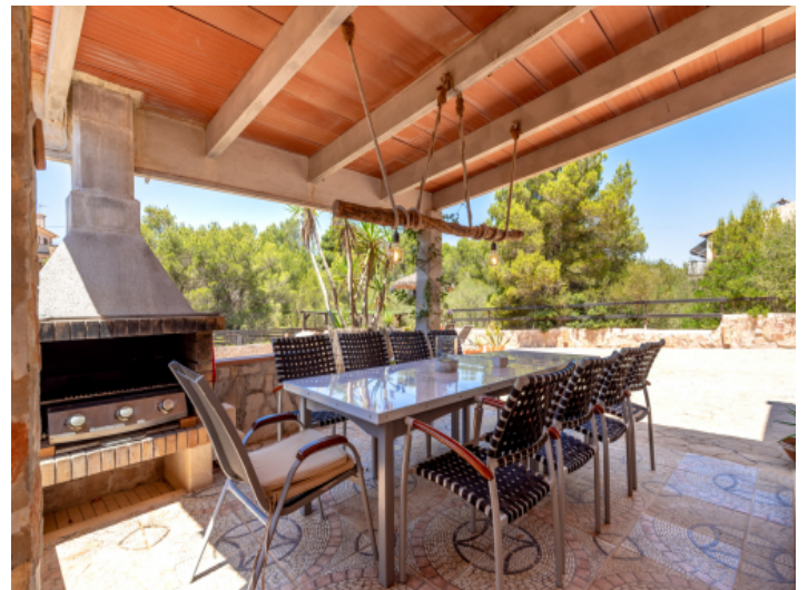
Covered bbq area