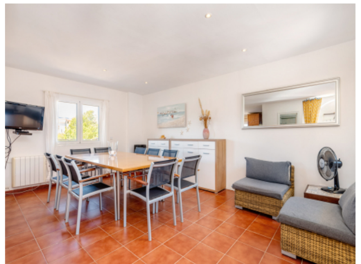
Spacious dining area