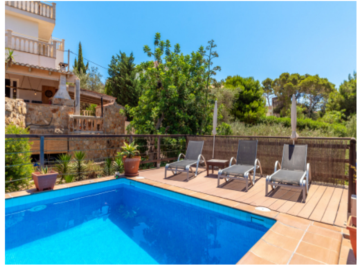
Pool and sun terrace