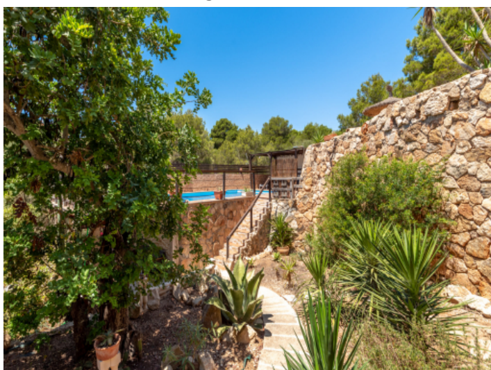
Enchanting access to the pool area