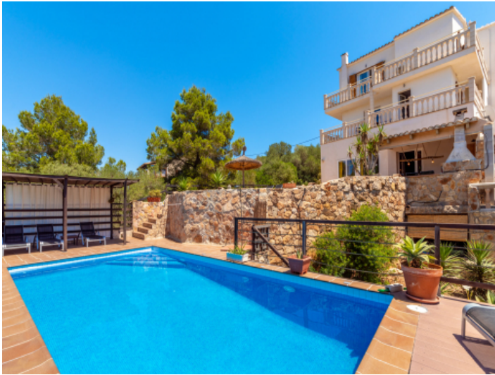
Wonderful pool for the summer