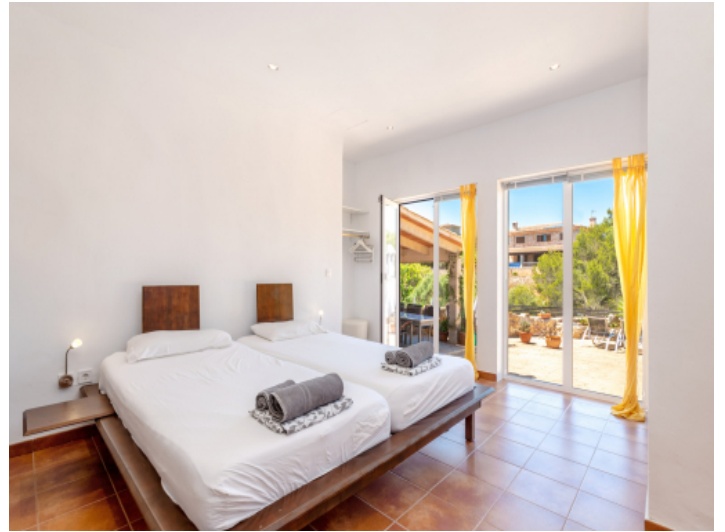
Double bedroom with terrace access