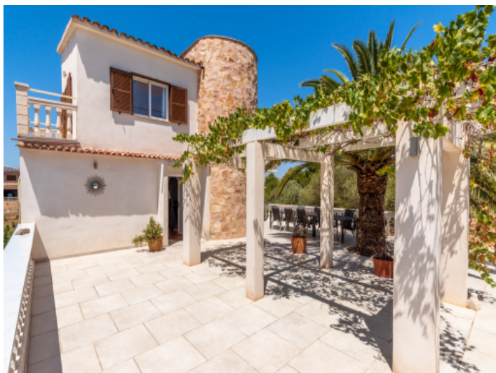
Large rear terrace