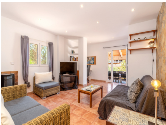
Living area with terrace access