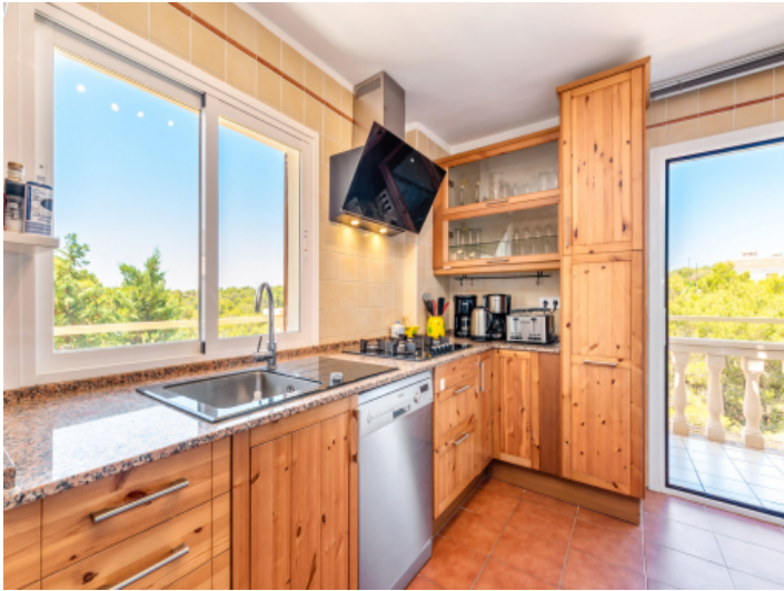
Kitchen with access to the outside