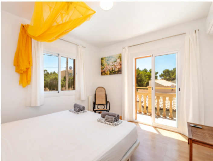
Bedroom with balcony access