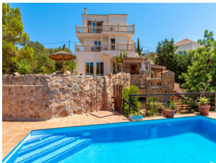
Finca and pool area