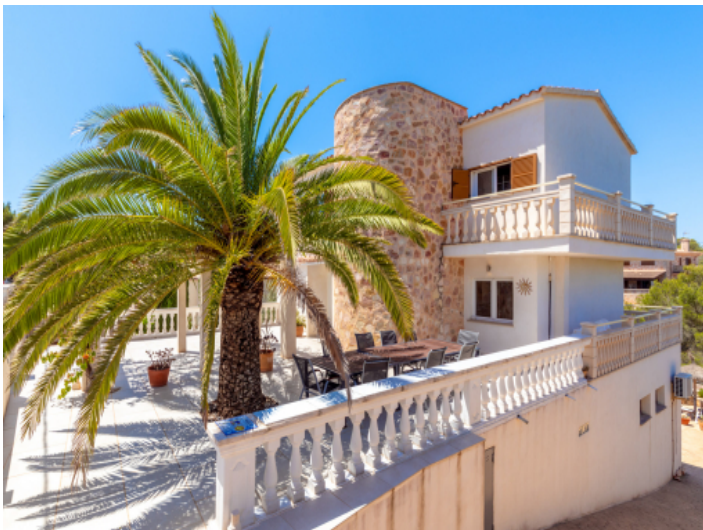
Large rear terrace of the house