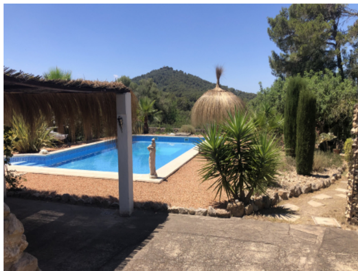
Inviting pool area