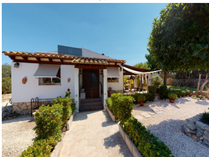
Front view of the house