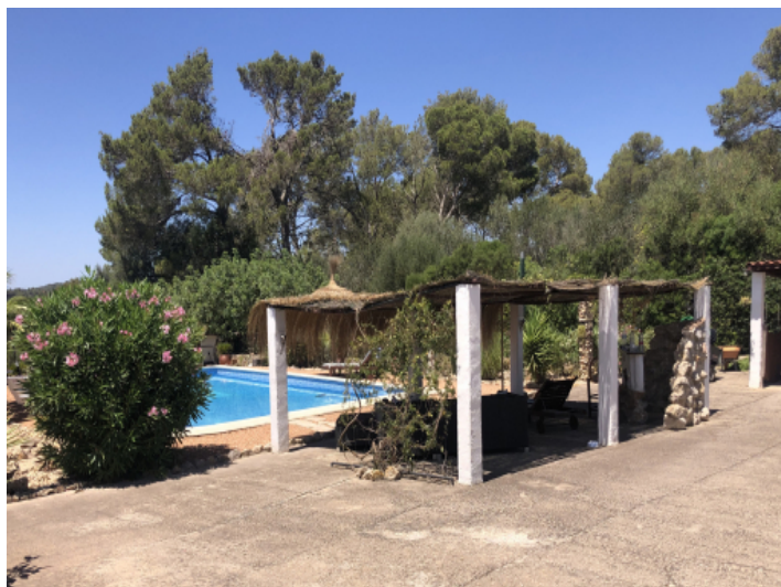
Inviting pool area