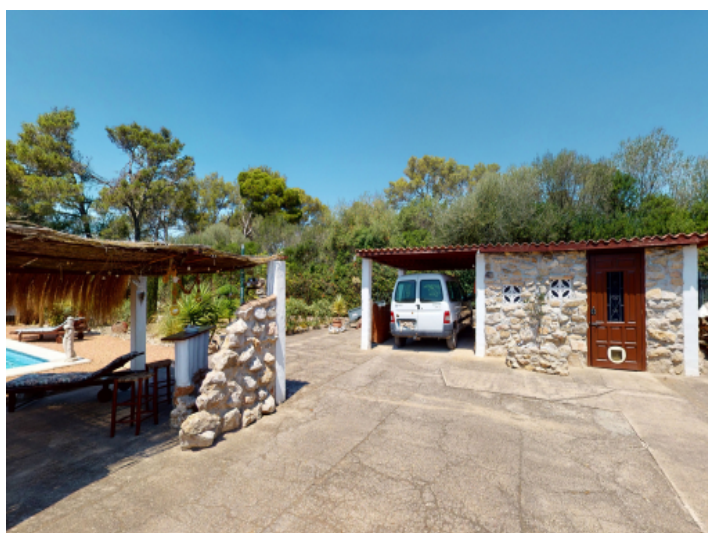
Covered parking space