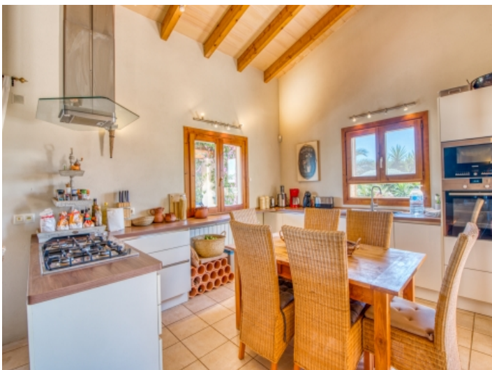
Equipped kitchen with dining area