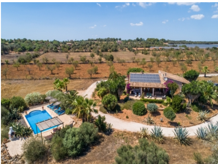
Country house in Santanyi