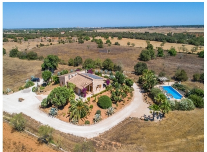
View of the property