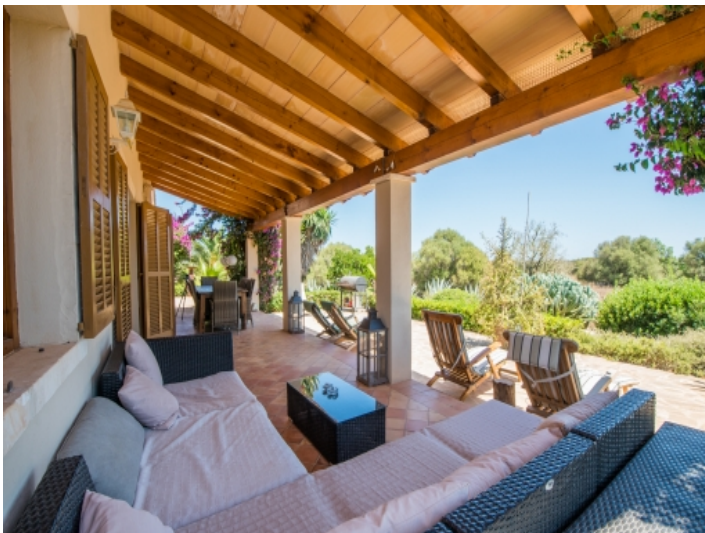
Outdoor lounge area