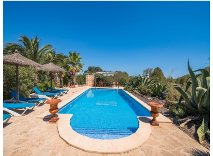
Splendid pool with sun loungers