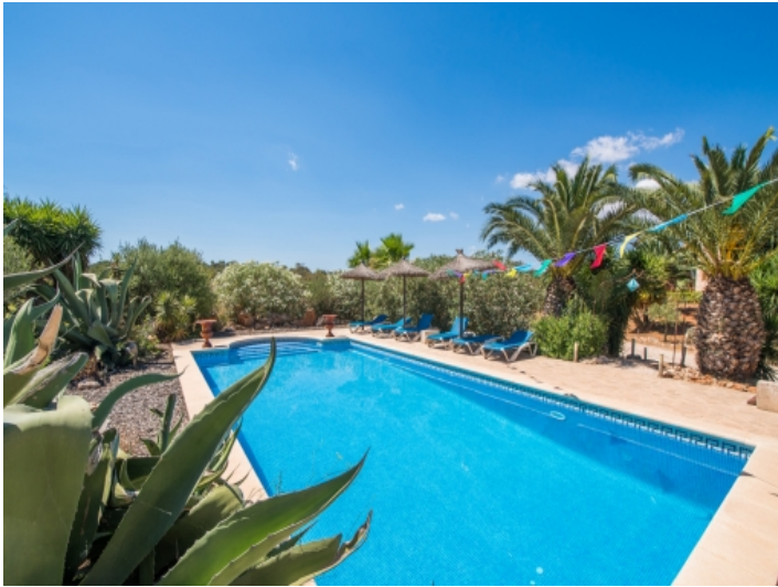
Pool surrounded by Mediterranean plants