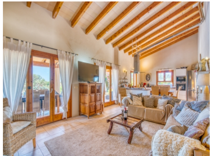
Spacious living area and open kitchen