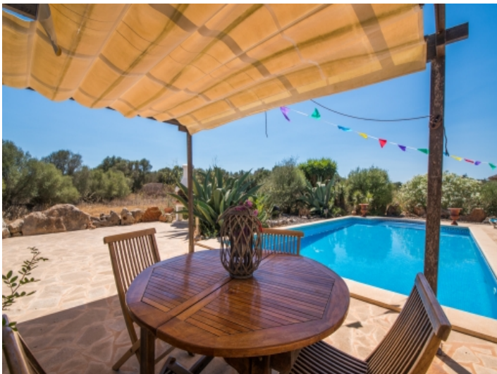
Large pool area