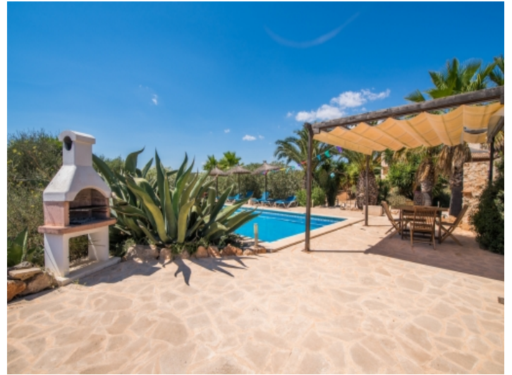
Pool area with barbecue