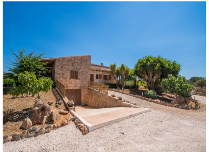
Garage of the country house