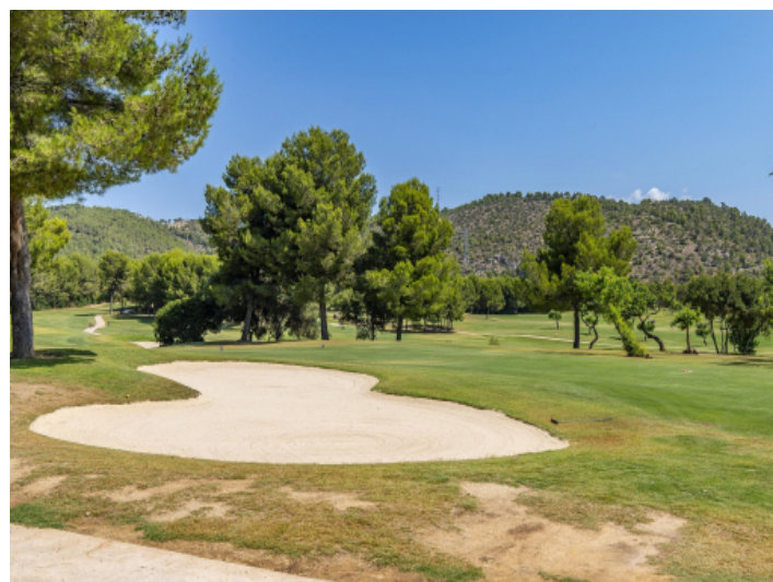
Close to the golf course