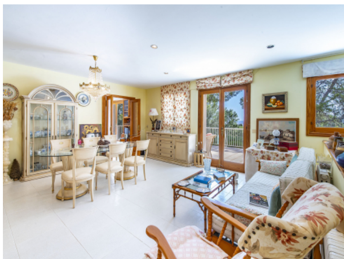
Large dining and seating area