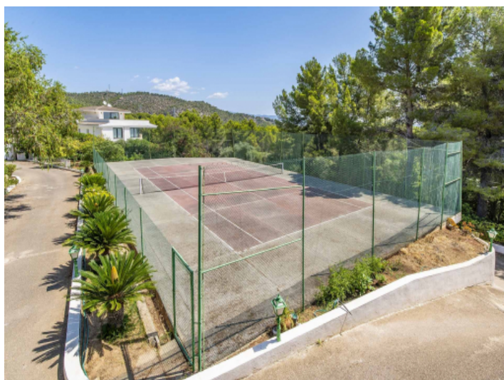
Own tennis court