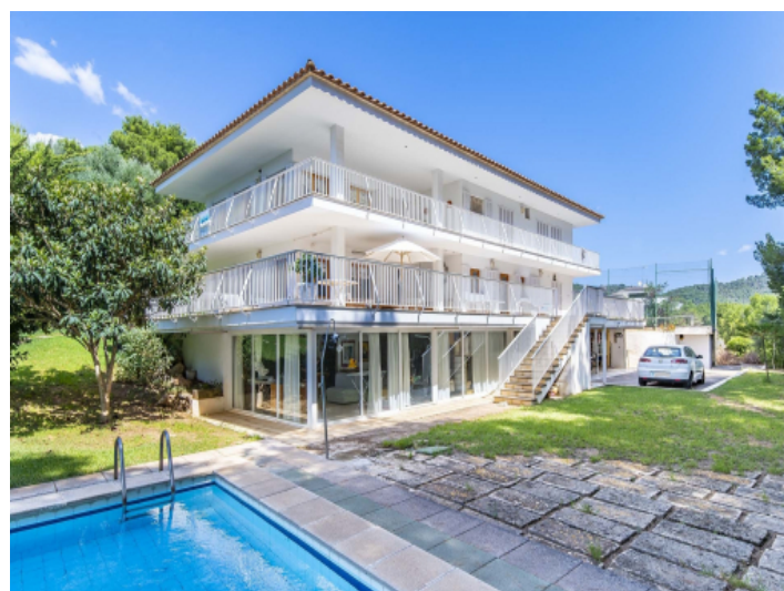
Pool and garden area