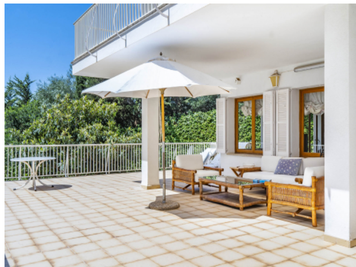
Large covered terrace