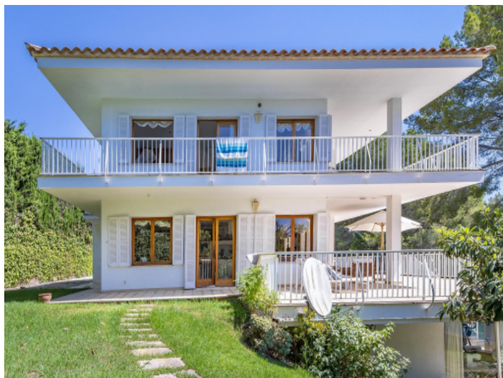
Exterior view of the large villa