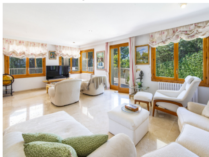
Lightflooded living area