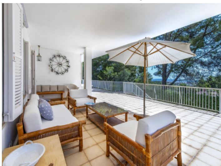
Tranquil lounge terrace