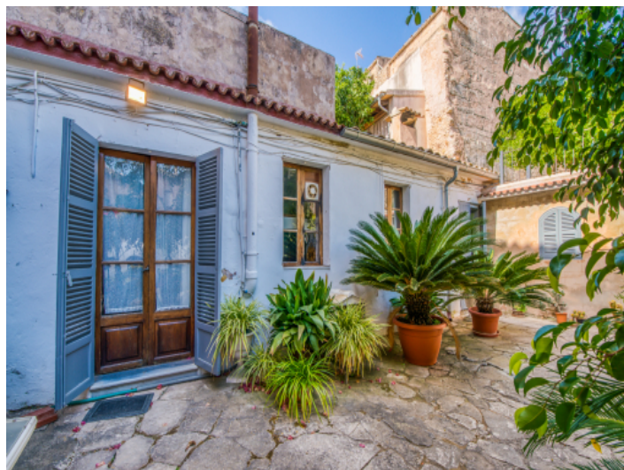
Patio and garden