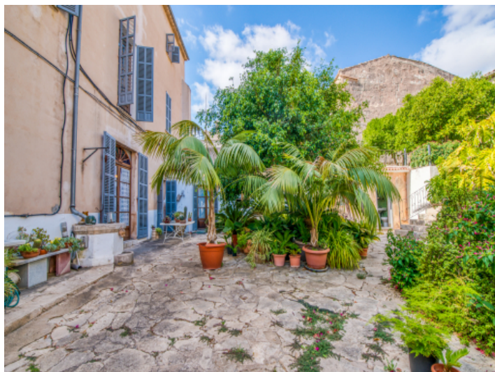
Patio and garden