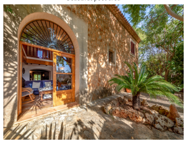
Access to the living area