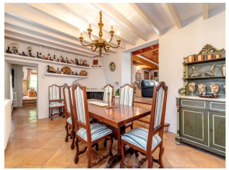
Separate dining area