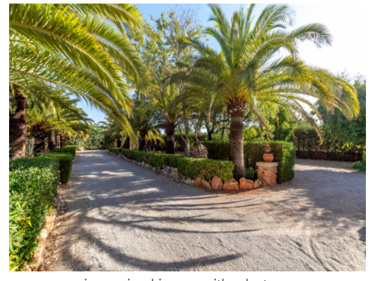
impressive drive way with palm trees