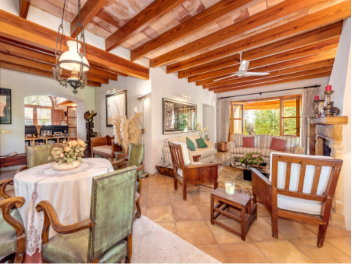
Separate living and dining area