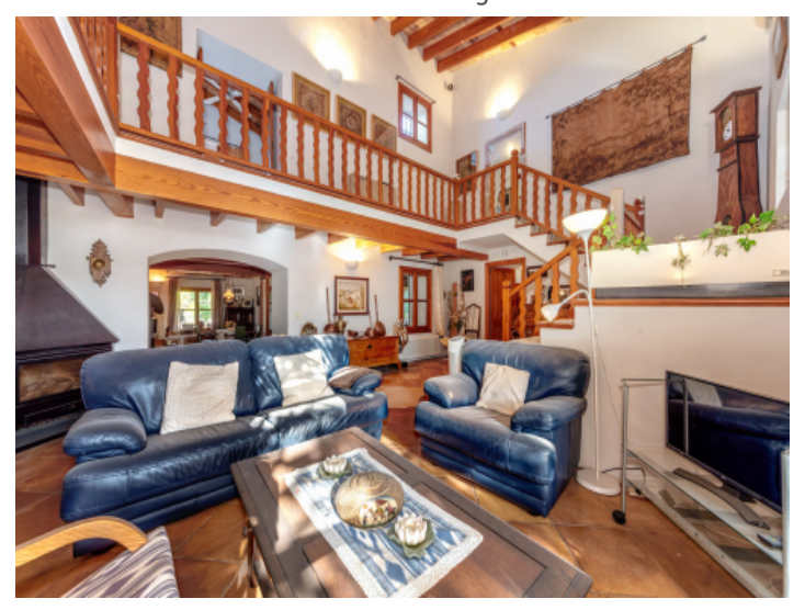
Open living area