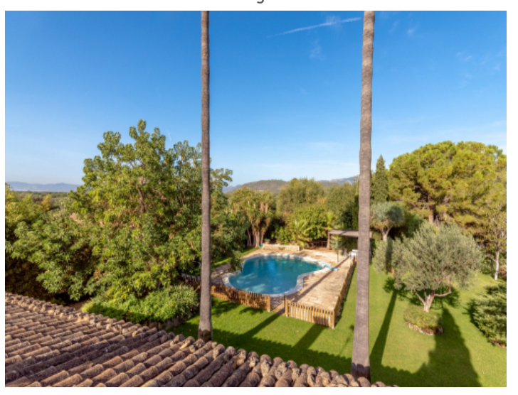
View to the pool