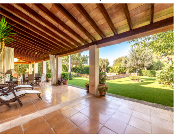
Terrace with garden views