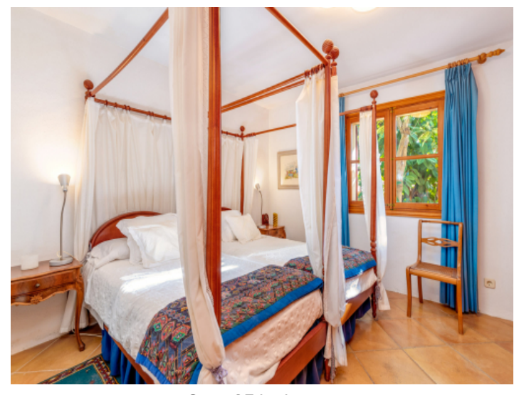
One of 7 bedrooms