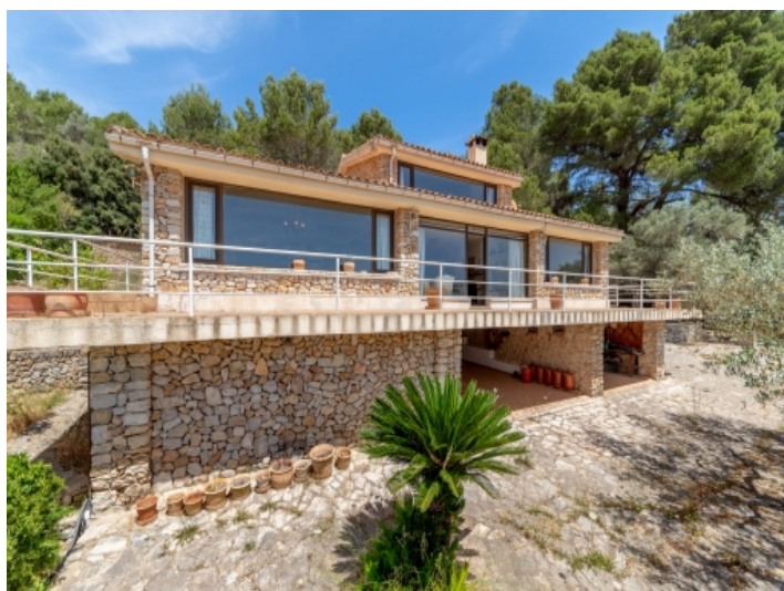
Beautiful natural stone finca with amazing views in Biniarroy