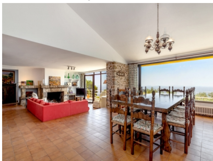
Open living- and dining area with panoramic windows