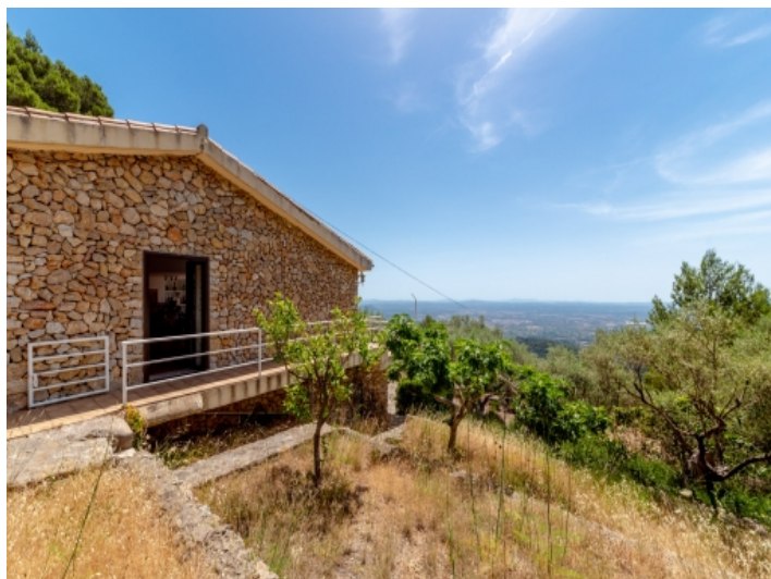
Side view of the finca