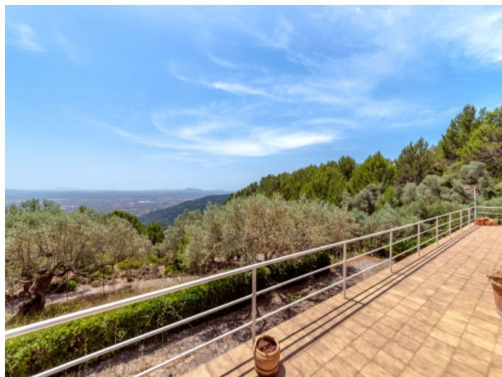
Spacious terraces surrounding the property