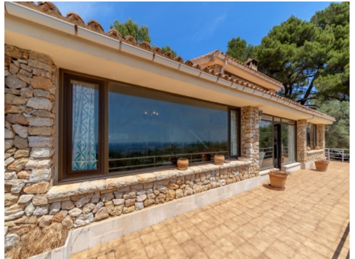
Spacious terraces surrounding the property