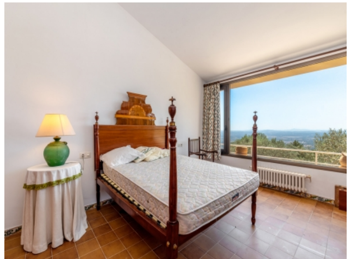
Cosy bedroom with outstanding views