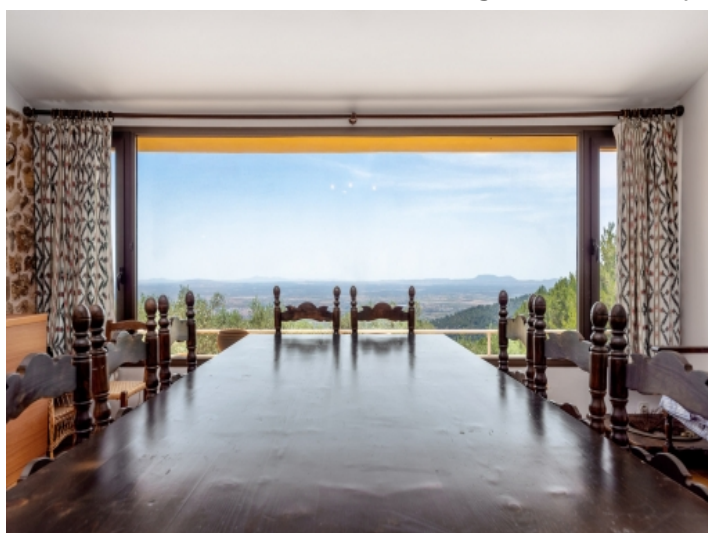
Dining area with a view