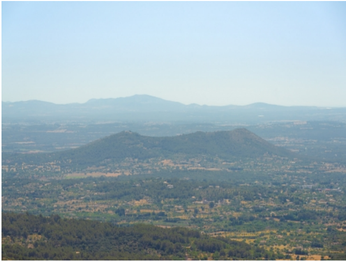
View over Palma