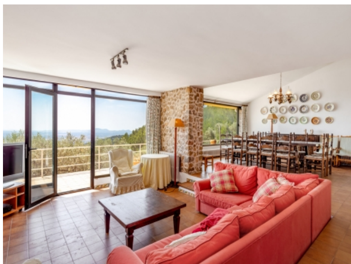
Fantastic living area