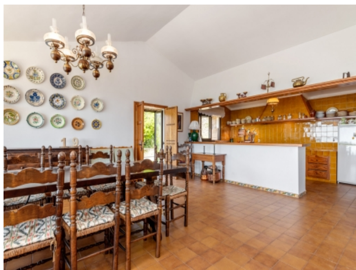
Mallorcan dining area