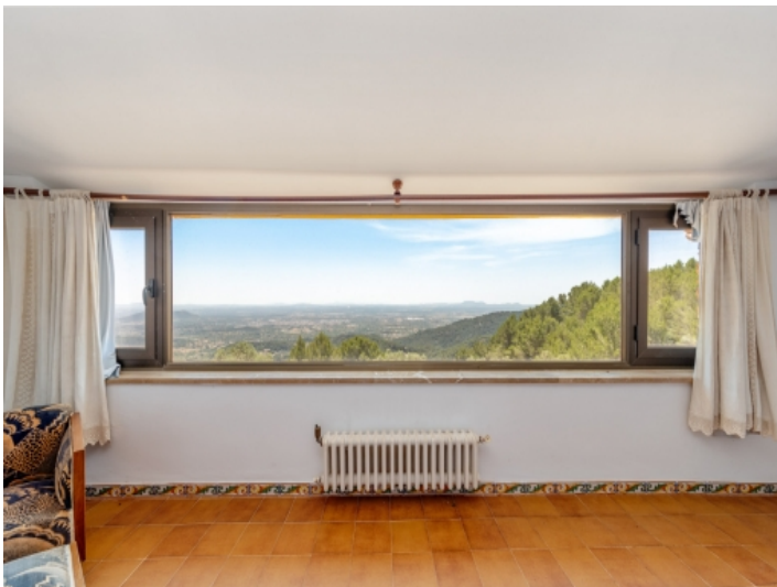
Large panoramic windows