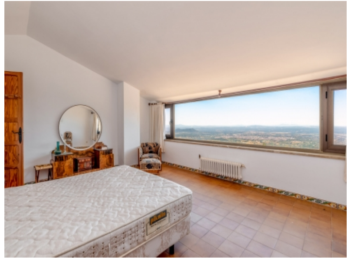
Spectacular views in the master bedroom