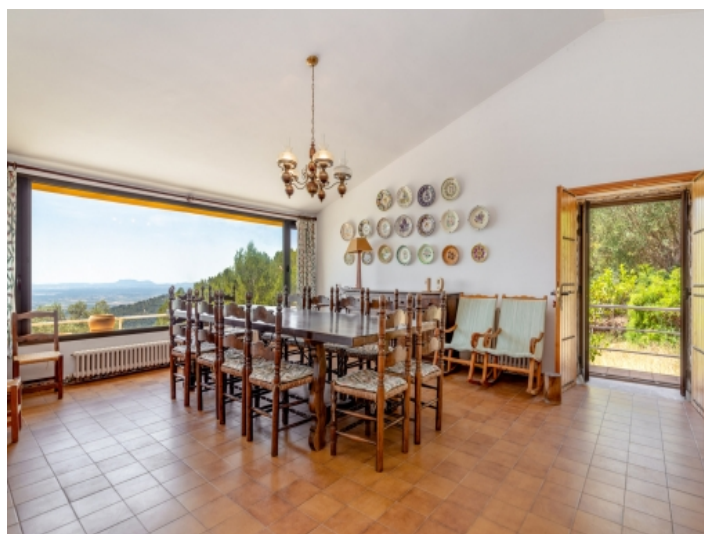
Dining area with a view