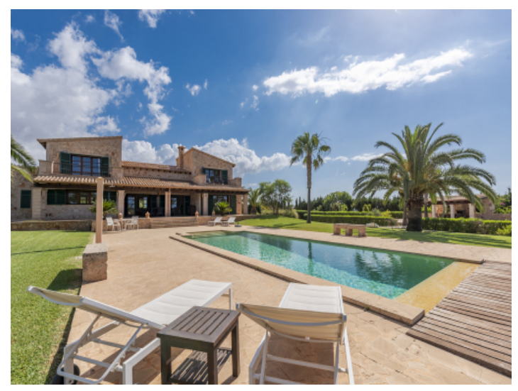
Fantastic finca with pool