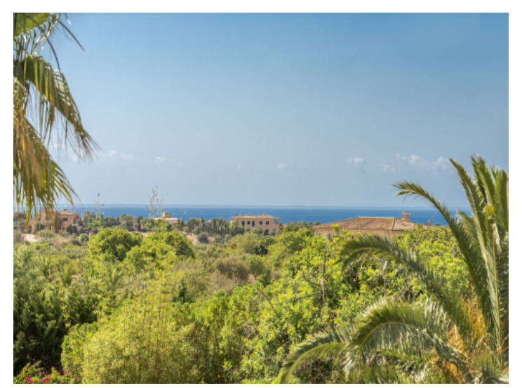
Views to the sea