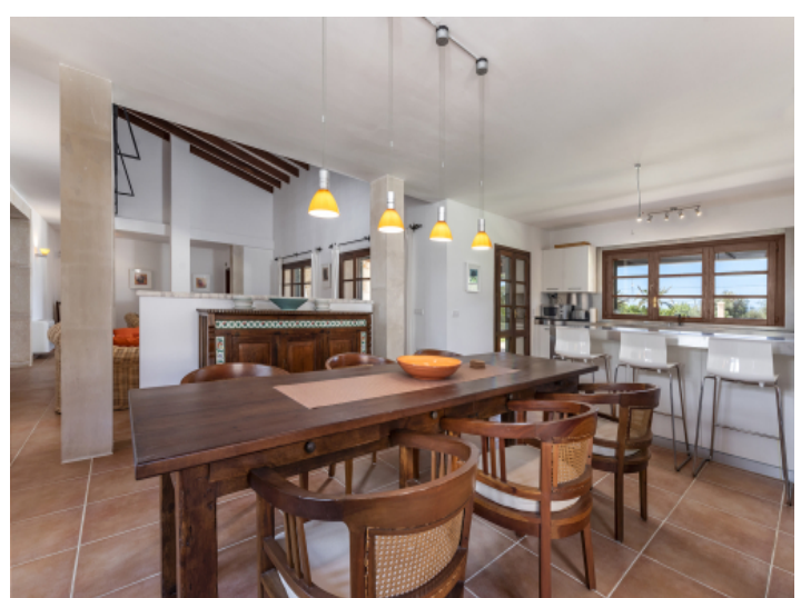
Rustic dining area