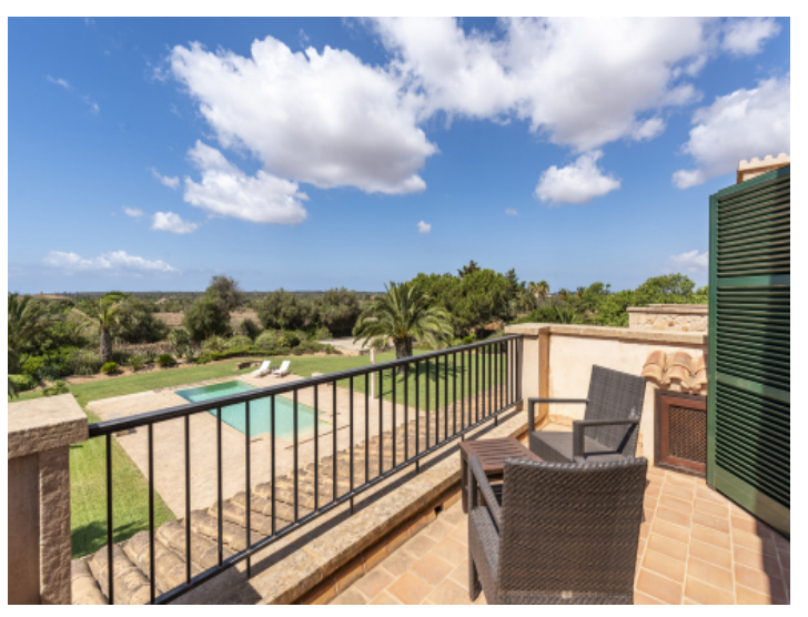
View to the pool