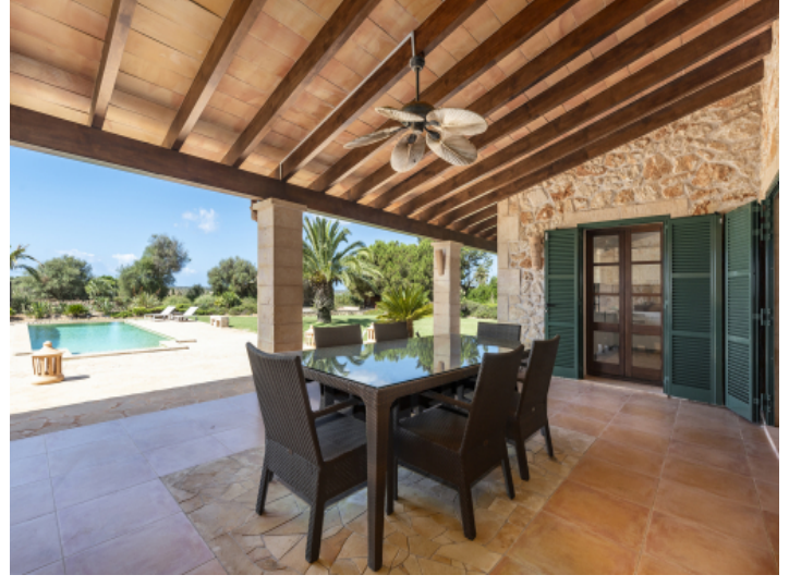
Covered terrace with dining area