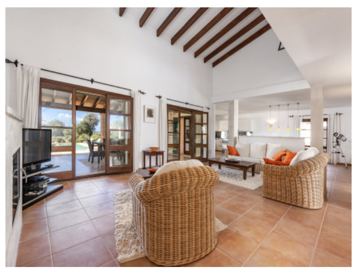
View into the garden