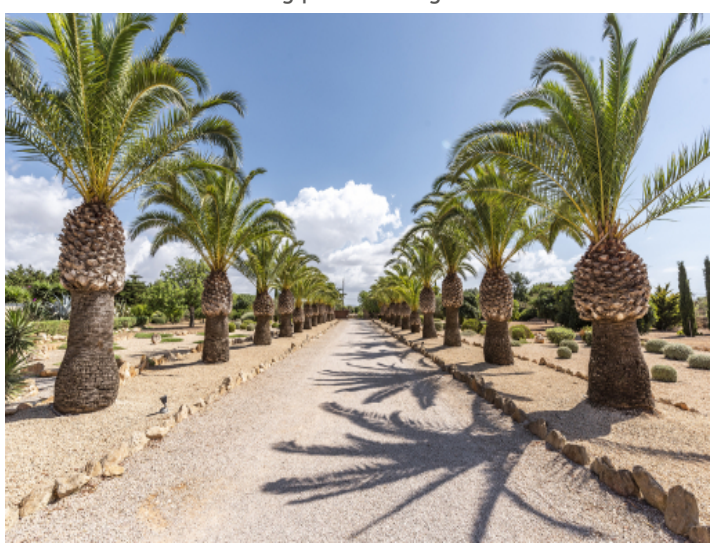
Impressive drive way leading zo the property