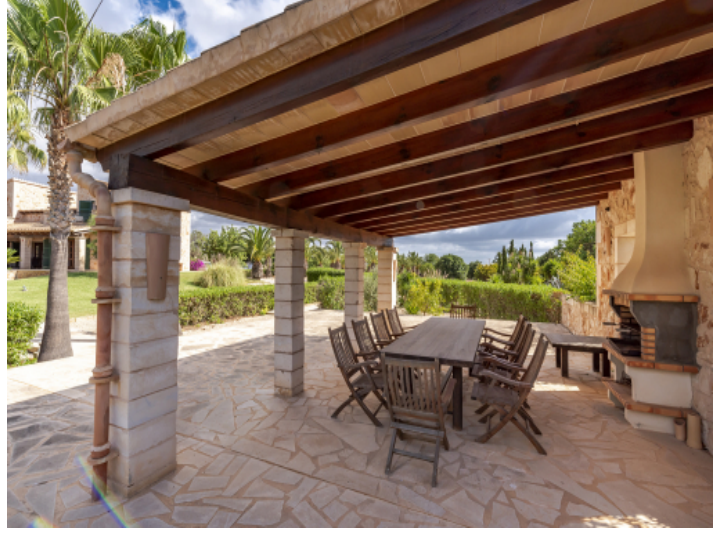
Covered barbecue area