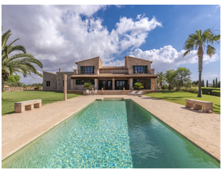
Inviting pool in the garden