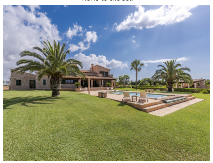
Large garden and pool area