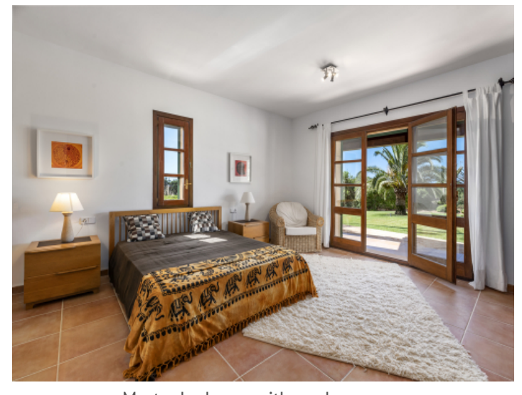
Master bedroom with garden access