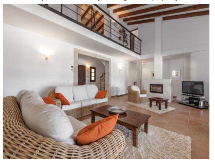
Open plan living area with marble fireplace