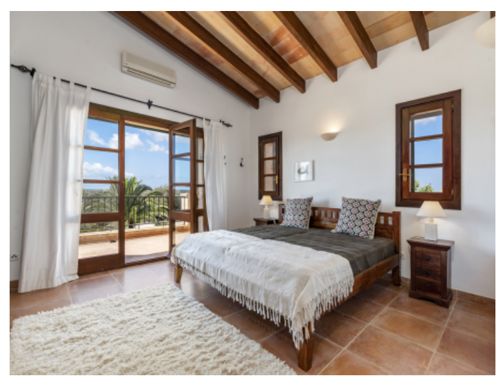
Bedroom with access to the balcony