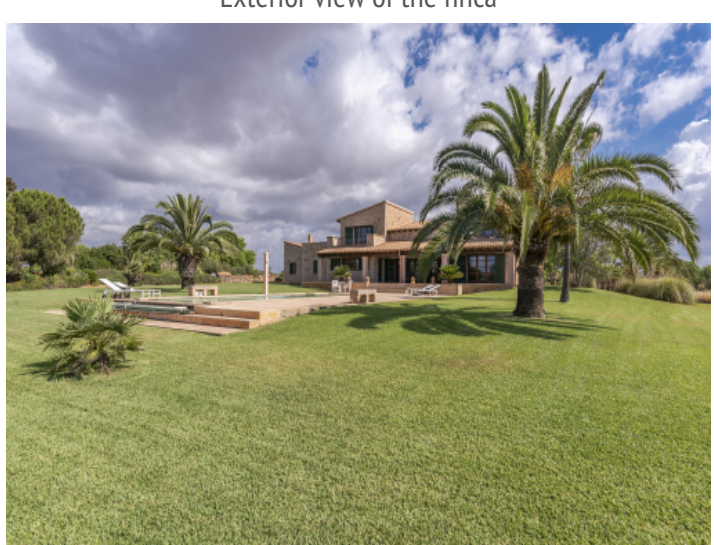
Large garden and exterior view of the finca