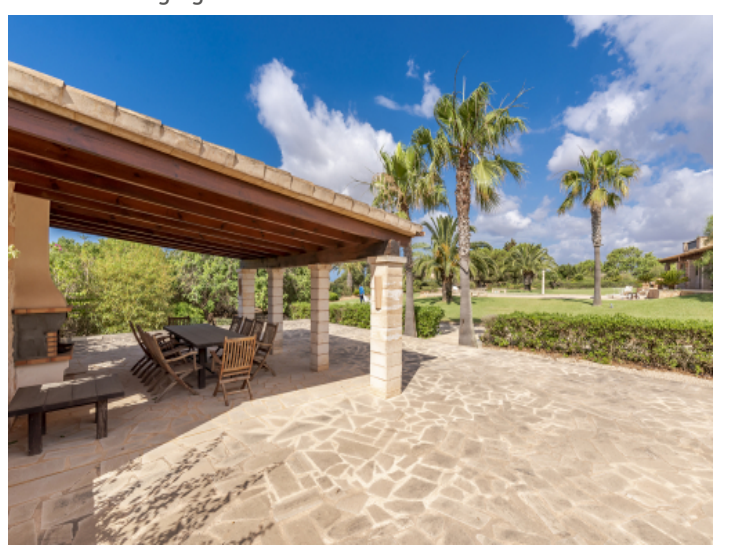
View into the garden