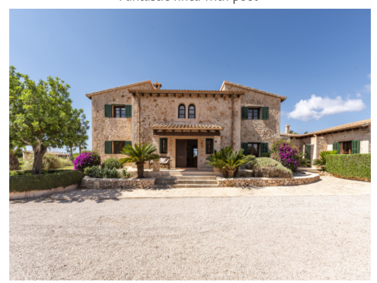
Front view of the finca