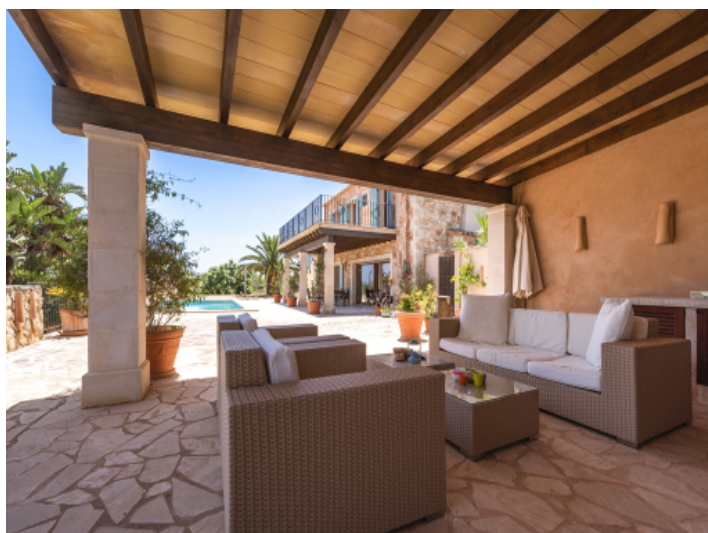
Covered chill out area