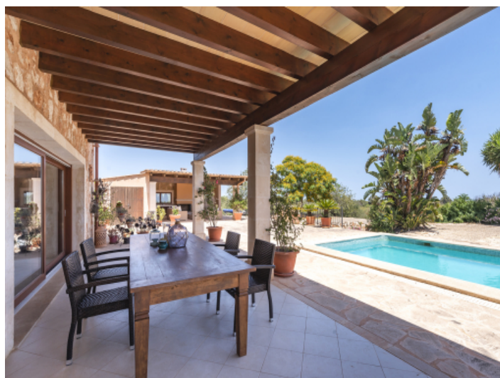
Dining area by the pool