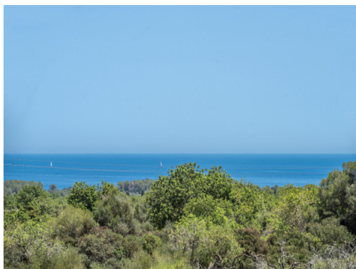
View to the sea