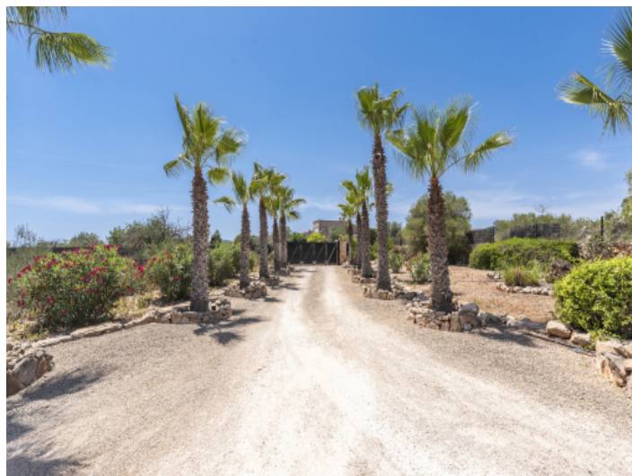
Access to the finca