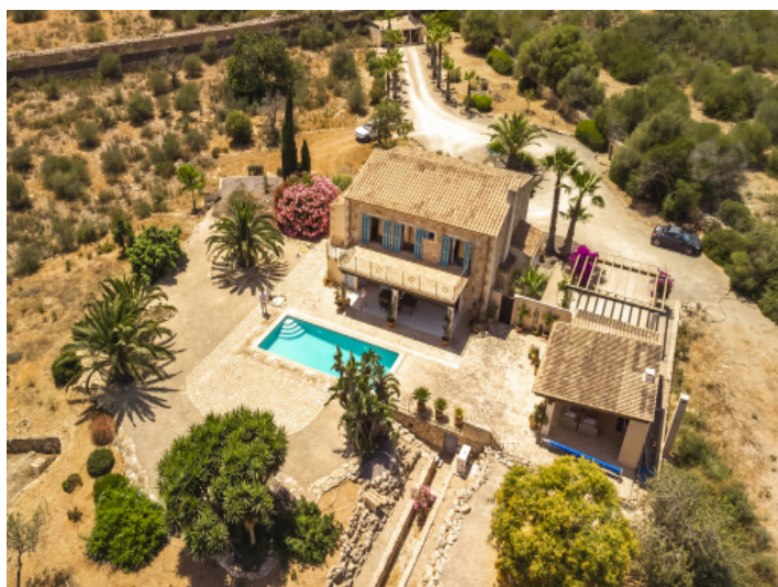
The finca from a birds-eye view