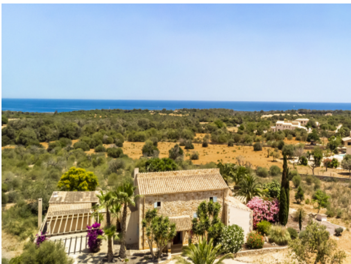
Close to the sea