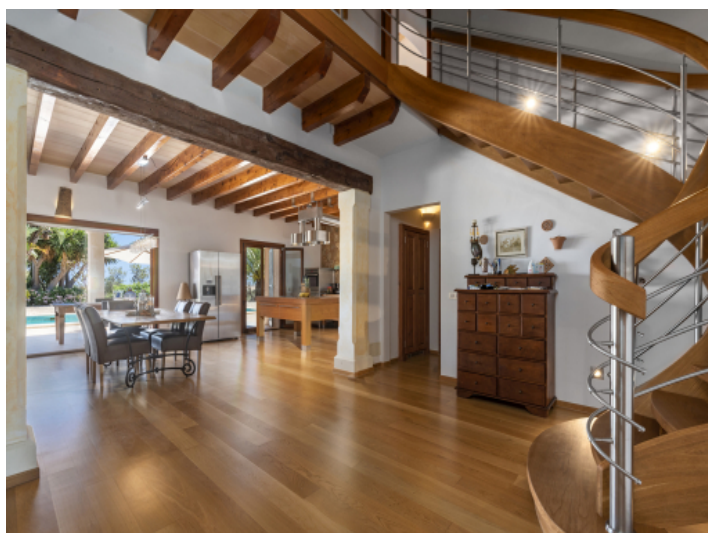
Open living area and floor