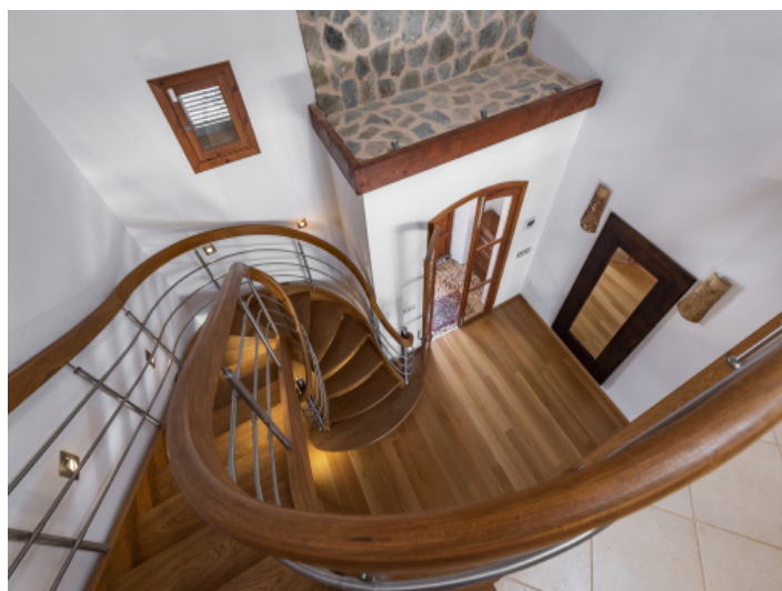
Spacious entrance area