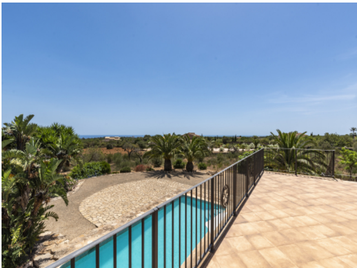
Romantic finca with pool in S'Espinagar