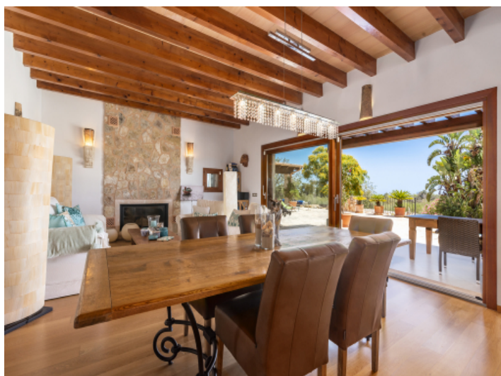
Dining and living area