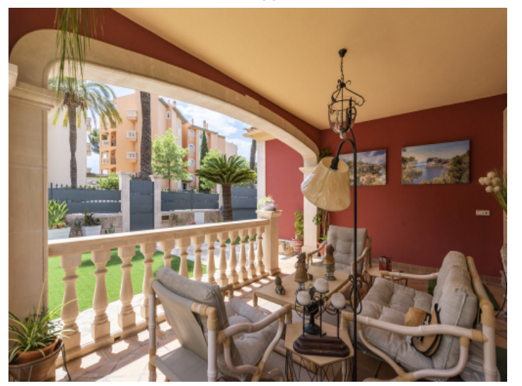
Covered terrace with lounge