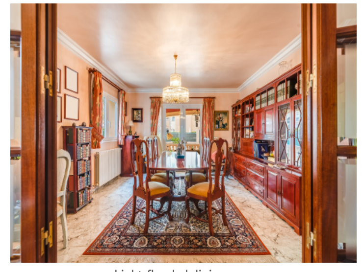
Light-flooded dining area