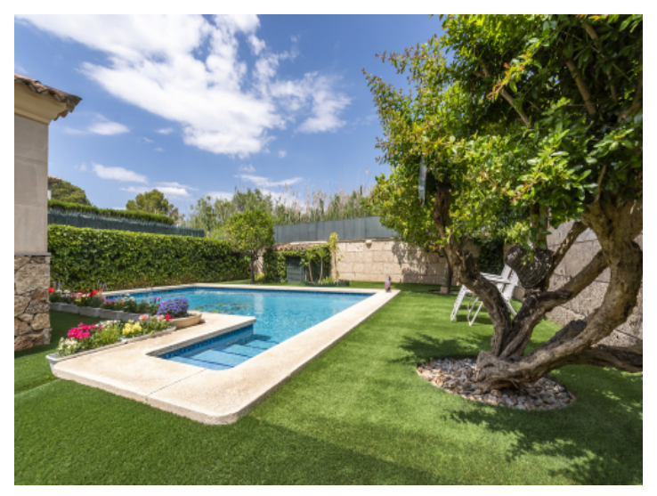
Well-maintained pool area