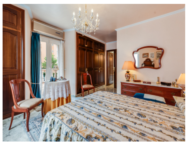
One of 5 bedrooms