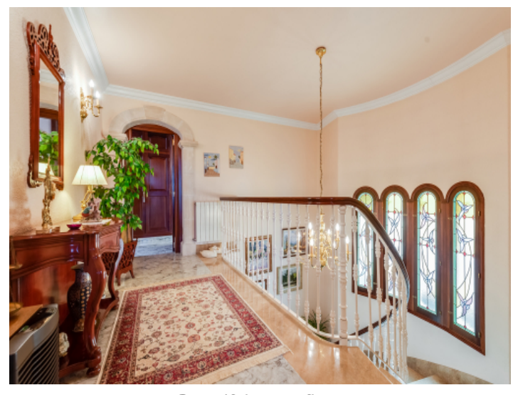
Beautiful upper floor