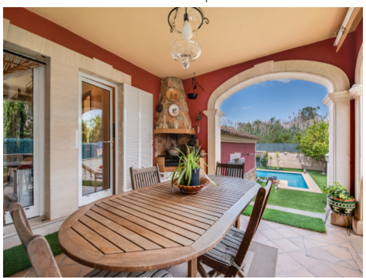
Covered terrace with dining area