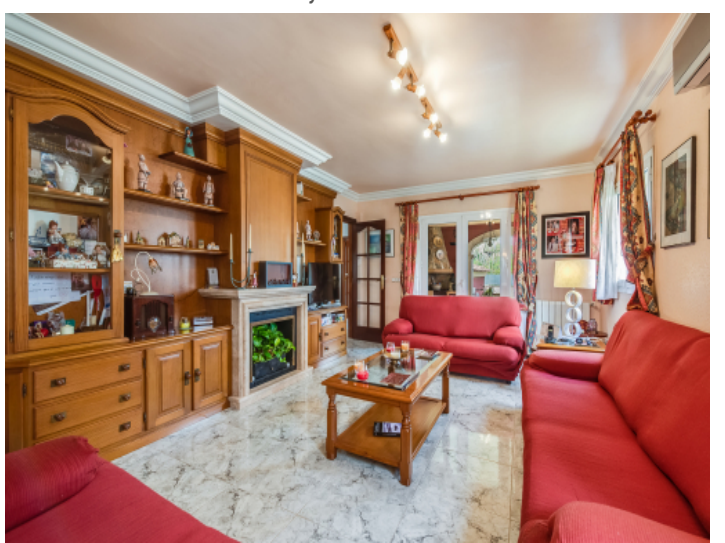
Large living area with access to a terrace