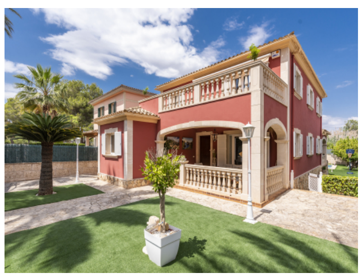
Lovely outdoor area