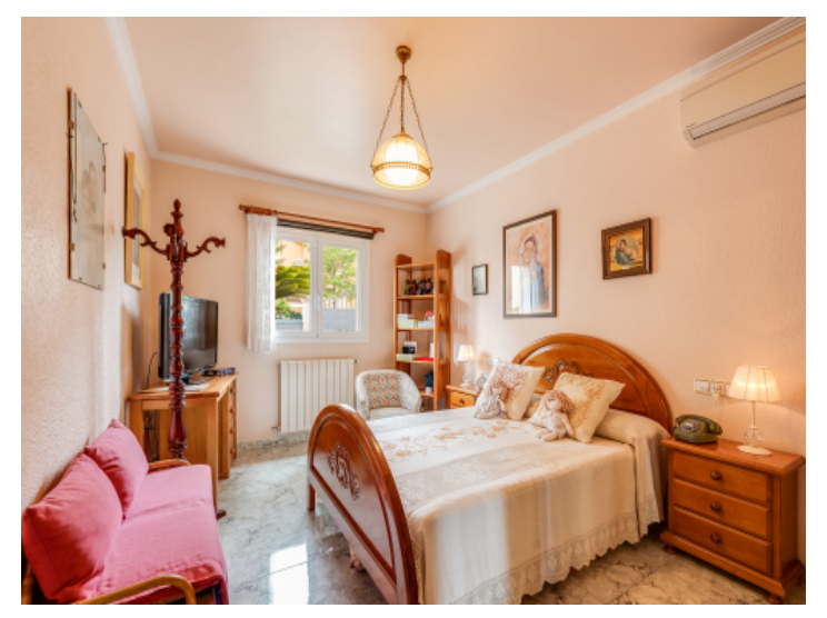
One of 5 bedrooms